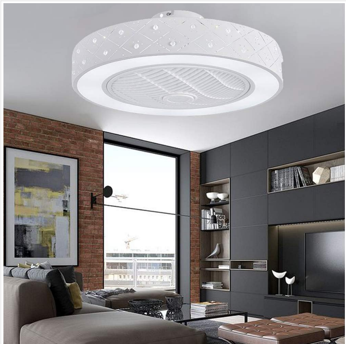
Image: The LITFAD ceiling fan installed in a modern living room, demonstrating its flush-mount appearance and how it integrates into a contemporary interior design.