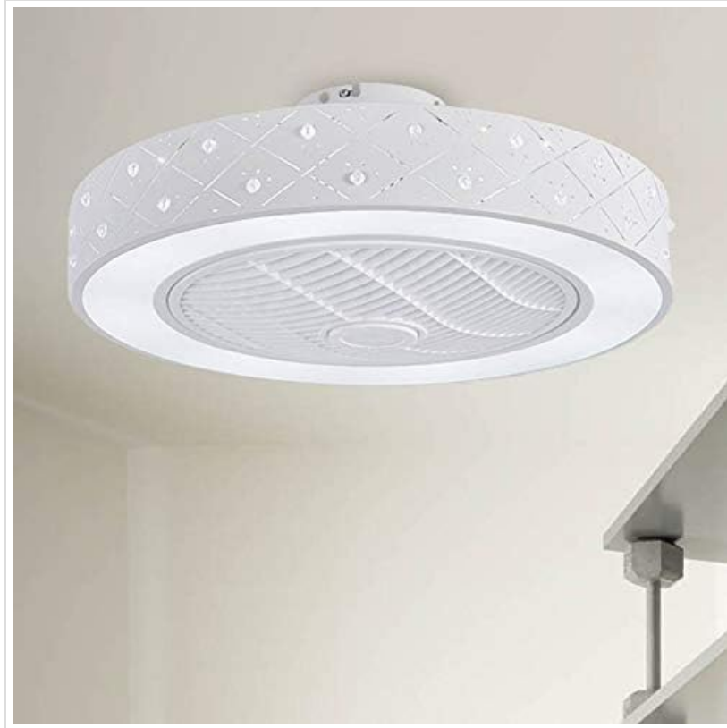
Image: The LITFAD 21.5 inch Modern Dimmable LED Ceiling Fan with Light, shown installed on a ceiling. The fan features a white, round design with a decorative outer ring and a central grille covering the hidden fan blades.

The LITFAD 21.5" Modern Dimmable LED Ceiling Fan combines a ceiling light and a fan in a compact, flush-mounted design. It features hidden blades for safety and a remote control for convenient operation.