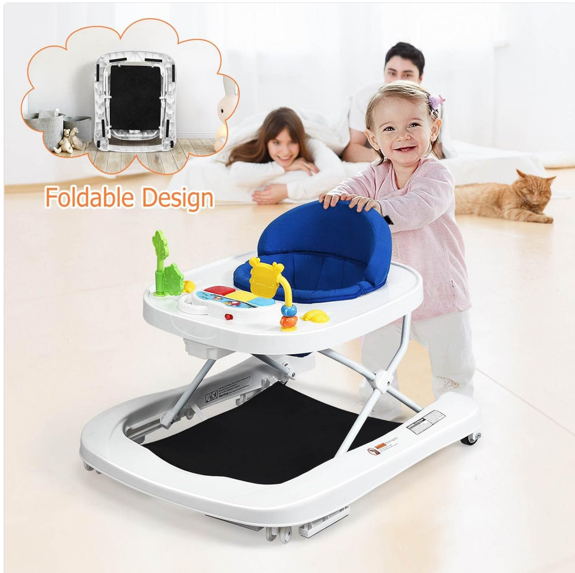
Figure 7.1: Foldable design for compact storage.