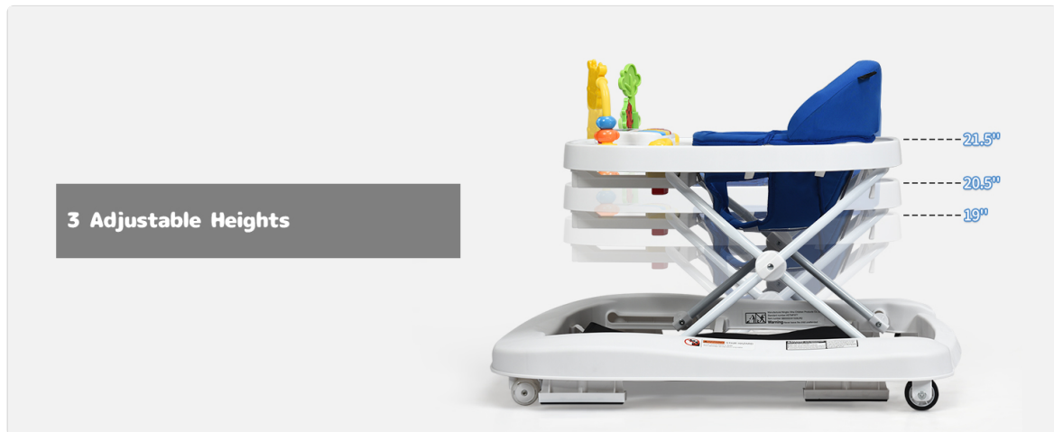
Figure 5.1: Three-position height adjustment.