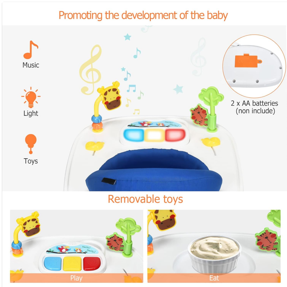
Figure 4.1: Activity tray in "Play" mode with music box and "Eat" mode with music box removed.