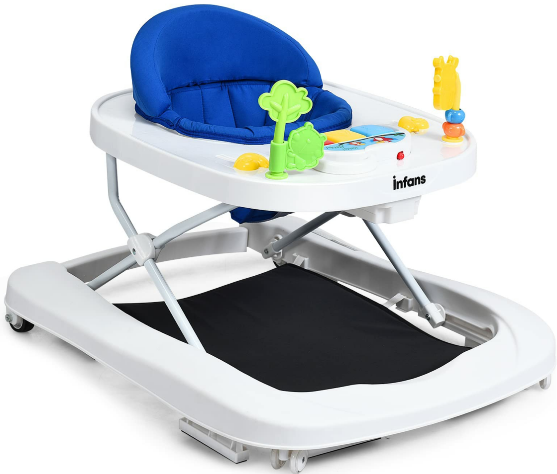
Figure 2.1: INFANS 3-in-1 Foldable Baby Walker (Blue model shown).