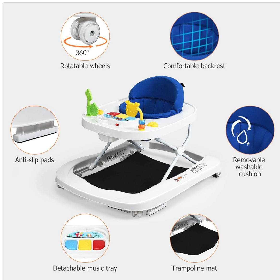
Figure 3.1: Overview of key components and their locations.