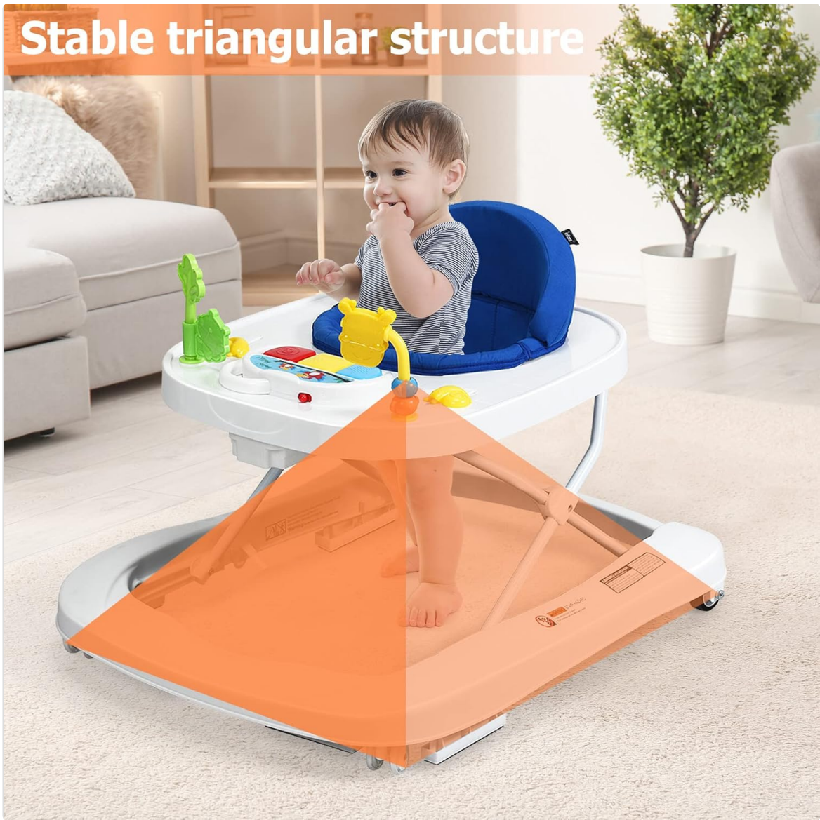
Figure 9.2: Stable triangular structure supporting up to 30 lbs.