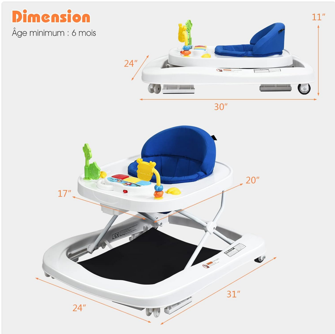
Figure 9.1: Product dimensions.