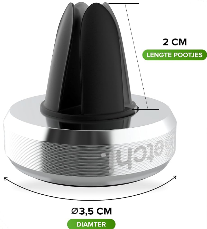
Image: Detailed view of the holder's compact dimensions and construction from premium metal and rubber.