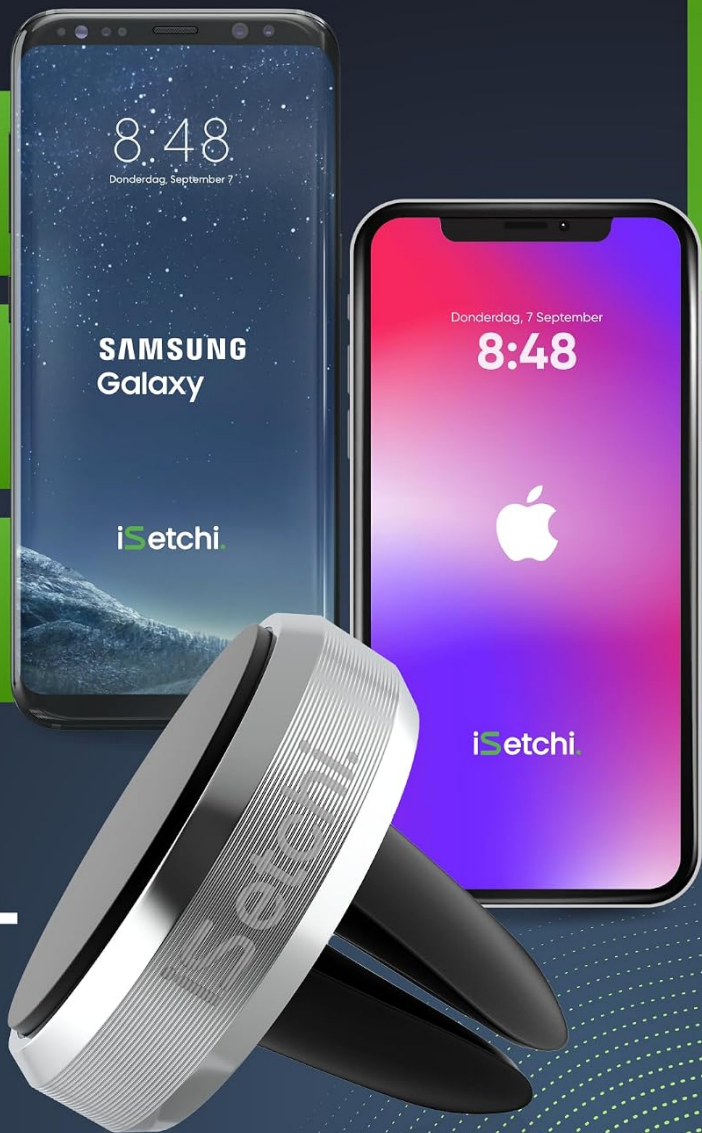
Image: The holder's universal design, compatible with various smartphones and supporting rotation and significant weight.