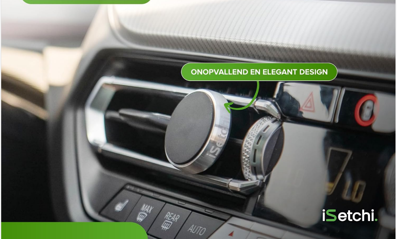
Image: The phone holder in a car, providing a clear and safe view of navigation and other applications.