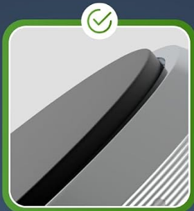
RUBBEREN ANTI-SCHOK LAAG