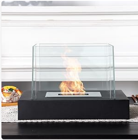
Image 3.2: The stainless steel burner insert, where the bioethanol fuel is poured.