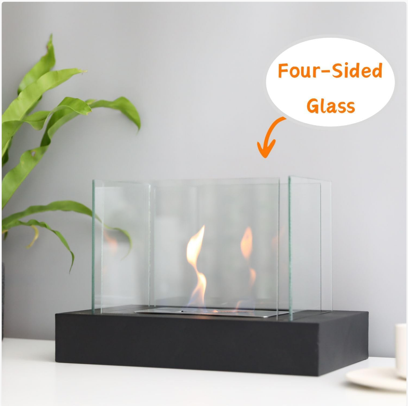
Image 3.1: The fireplace assembled, showing the four-sided glass enclosure that protects the flame and provides a clear view.