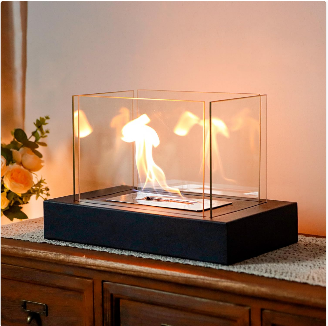
Image 1.1: The JHY DESIGN Portable Tabletop Bioethanol Fireplace, showcasing its real flame and modern design on a wooden surface.