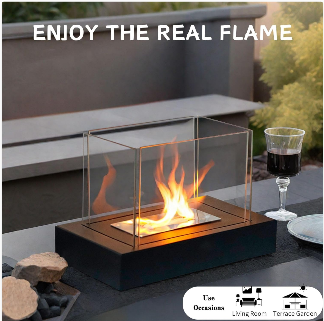
Image 4.2: The fireplace providing ambiance on an outdoor patio table, demonstrating its versatility.