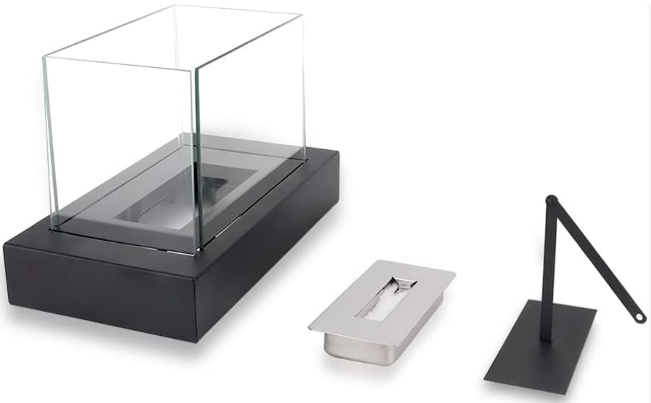
Image 1.2: All components included in the package: the black base, glass panels, stainless steel burner, and the flame extinguishing tool.