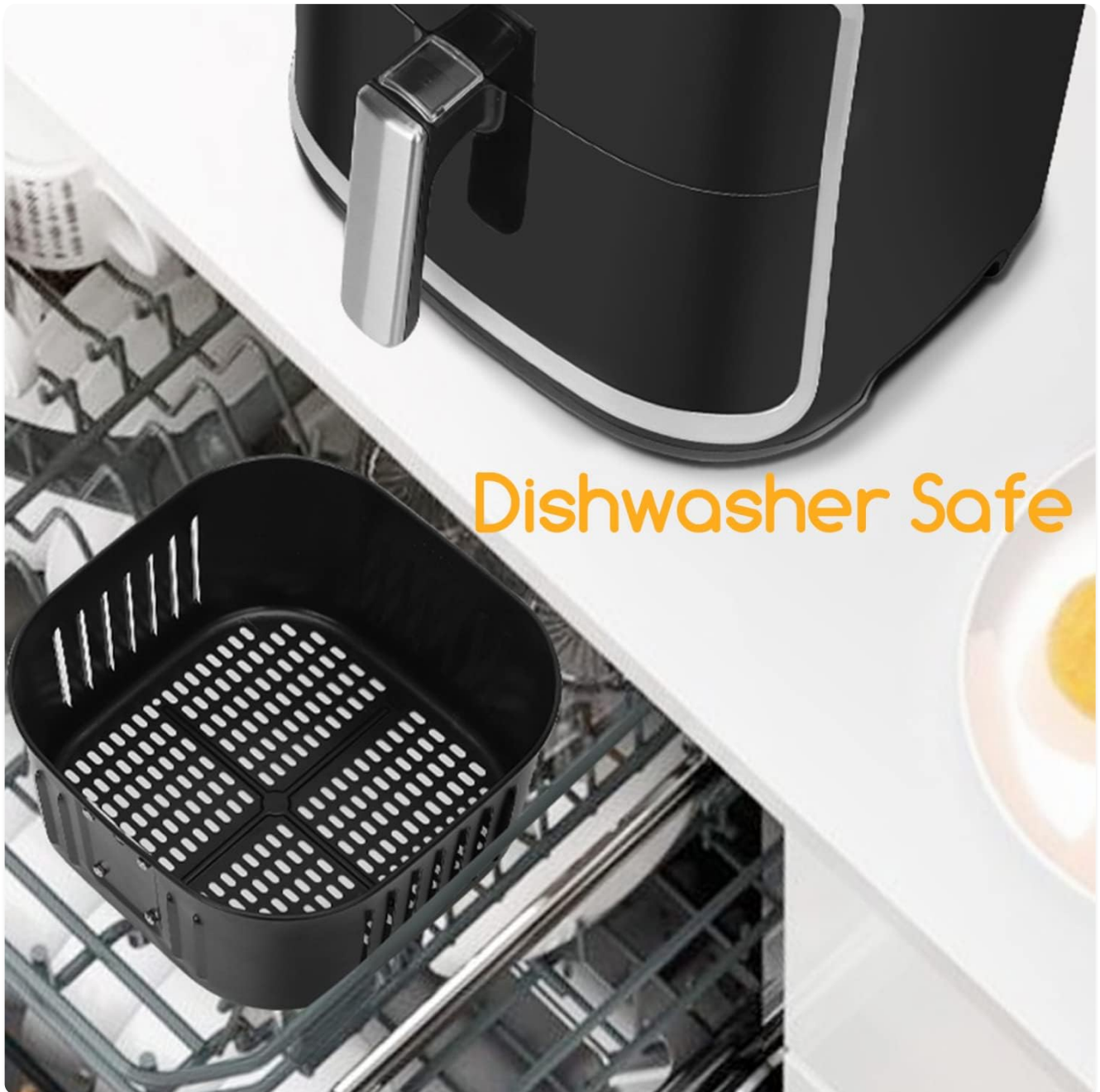
Figure 6: The nonstick basket of the Aigostar Air Fryer is shown being placed into a dishwasher, emphasizing its dishwasher-safe feature for easy cleanup after cooking.