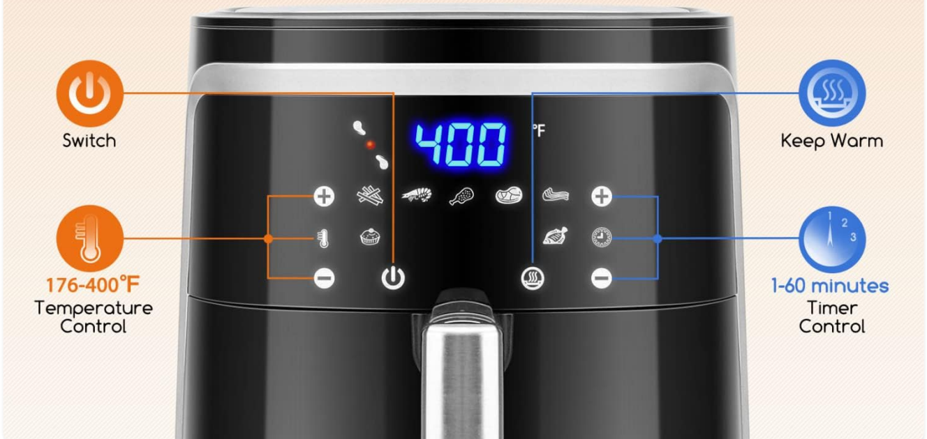
Figure 2: Close-up of the LED touchscreen control panel, highlighting the 8 preset cooking functions for various food types like breads, chicken, shrimp, seafood, fries, ribs, and steak, along with temperature and timer controls.