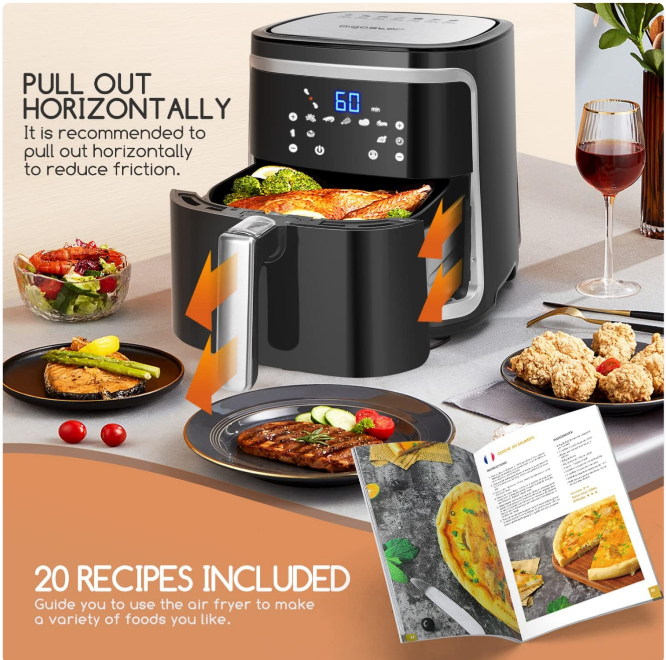
Figure 4: The air fryer's basket is designed to pull out horizontally, which is recommended to reduce friction and ensure smooth operation when checking or shaking food during cooking.