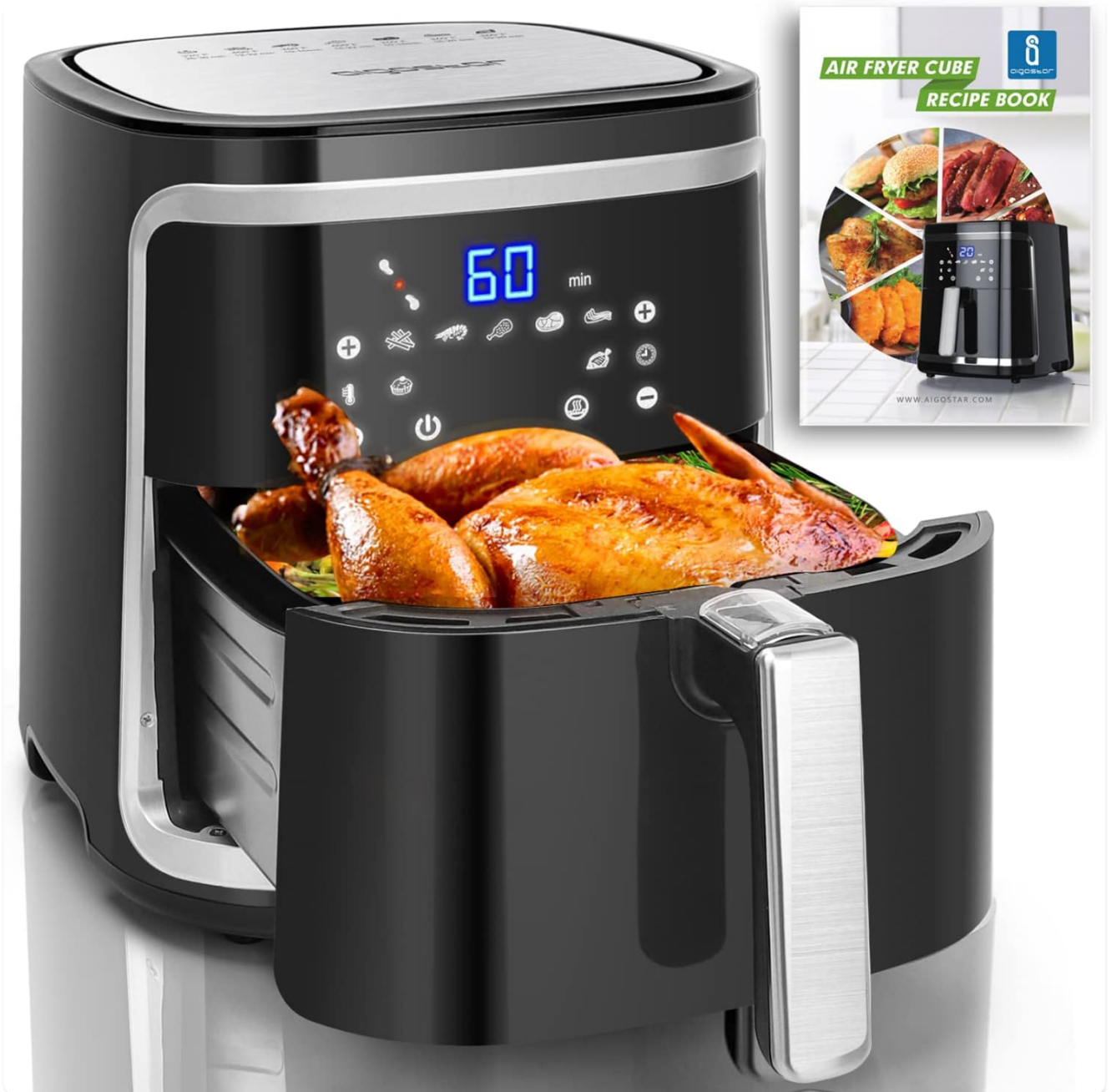
Figure 1: Main unit of the Aigostar 7.4 QT Air Fryer, showcasing its sleek black design and digital display with a whole chicken and fries inside the basket.