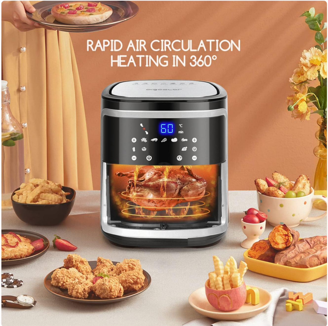
Figure 5: An internal view of the Aigostar Air Fryer demonstrating its 360-degree rapid air circulation technology, which ensures even cooking and crispy results without the need for excessive oil.

To use a preset, simply press the corresponding icon on the touchscreen. The air fryer will automatically set the optimal temperature and time for that food type. You can adjust these settings manually if desired.