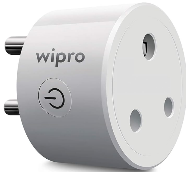
Image: Front view of the Wipro 10 Amp Smart Plug, showing the power button and plug configuration.