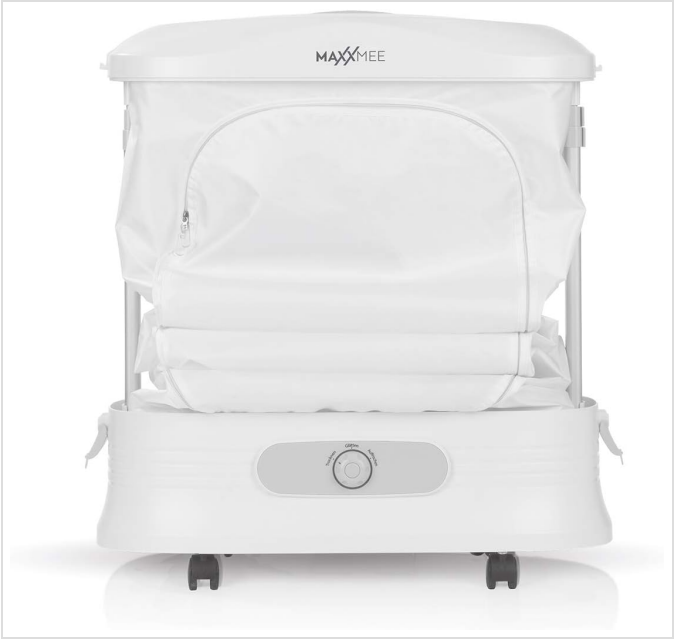
Image: The MAXXMEE Laundry Care Center shown in its fully folded configuration, highlighting its compact design for easy storage.

When not in use, the MAXXMEE Laundry Care Center can be folded for compact storage. Ensure the water reservoir is empty and the appliance is clean and dry before folding. Store in a cool, dry place.