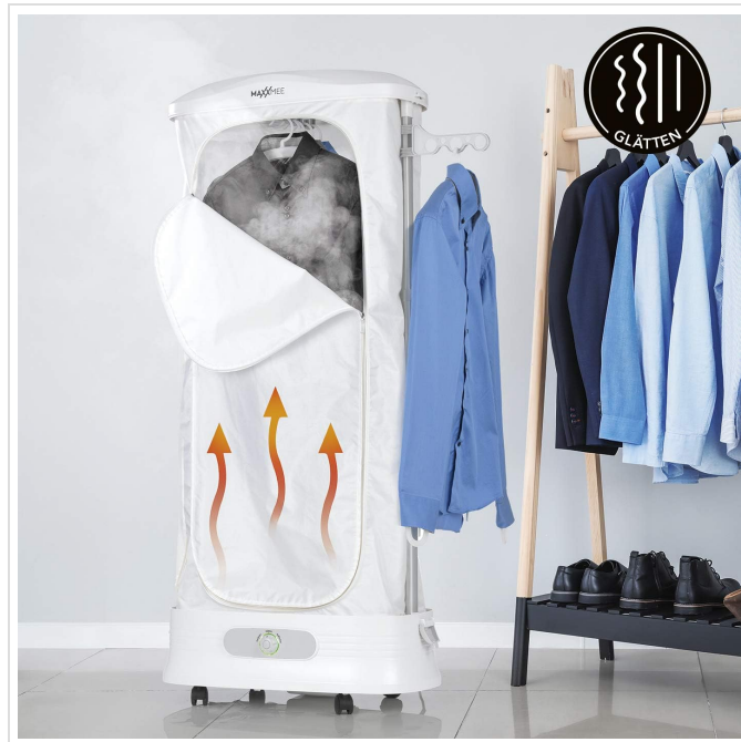
Image: The MAXXMEE Laundry Care Center in smoothing mode, indicated by a wavy lines icon, with a blue shirt being treated inside.