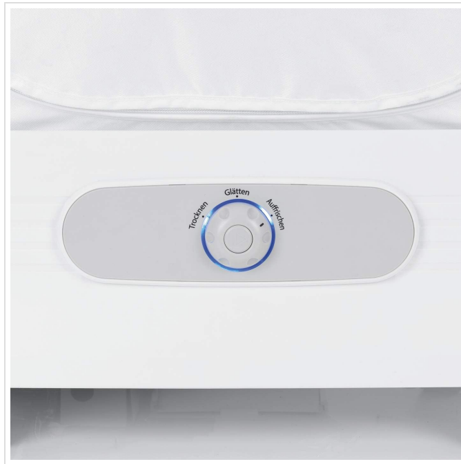
Image: A detailed view of the control dial on the MAXXMEE Laundry Care Center, showing the settings for Drying, Smoothing, and Refreshing.