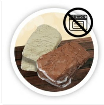
Image: Air-dry clay provided with the kit, which does not require baking.