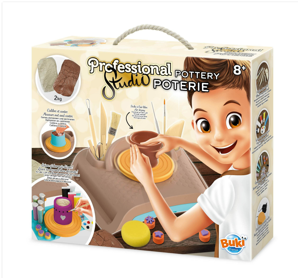
Image: Overview of the Buki Professional Pottery Studio 5426 kit and its components.