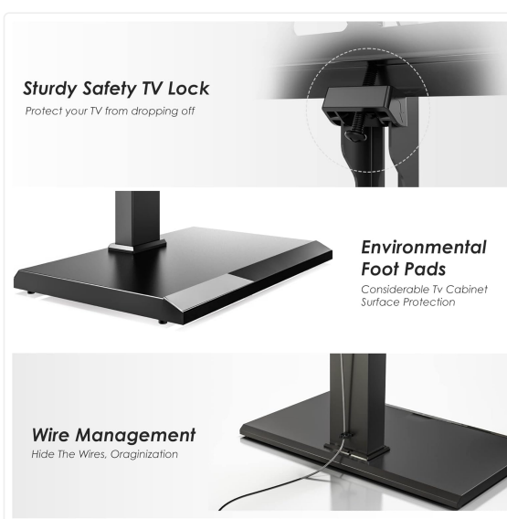
Image: Details of the stand's safety features, including the TV lock, protective foot pads, and cable management system.