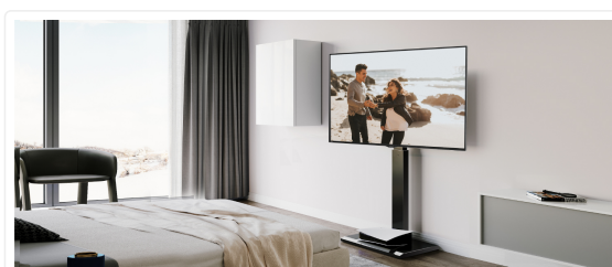
Image: Illustration of the 4-level height adjustment feature, allowing customization for optimal viewing.