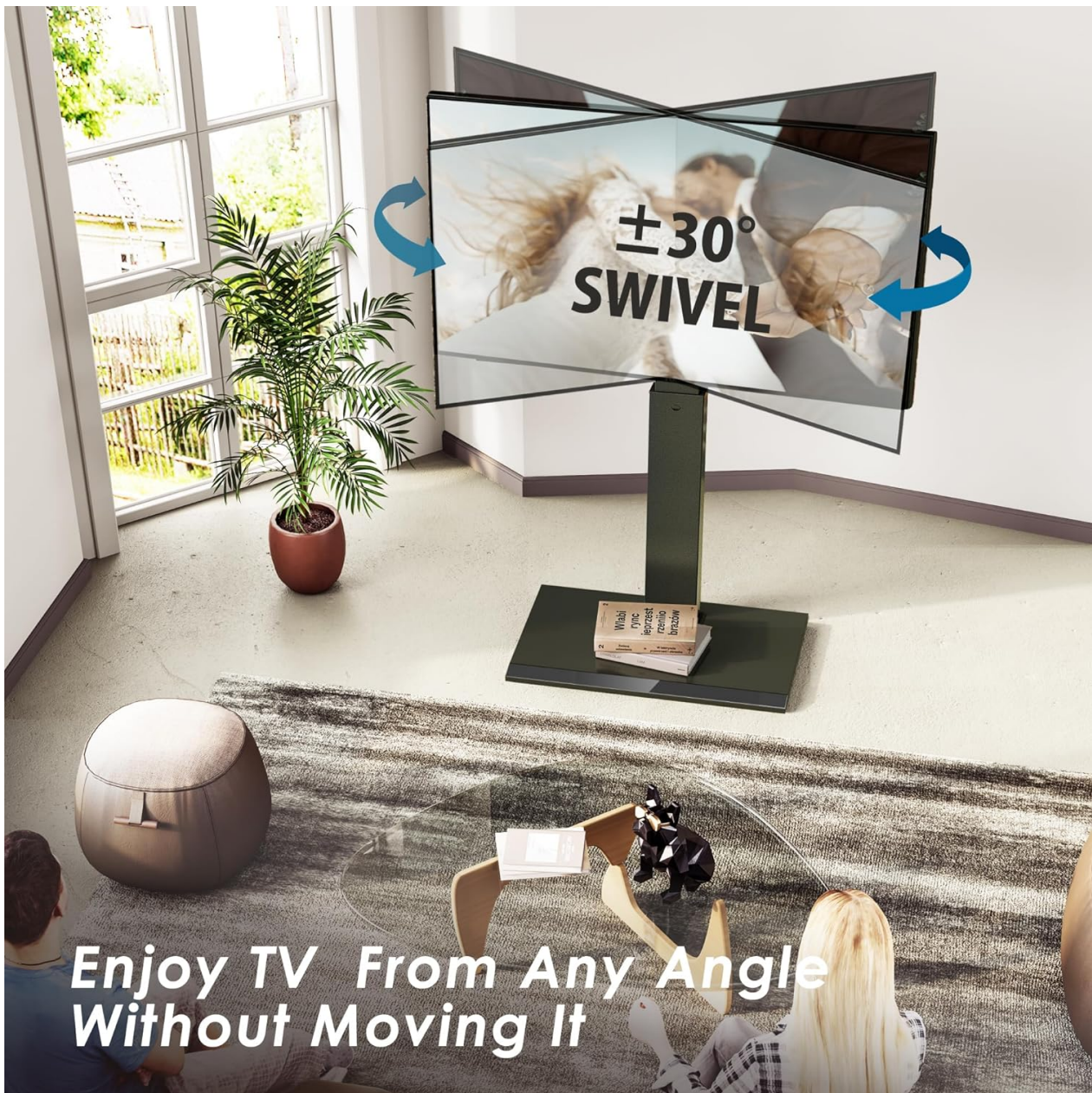
Image: The TV stand's swivel feature, allowing the television to rotate 30 degrees left or right for optimal viewing.