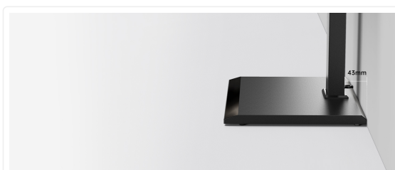
Image: Detailed view of the swivel mechanism, enabling easy rotation of the TV.