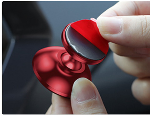
Image: Removing adhesive backing.