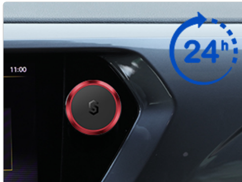
Image: Wait 24 hours for adhesive to set.