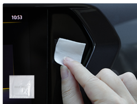
Image: Cleaning the dashboard surface.