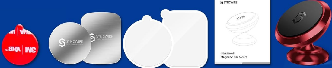
Image: Included components of the SYNCWIRE Magnetic Phone Car Mount.