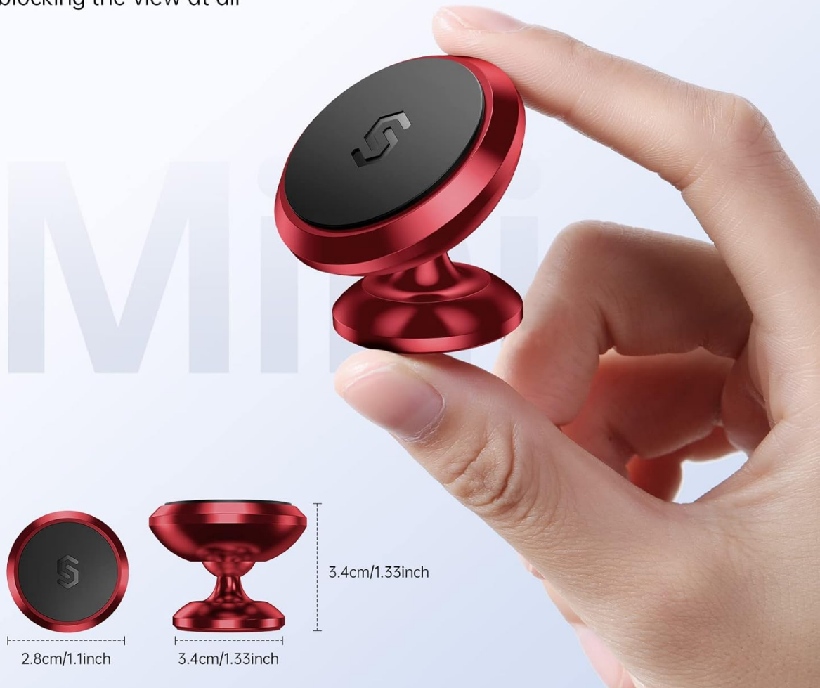
Image: Mini size and space-saving design.

Stick it on the dashboard without blocking the view at all