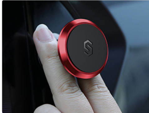
Image: Attaching the mount to the dashboard.