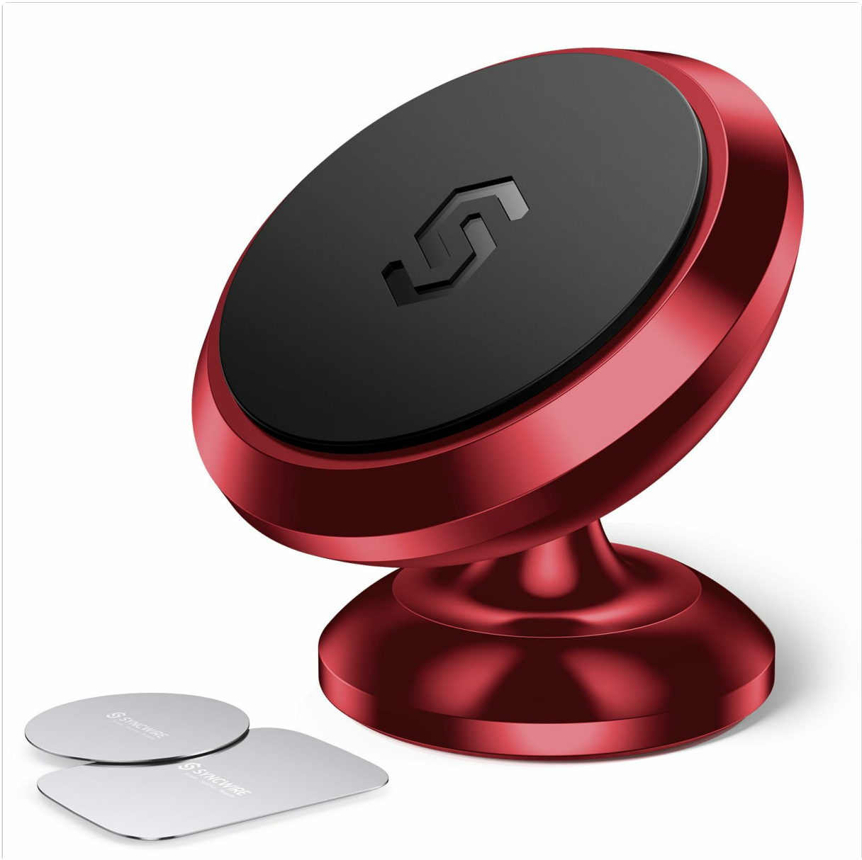
Image: Enhanced N52 Neodymium Magnets for superior hold.