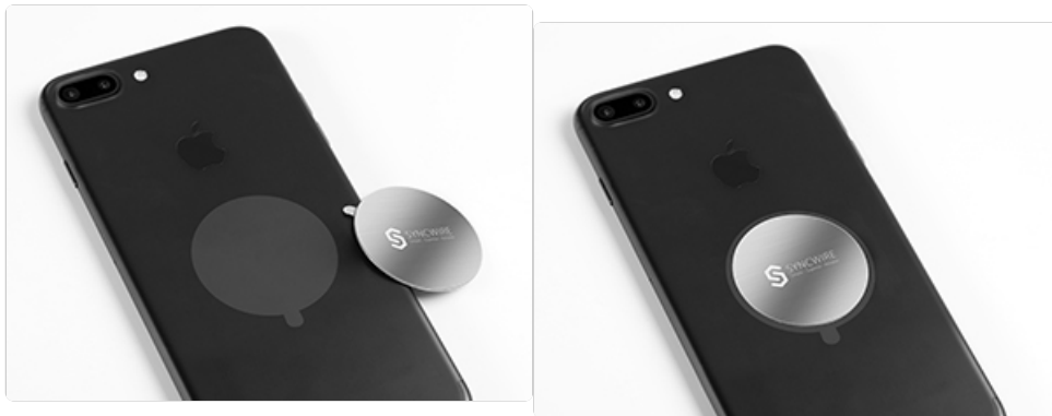
Image: Attaching the metal plate to the phone.

Note on Wireless Charging: Attaching a metal plate directly to your phone may interfere with wireless charging capabilities. If wireless charging is essential, consider placing the metal plate between your phone and a non-metallic case, ensuring it does not cover the wireless charging coil area.