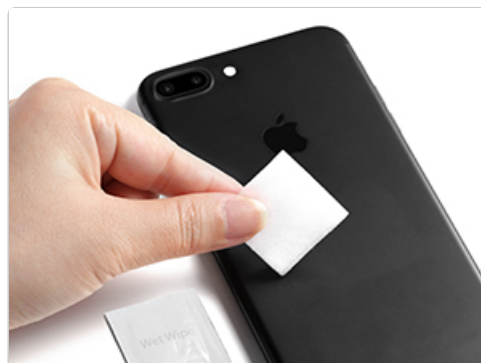
Image: Cleaning the phone surface.