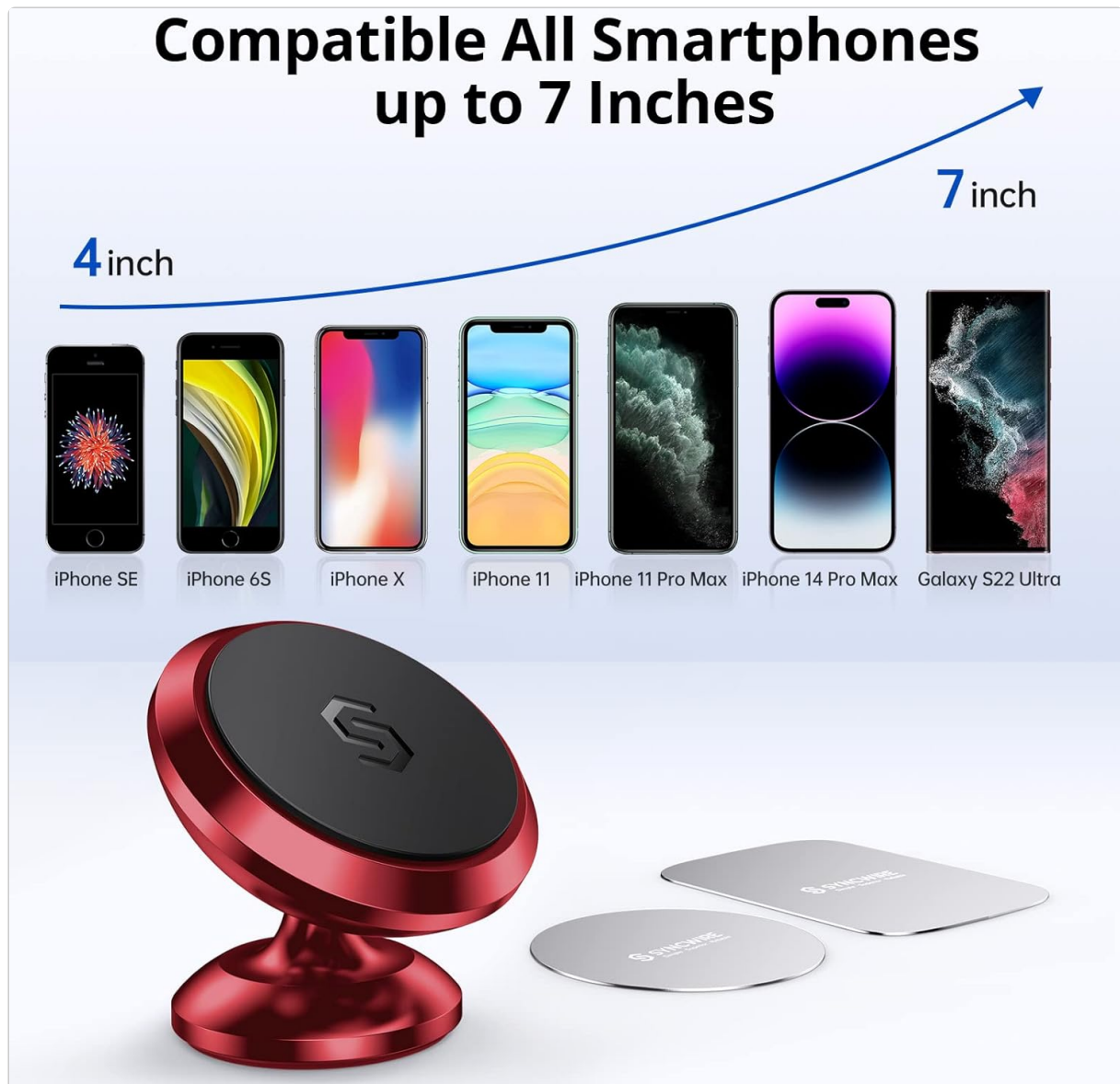
Image: Broad compatibility with smartphones up to 7 inches.