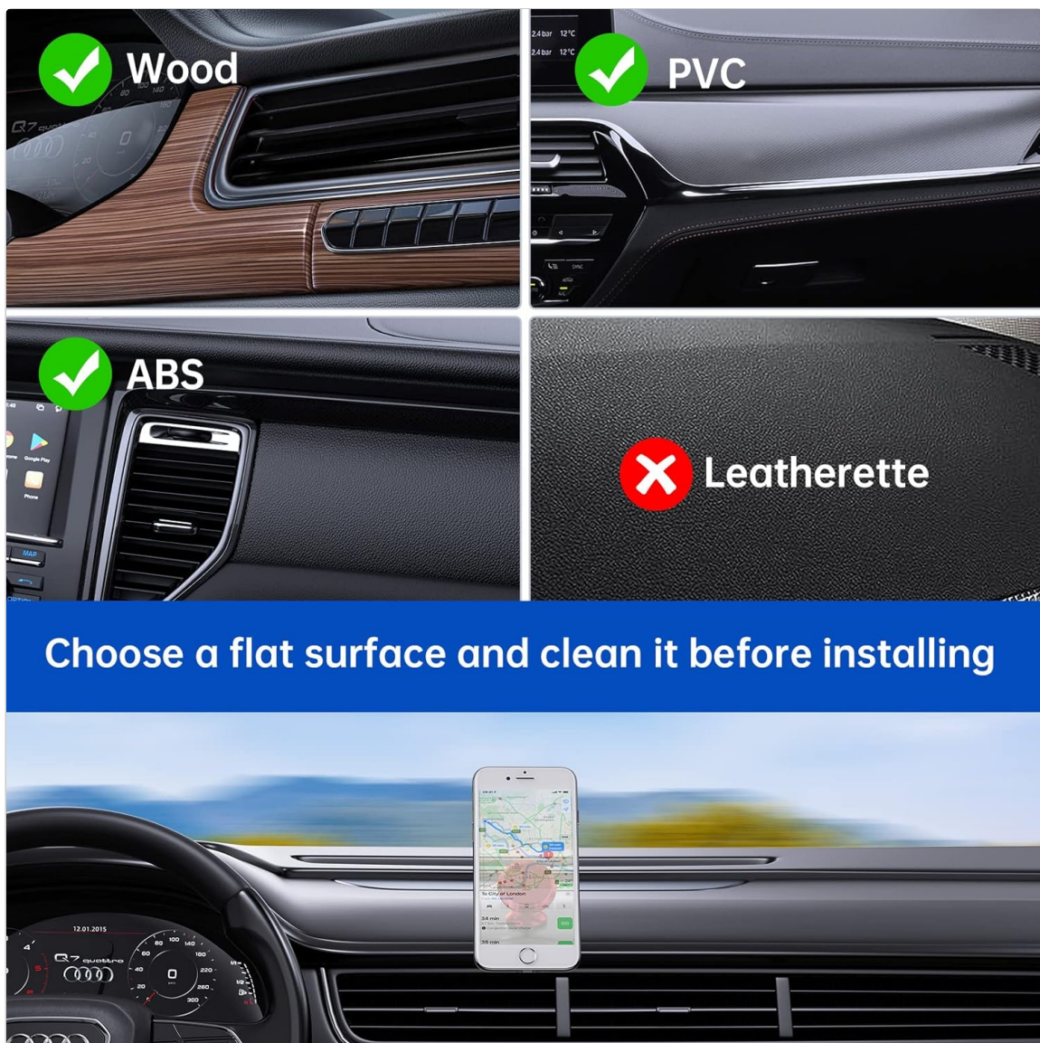
Image: Recommended dashboard surfaces for installation.