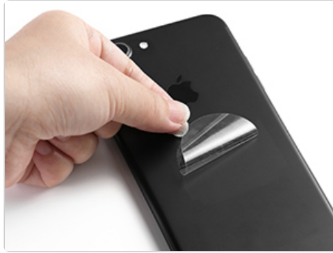
Image: Applying the protective film.