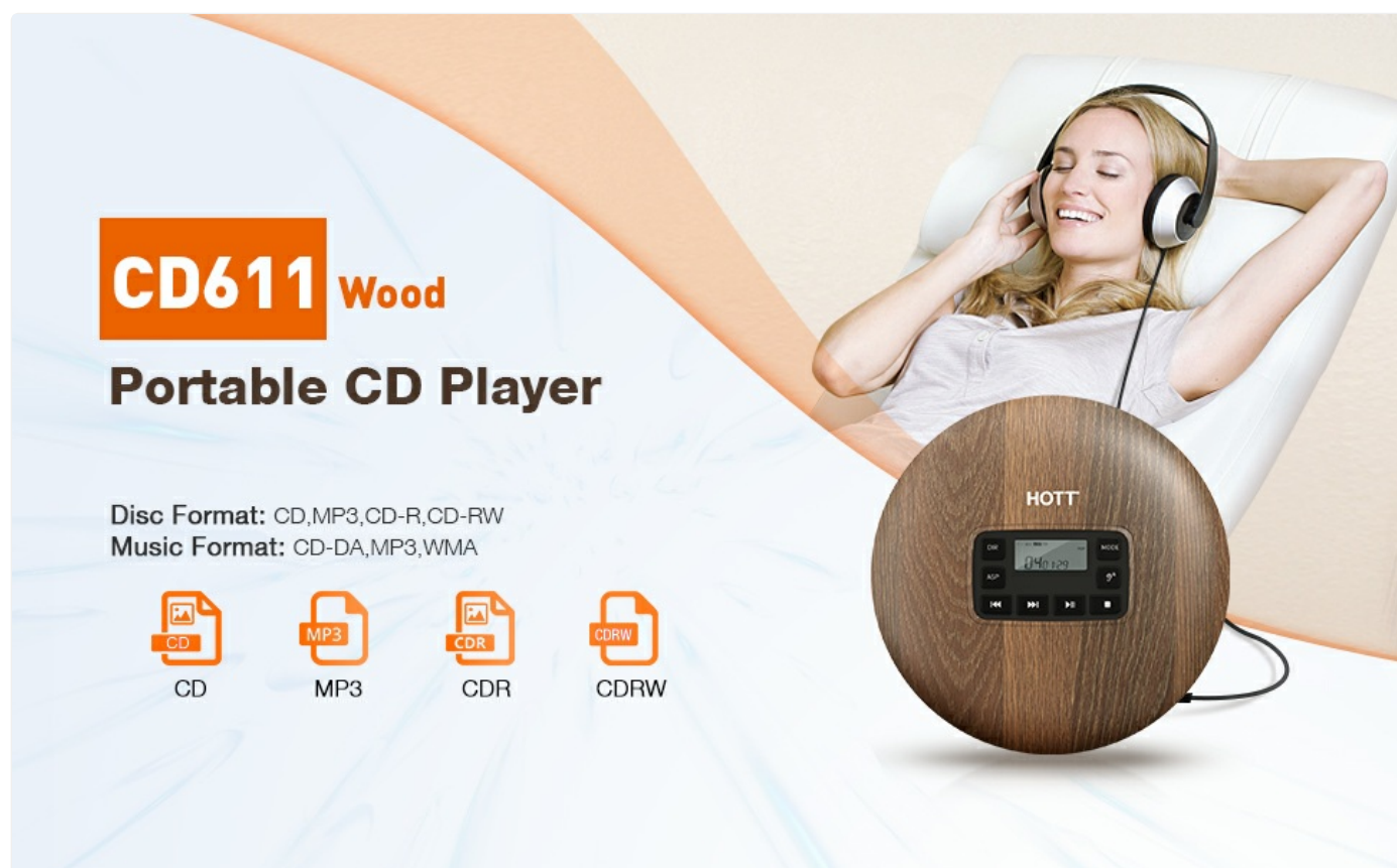
Image: The HOTT CD611 Portable CD Player with icons indicating compatibility with CD, MP3, CD-R, and CD-RW disc formats.

Gently slide the "OPEN" switch on the side of the player to open the disc cover. Place your CD, CD-R, CD-RW, or MP3 disc onto the spindle, ensuring it is seated correctly. Close the disc cover firmly until it clicks.