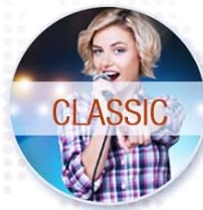
Image: A visual representation of the HOTT CD611's stereo sound quality and the five available sound effects: BBS (Bass Boost System), Pop, Jazz, Rock, and Classic.