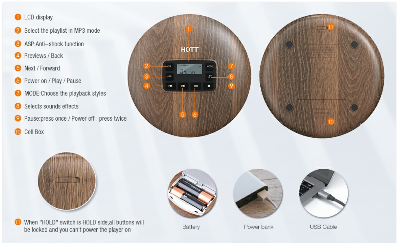
Image: A detailed diagram illustrating the various controls and features of the HOTT CD611 Portable CD Player, including the LCD display, control buttons, and the battery compartment on the underside.