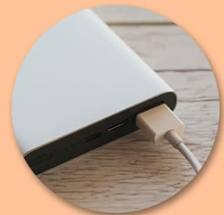
Mobile power supply

Image: Illustrations showing the various power options for the HOTT CD611, including AA batteries (not included), connection to a USB charger, a notebook computer, or a mobile power supply.