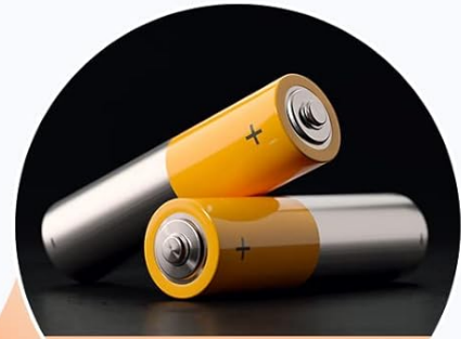
AA Battery Power Supply