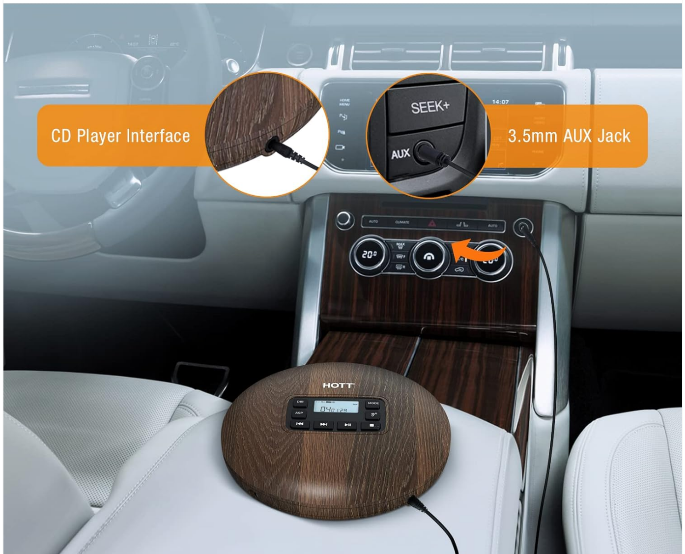
Image: The HOTT CD611 Portable CD Player demonstrating its anti-skip protection feature and how to connect it to a car's audio system using a 3.5mm AUX cable.