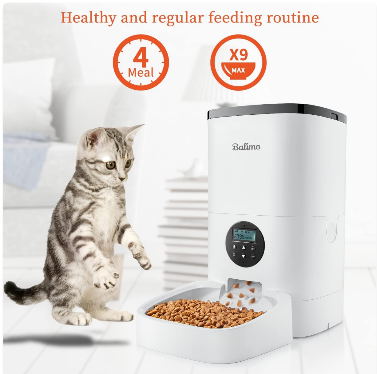
Image 5.1: The feeder's capability for scheduling up to 4 meals with adjustable portion sizes for a healthy feeding routine.