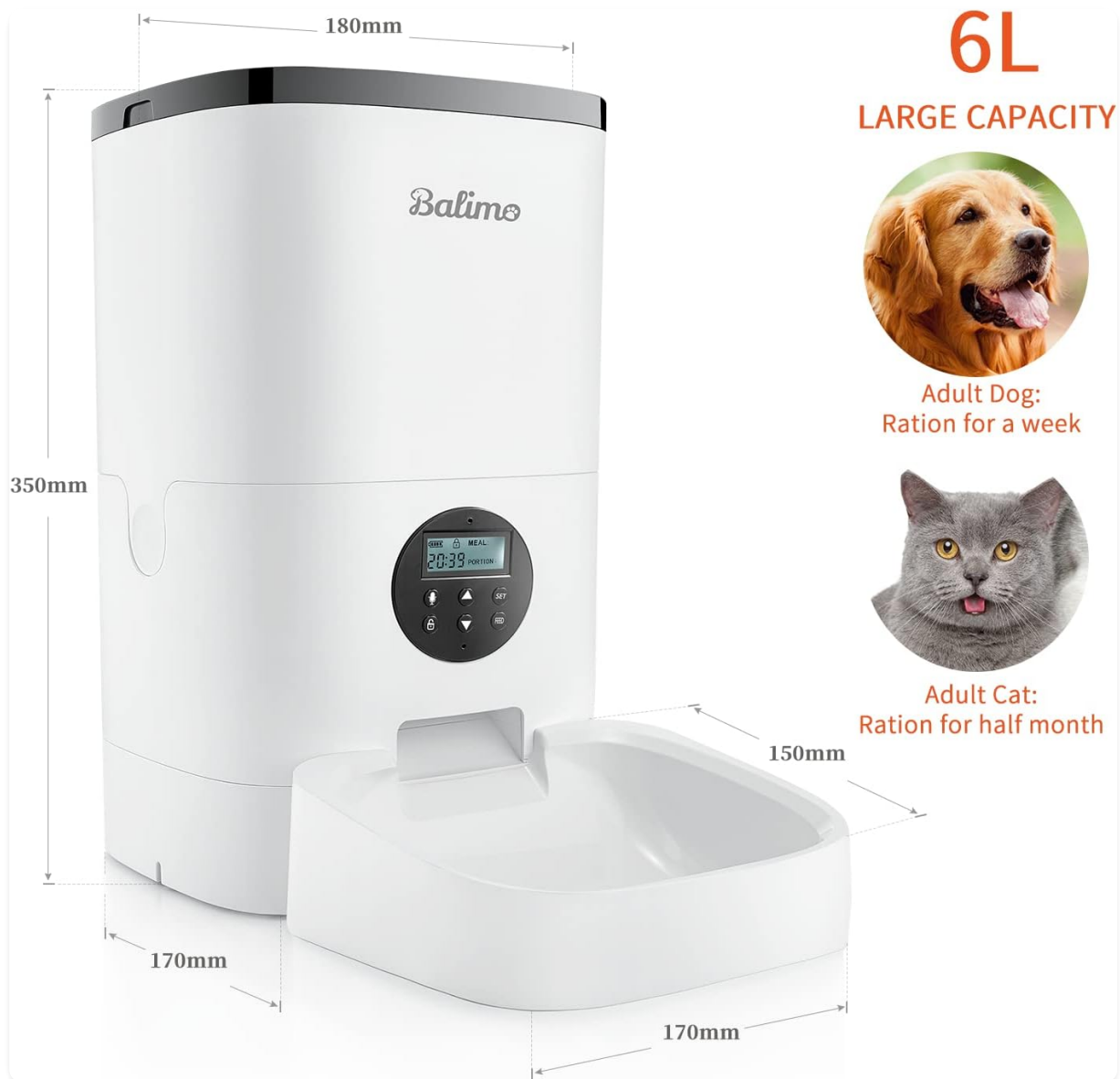
Image 3.2: Dimensions and capacity of the Balimo Automatic Pet Feeder, highlighting its suitability for both dogs and cats.