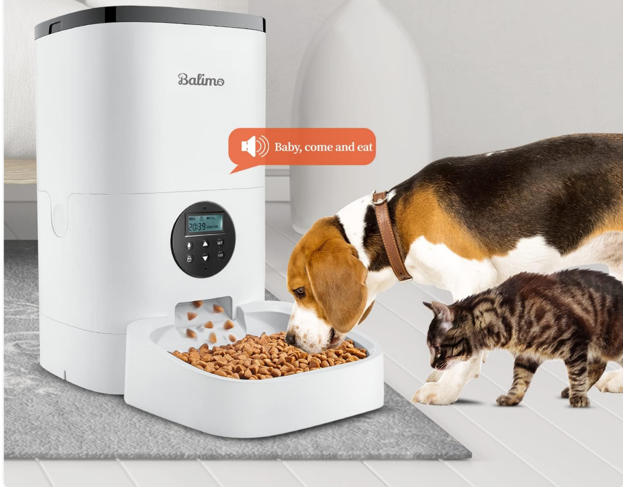
Image 3.1: The Balimo Automatic Pet Feeder in use, demonstrating the 10-second voice recording function to call pets for meals.