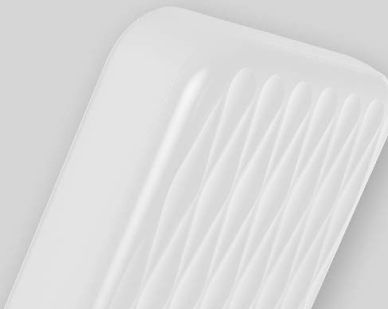
Image: Close-up view of the DUDAO K10S power bank, highlighting its LED power display and the geometrically twisted, smooth surface design.