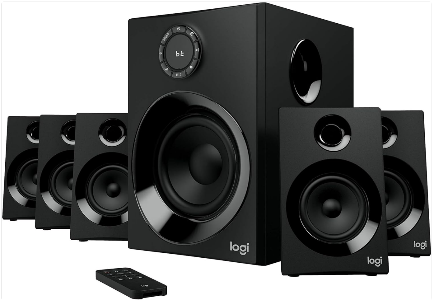
Image: The Logitech Z606 5.1 Surround Sound Speaker System, showing the central subwoofer, five satellite speakers, and the remote control. This illustrates the complete system.