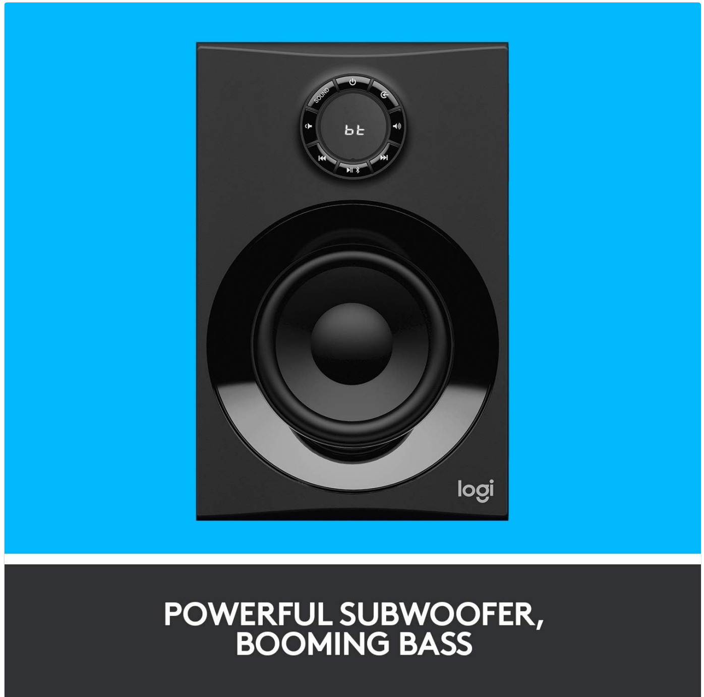
Image: A close-up view of the Logitech Z606 subwoofer's control panel, featuring the main volume dial, input selection buttons, and indicators for Bluetooth connectivity.

The Z606 allows independent control over the volume of the front, rear, and center speakers, as well as the subwoofer. Use the remote control or the subwoofer's control panel to adjust these levels to your preference for balanced surround sound.