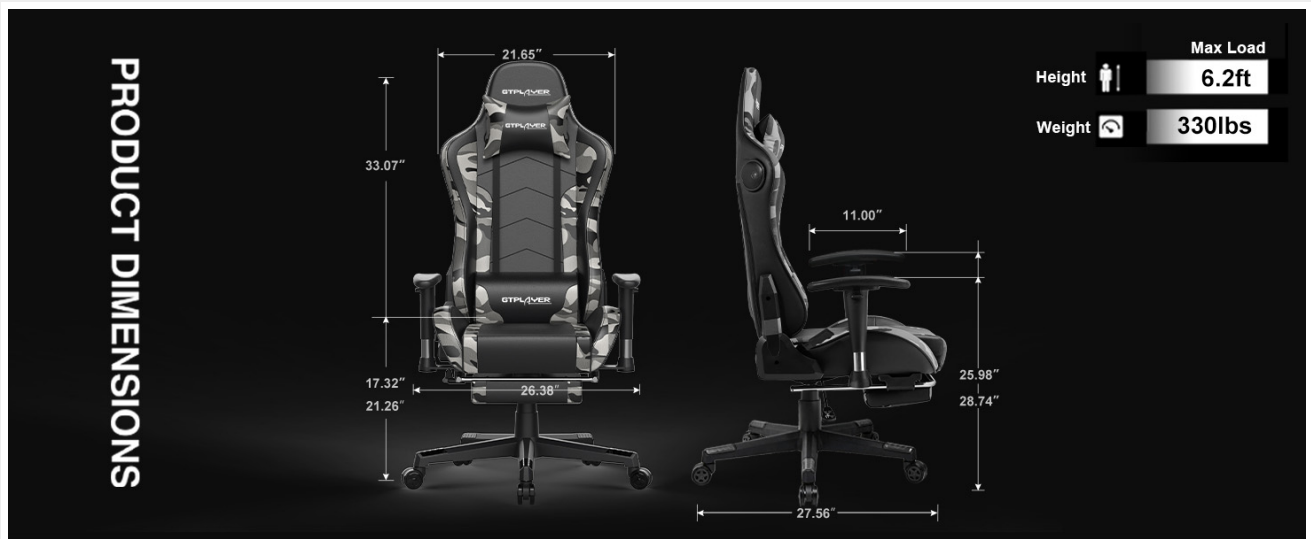
Image: A detailed diagram showing various dimensions of the GTRACING GT890MF Gaming Chair, including seat height, armrest height, and backrest height, along with maximum load capacity (330 lbs) and recommended user height (6.2 ft).