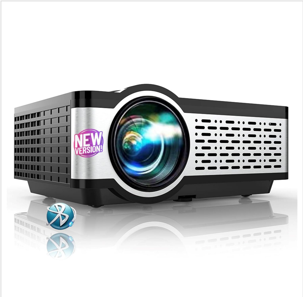
Image 1: Front view of the E Gate i9 Pro-Max 4X Projector, showcasing the lens and ventilation grilles.

The E Gate i9 Pro-Max 4X Projector features a compact design with various input/output ports for versatile connectivity.