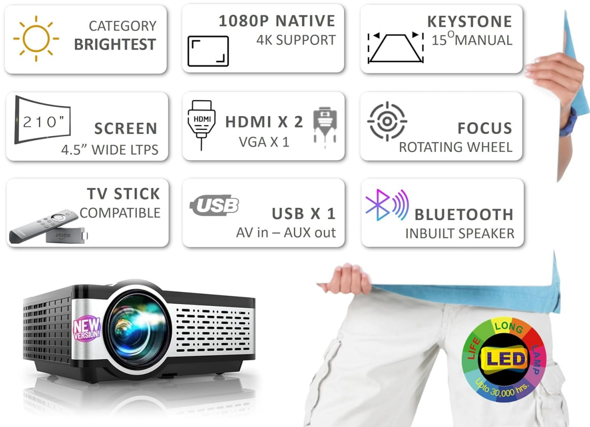
Image 2: Rear and side view of the projector, highlighting the various input and output ports.