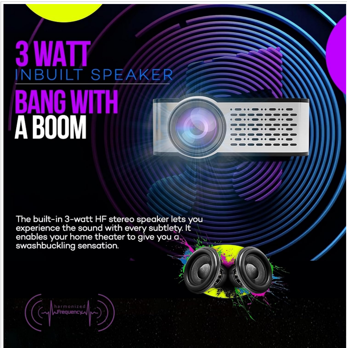
Image 6: Illustration highlighting the projector's built-in speaker for audio output.