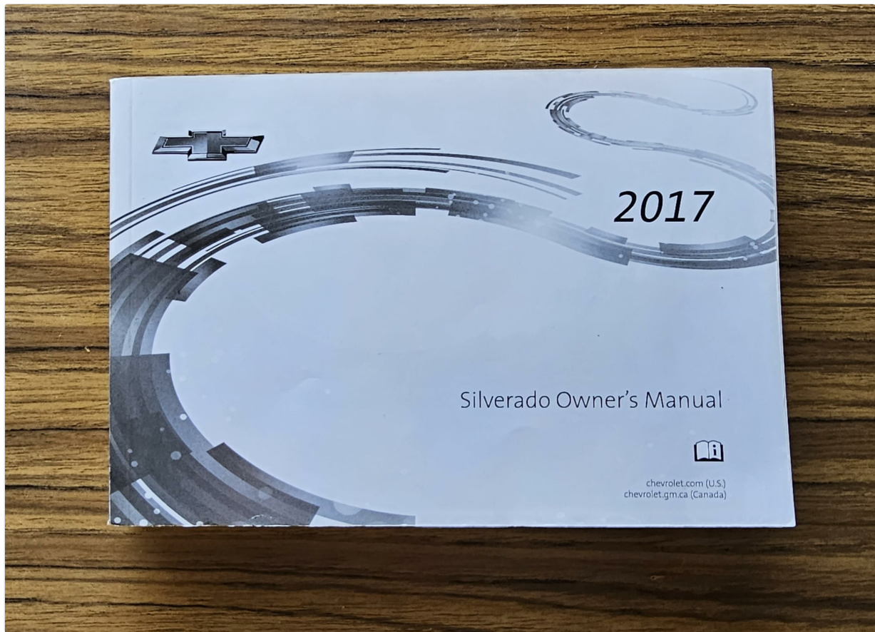
Image: The cover of the main 2017 Chevrolet Silverado Owner's Manual, indicating the primary reference document for all vehicle information.