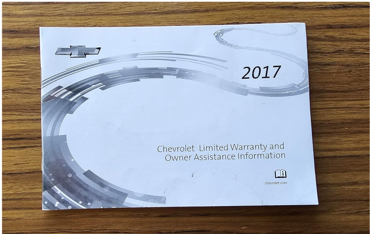
Image: The cover of the "Chevrolet Limited Warranty and Owner Assistance Information" booklet, which contains important details regarding vehicle warranty and support services.

For additional service information and to simplify maintenance, you may visit the official Chevrolet Certified Service website: Chevrolet Certified Service .