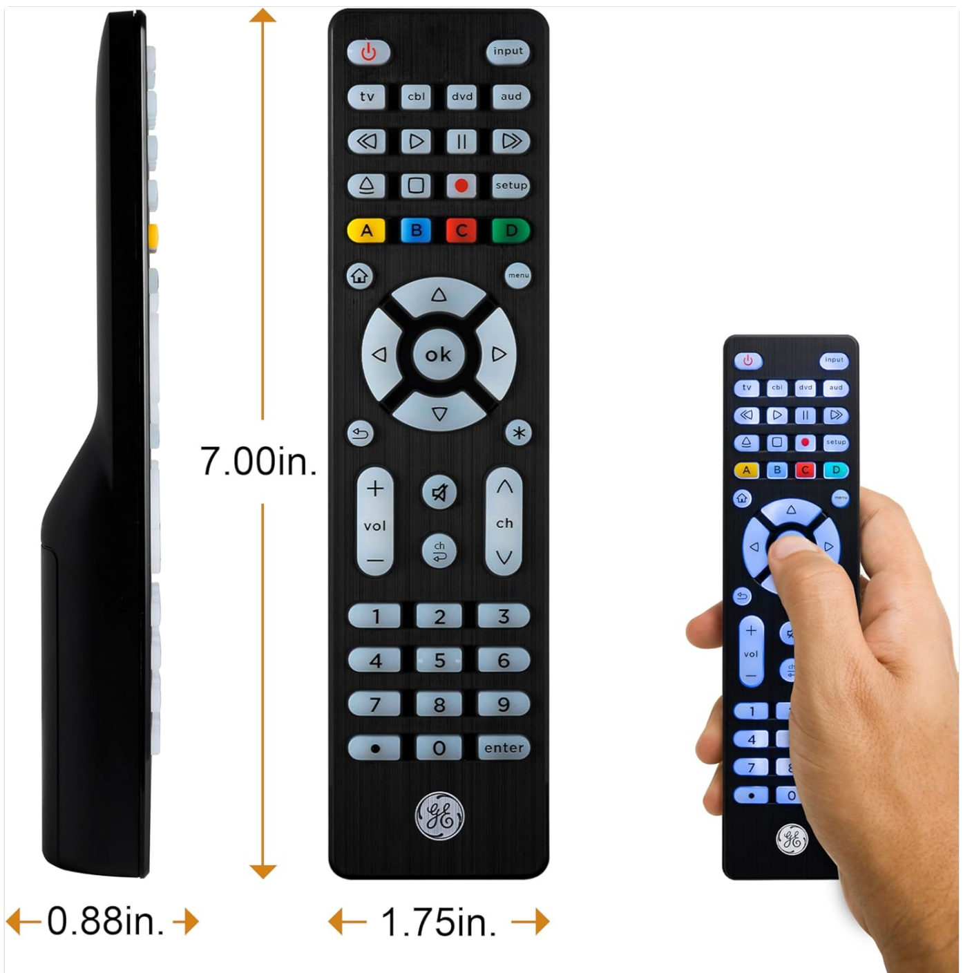
Image: A diagram illustrating the dimensions of the GE Universal Remote Control: 7.00 inches in length, 1.75 inches in width, and 0.88 inches in thickness.