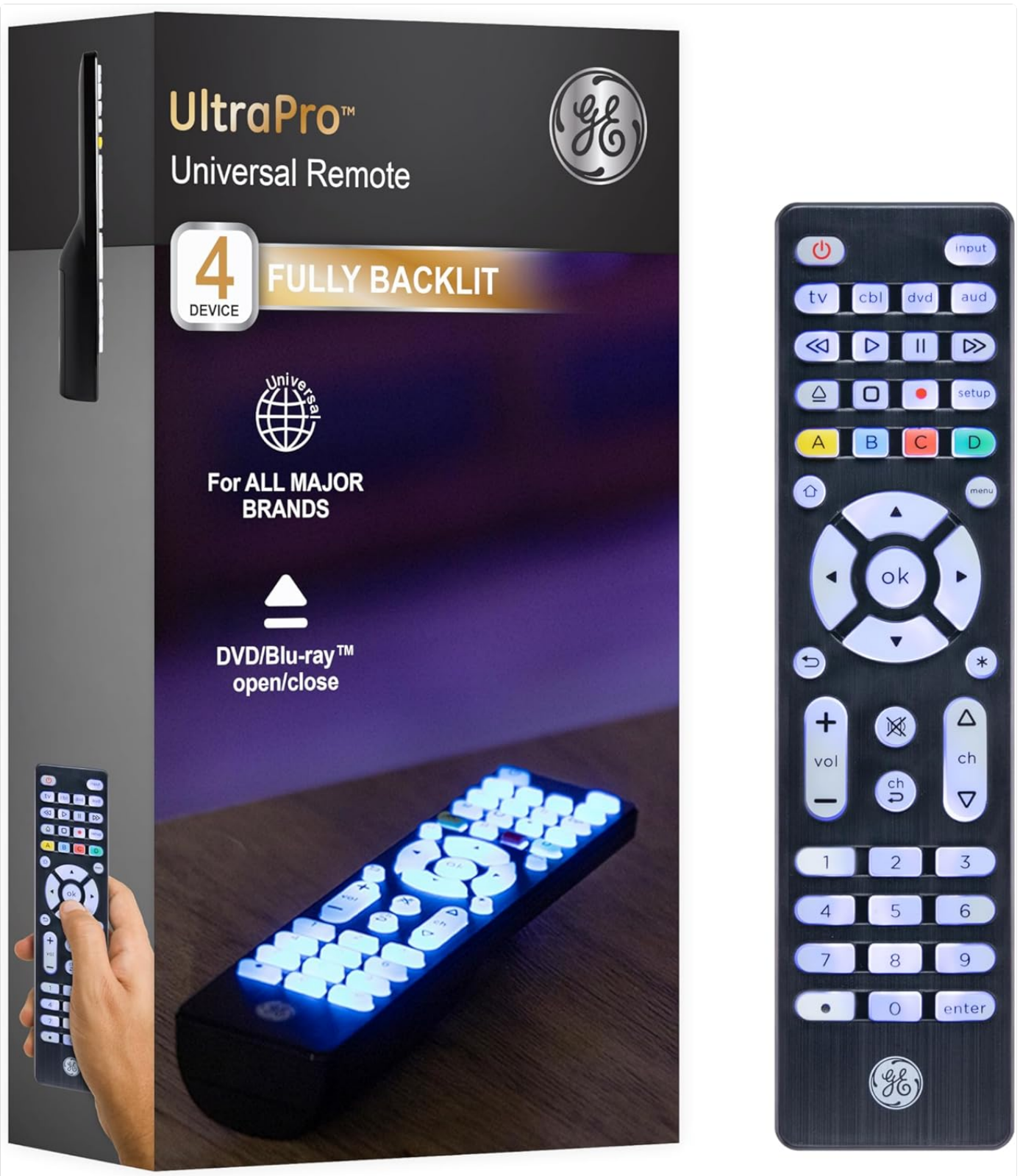
Image: The GE 4-Device Universal Remote Control in its packaging, highlighting its backlit buttons and multi-device capability. The remote itself is shown on the right.