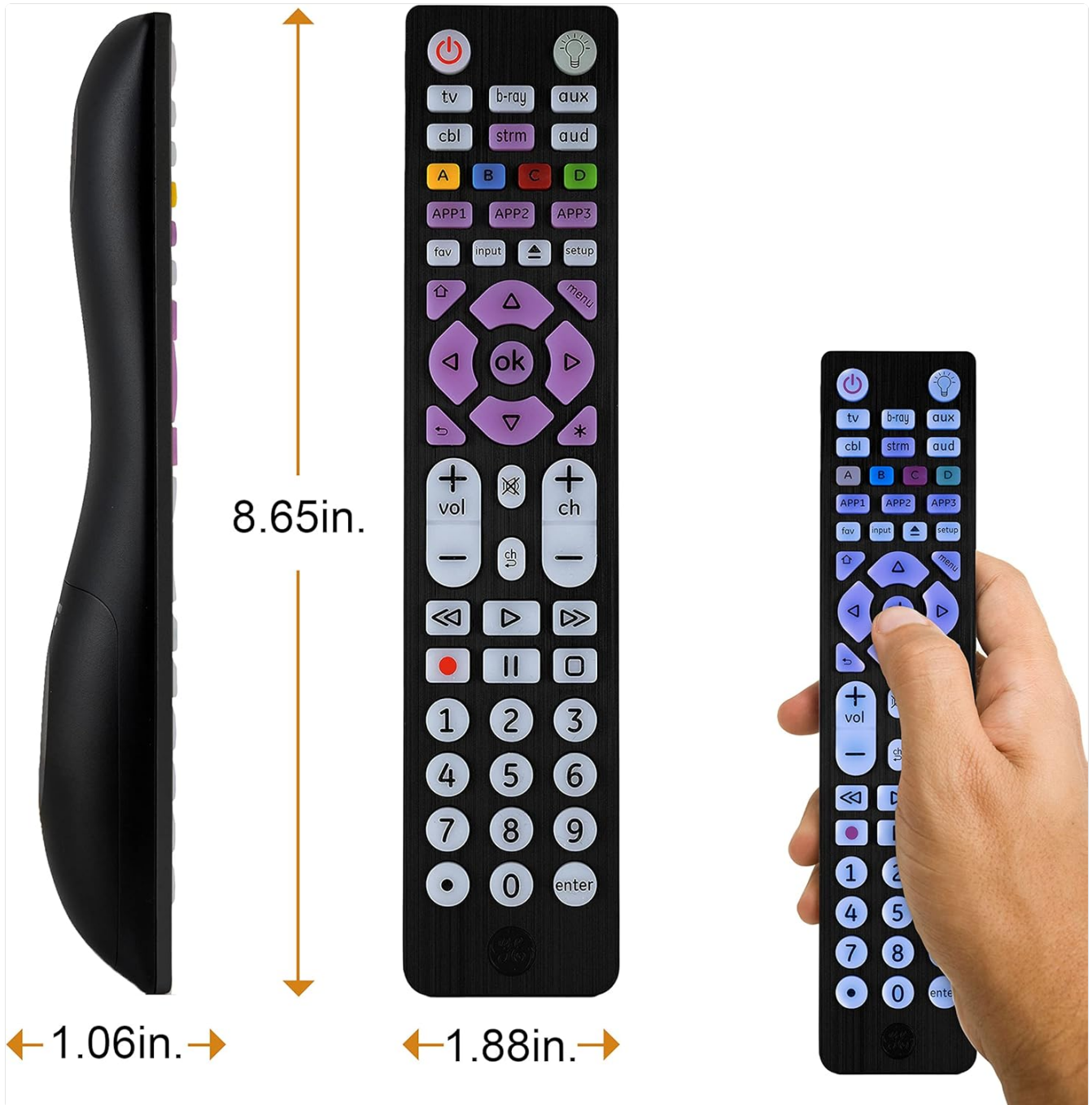
Figure 6: Physical dimensions of the remote control: approximately 8.65 inches long, 1.88 inches wide, and 1.06 inches deep.