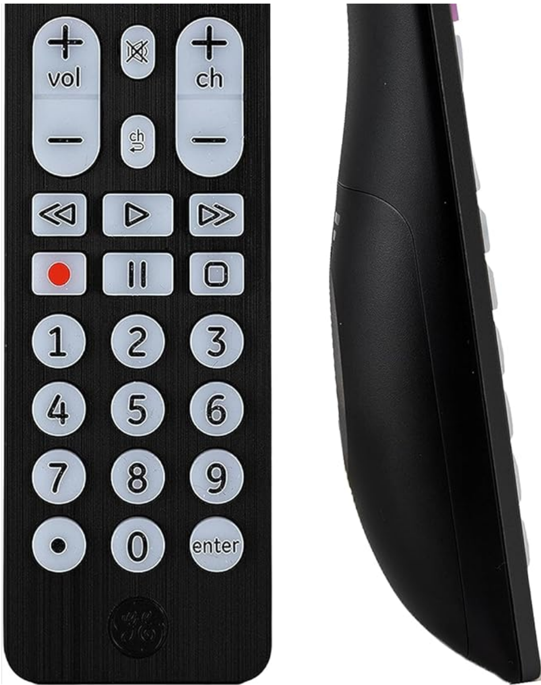
Figure 1: Front and side view of the UltraPro GE 6-Device Backlit Universal Remote Control. The remote is black with purple and white buttons, featuring a sleek, ergonomic design.