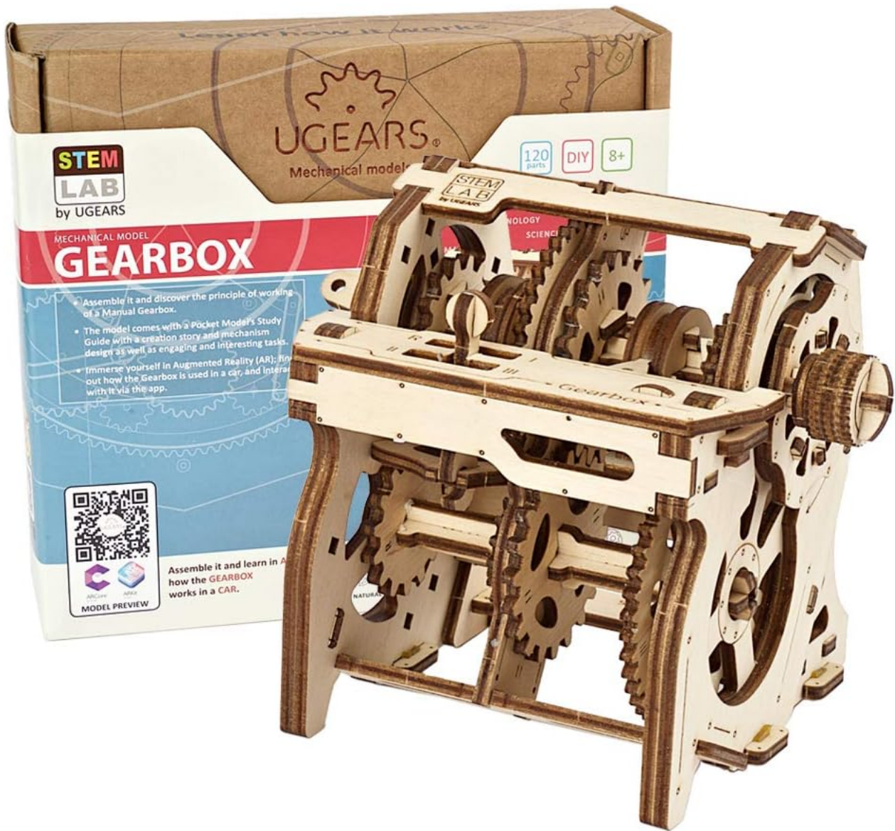
Figure 1: The fully assembled UGEARS STEM Gearbox Model Kit.