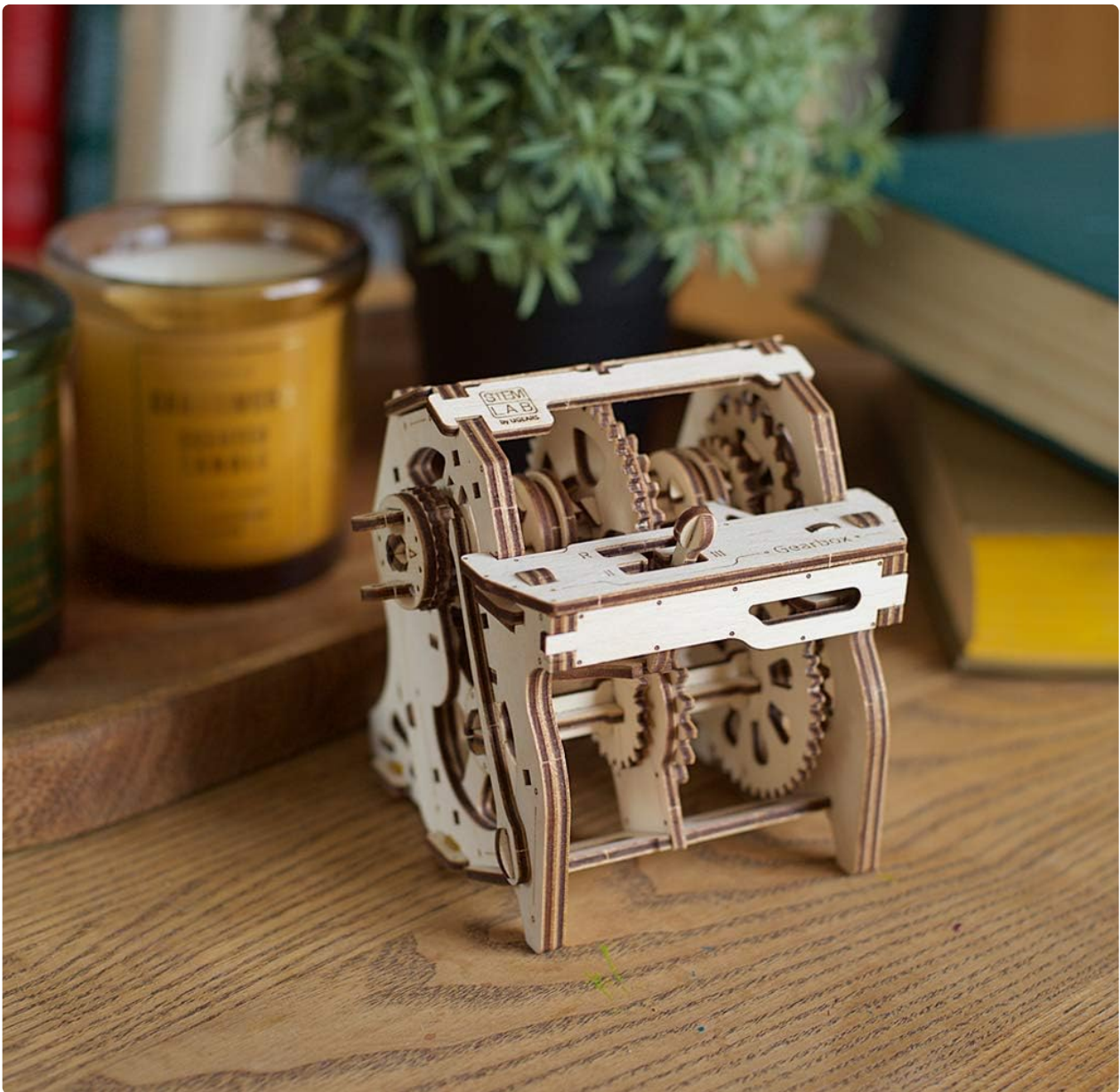
Figure 2: All components included in the UGEARS STEM Gearbox Model Kit.