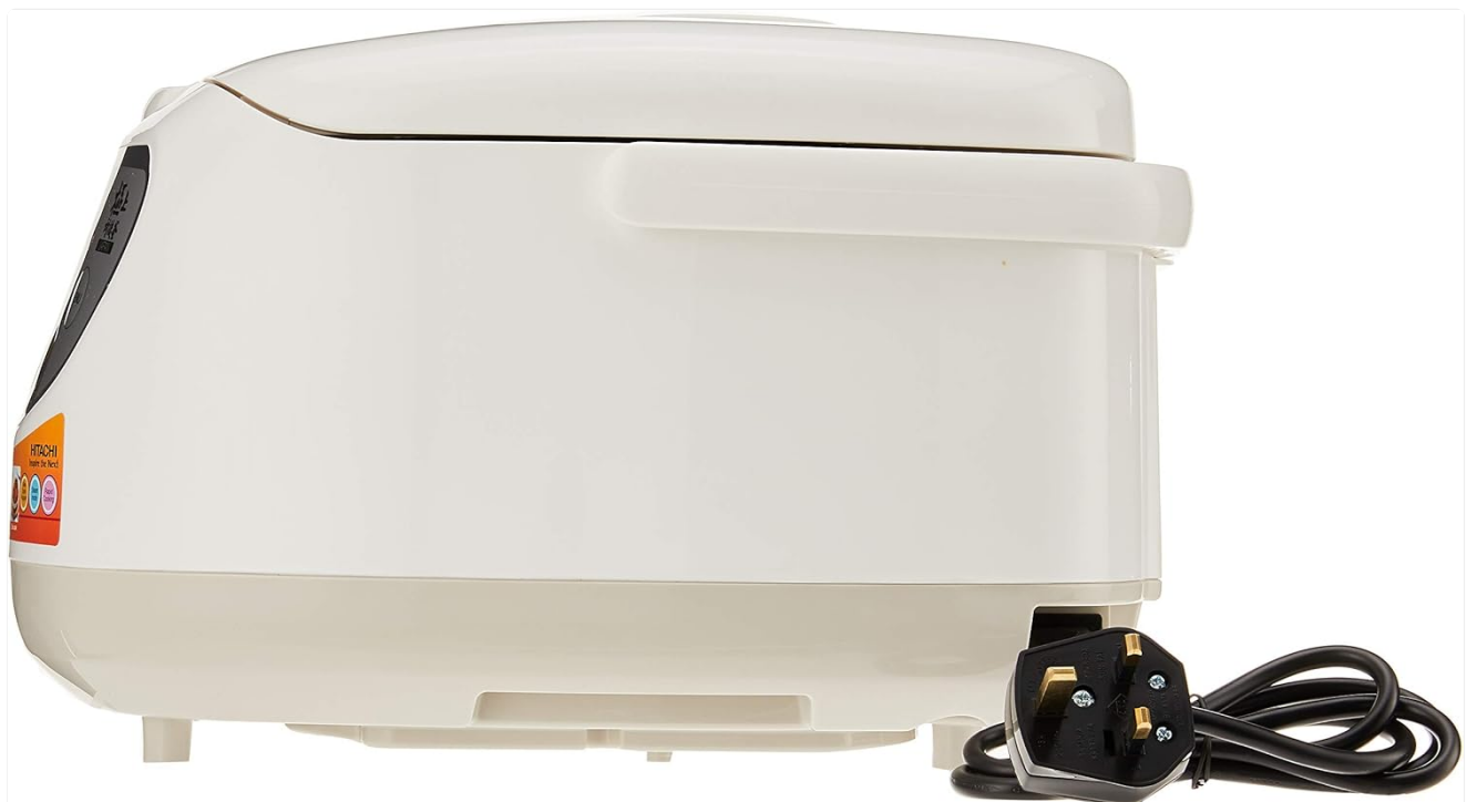
Image: Side profile of the rice cooker, illustrating the power cord extending from the rear base of the unit.

Place the rice cooker on a stable, flat, heat-resistant surface, away from direct sunlight and heat sources. Ensure adequate ventilation around the unit. Plug the power cord into a suitable electrical outlet.