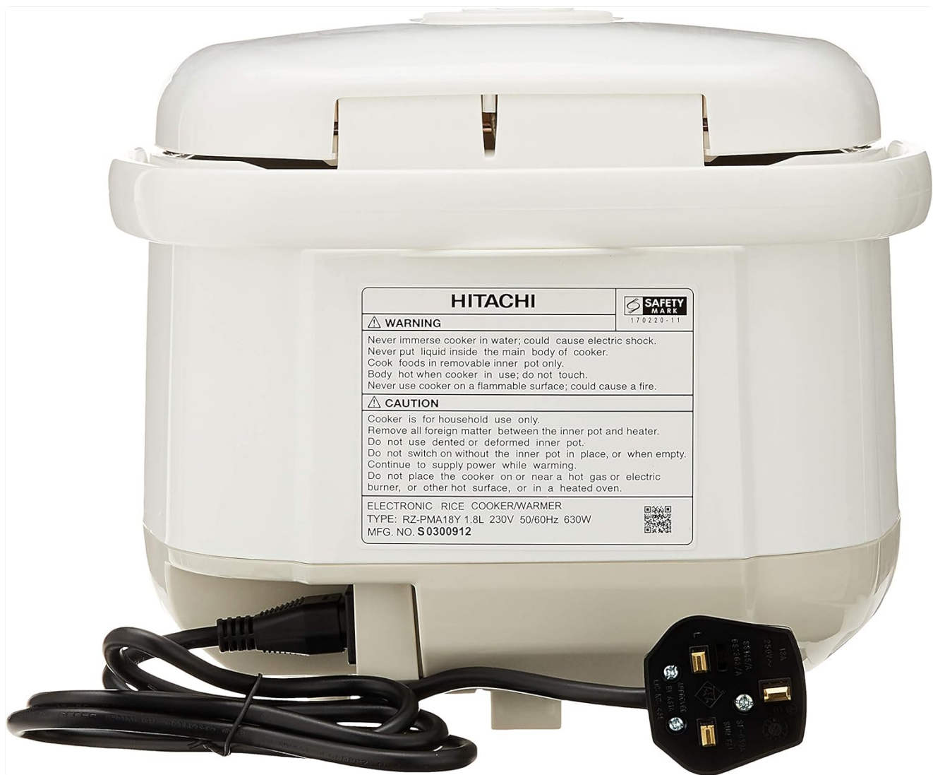
Image: Rear view of the rice cooker, highlighting the warning label and power cord. The label specifies model RZ-PMA18Y, 1.8L, 230V 50/60Hz 630W.