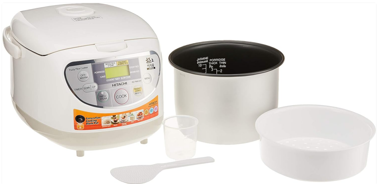
Image: The Hitachi RZ-PMA18Y rice cooker displayed with its included accessories: the main cooker body, the removable non-stick inner pot, a plastic measuring cup, and a rice scoop.