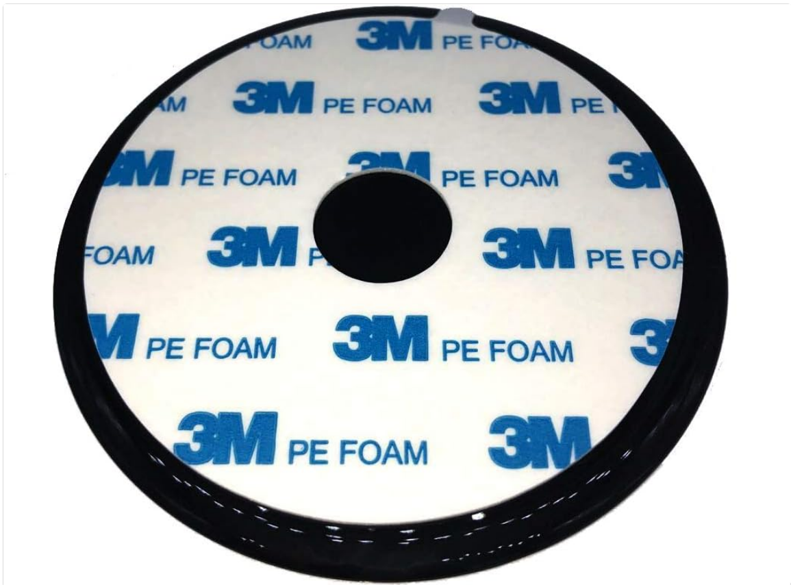
Image 2: Bottom view of the azur car mount stand tray, revealing the 3M PE Foam adhesive sheet. This side adheres to your vehicle's surface.