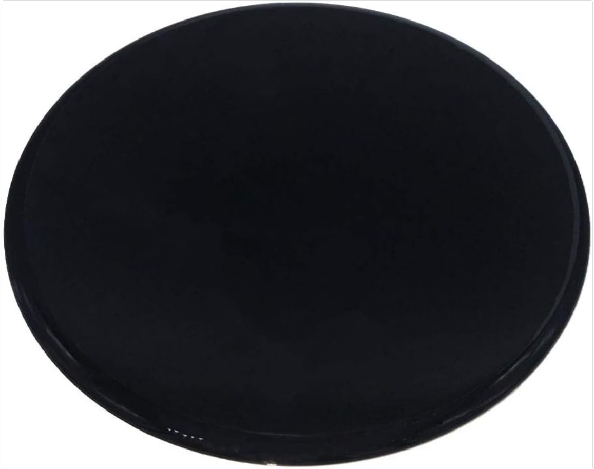
Image 1: Top view of the azur car mount stand tray. This is the surface where your navigation stand will attach.