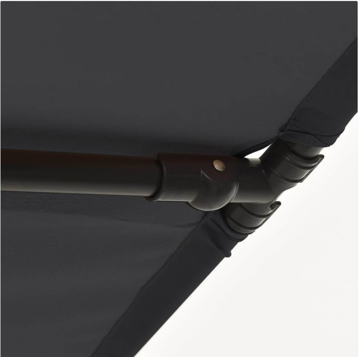
Image 4.1: Detail of the canopy frame connection, showing how the canopy arms attach to the central mechanism.