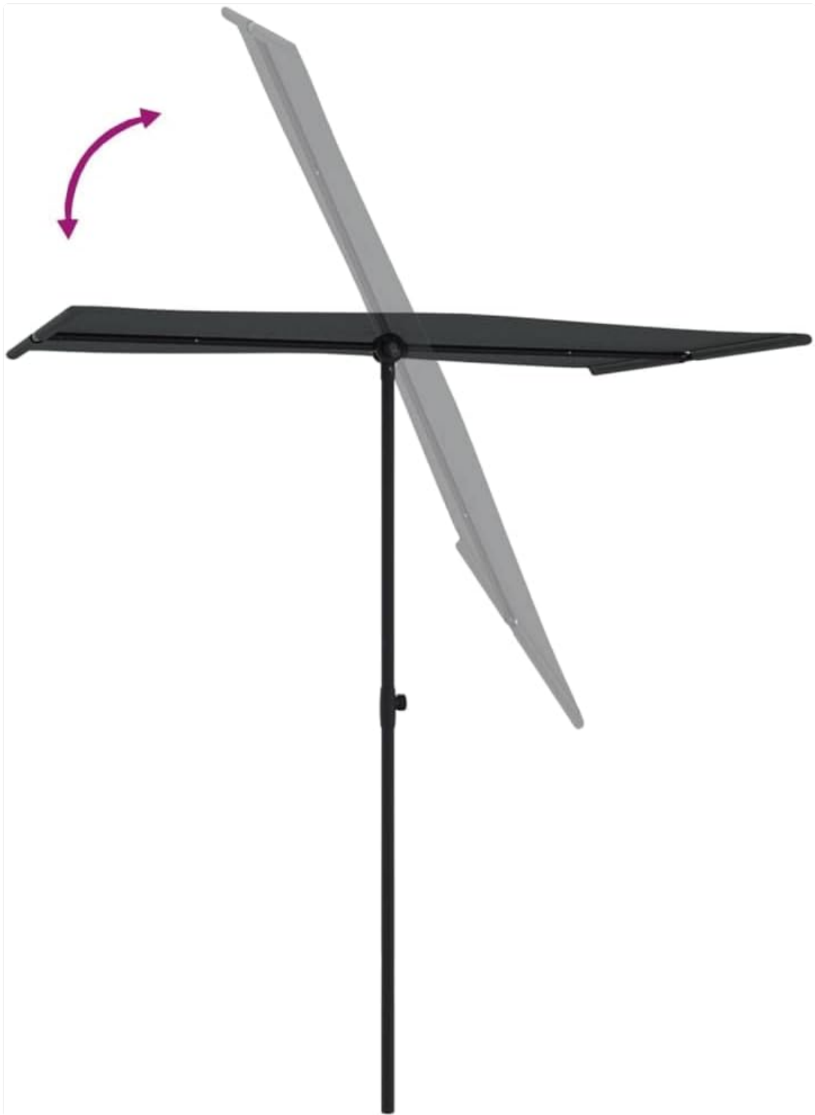
Image 5.1: Illustration demonstrating the 180-degree rotation capability of the parasol canopy.