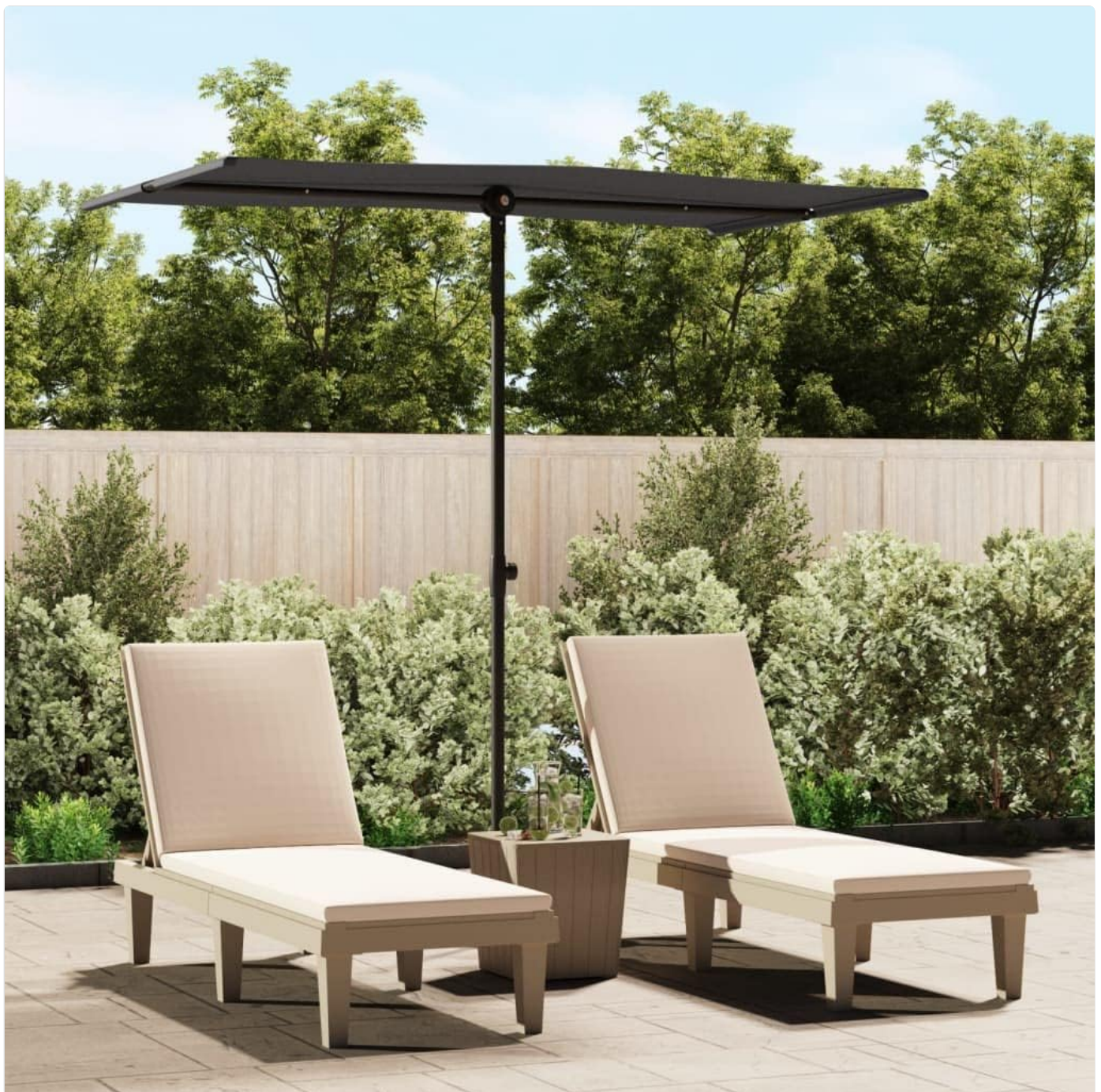
Image 1.1: The vidaXL Aluminum Pole Garden Parasol providing shade over two lounge chairs in a garden setting.