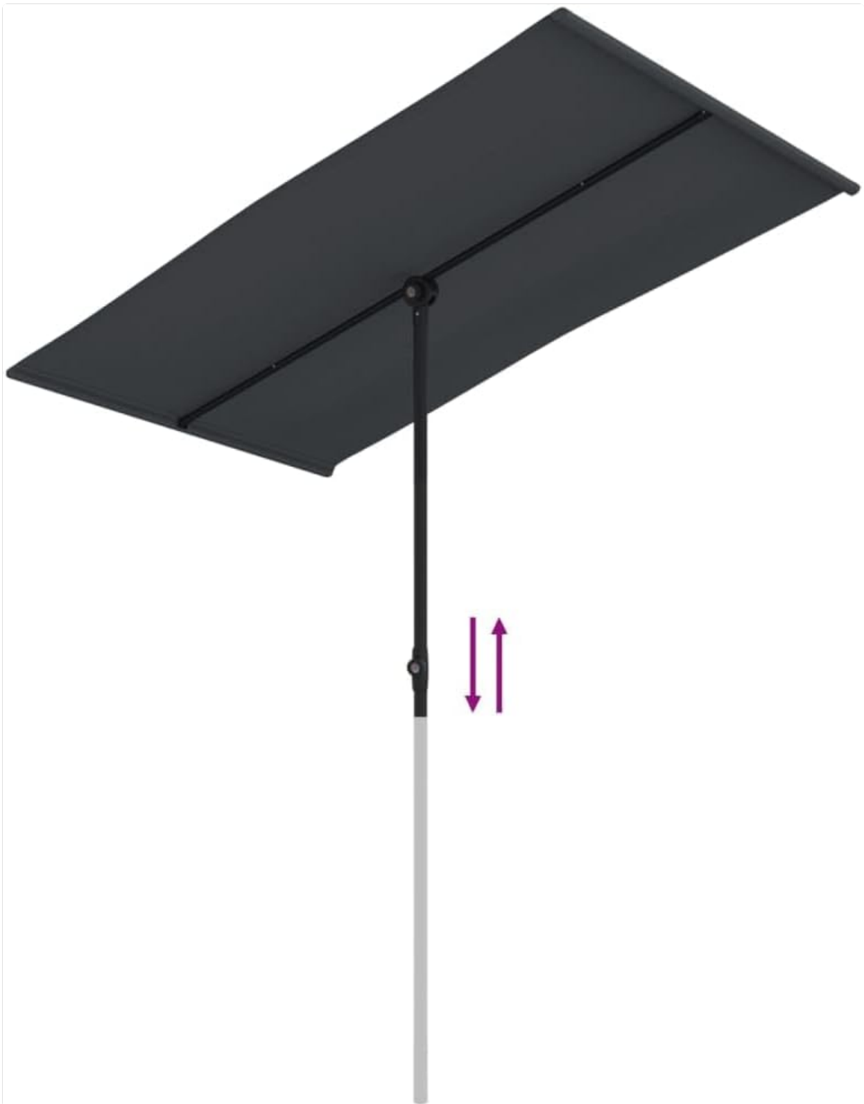
Image 5.3: Visual guide illustrating how to adjust the height of the parasol pole.