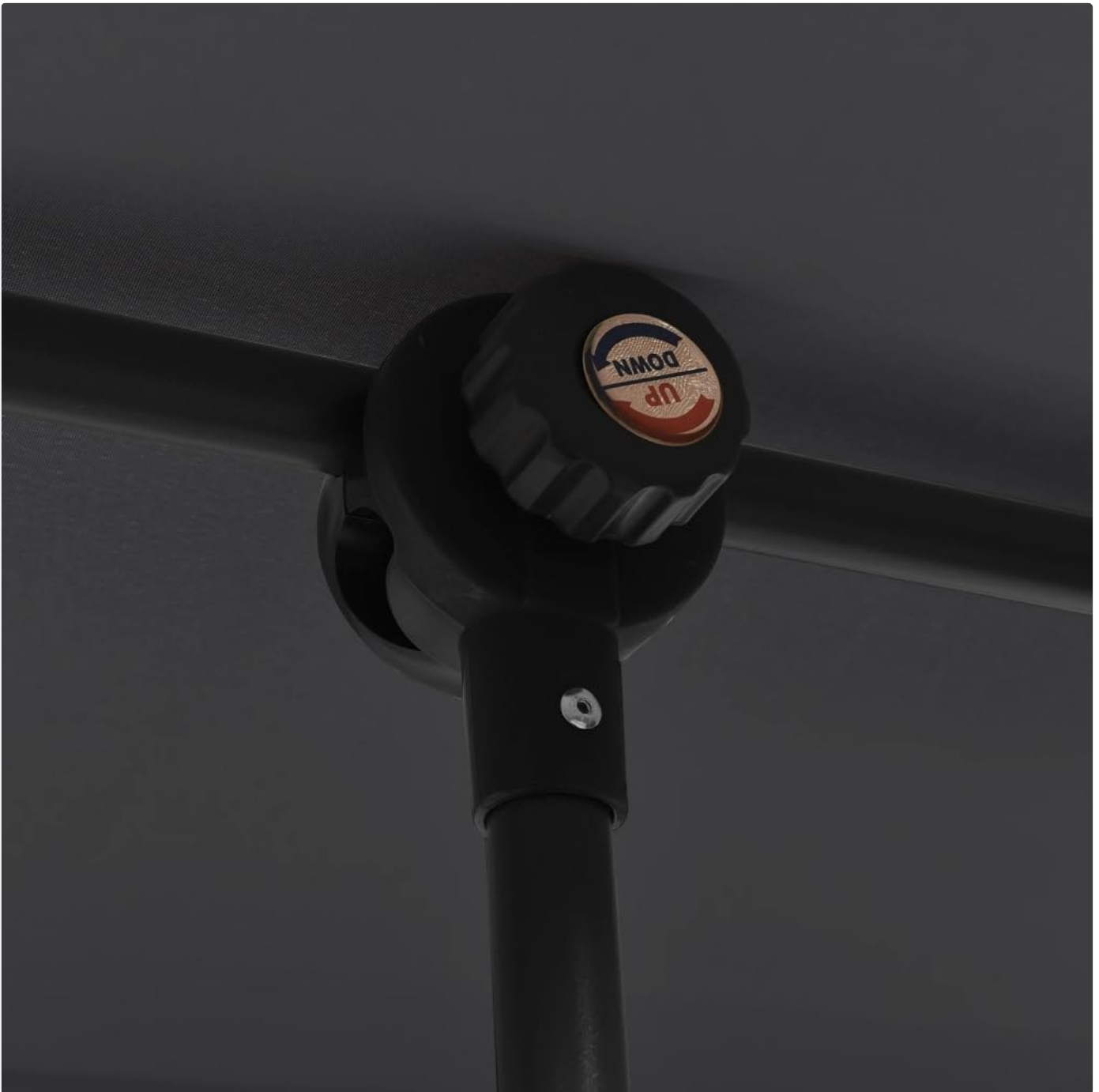
Image 5.2: A detailed view of the adjustment knob used to control the parasol's angle and height.