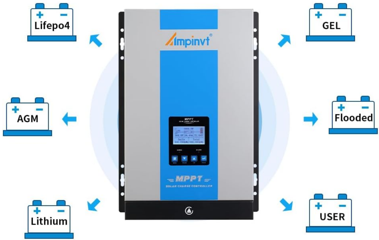
Figure 5: The controller is compatible with 12V/24V/36V/48V systems and supports LiFePO 4 , AGM, Lithium, GEL, Flooded, and User-defined battery types.