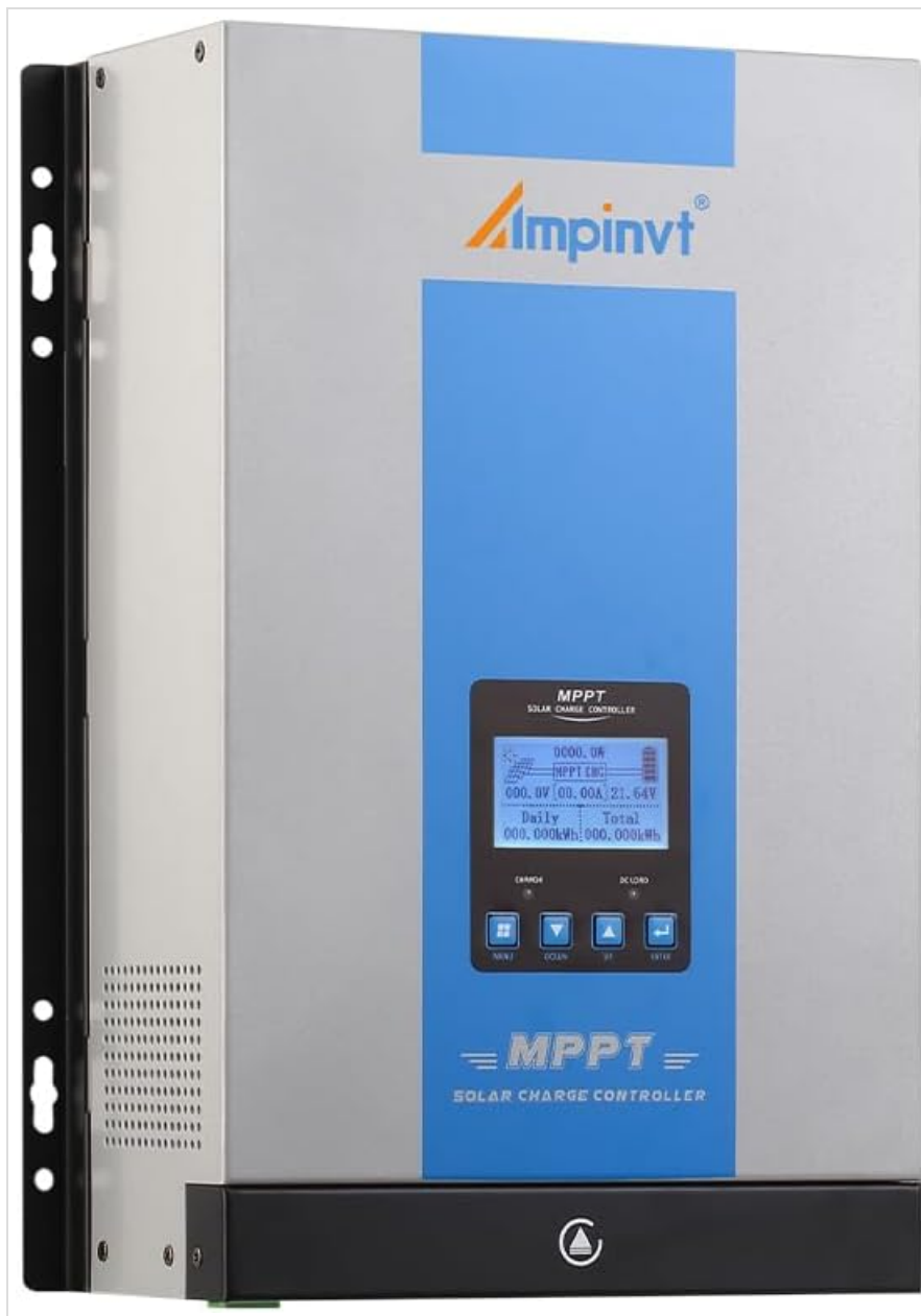
Figure 1: Front view of the AMPINVT 120A MPPT Solar Charge Controller.