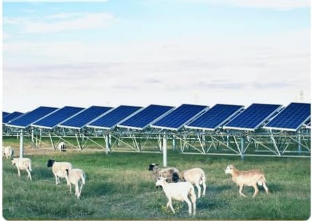
Figure 7: Examples of wide applications including household solar systems, RVs, base stations, and agricultural pastures.