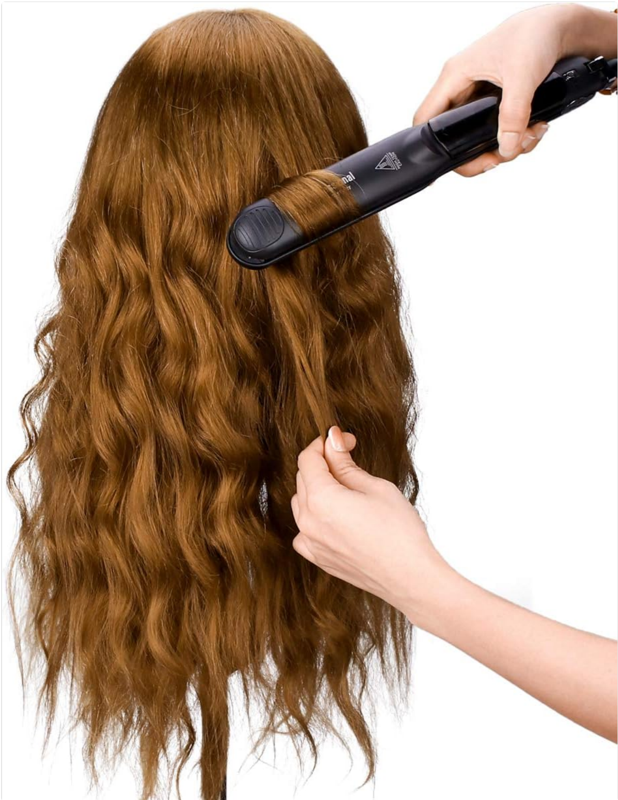
Image: A close-up view of a hand using a flat iron to straighten a section of the mannequin head's wavy hair, demonstrating the hair's ability to be heat-styled.