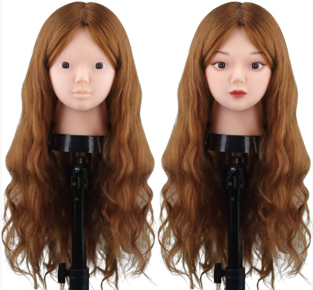
Image: A side-by-side comparison showing the mannequin head before and after makeup application, highlighting the transformation.