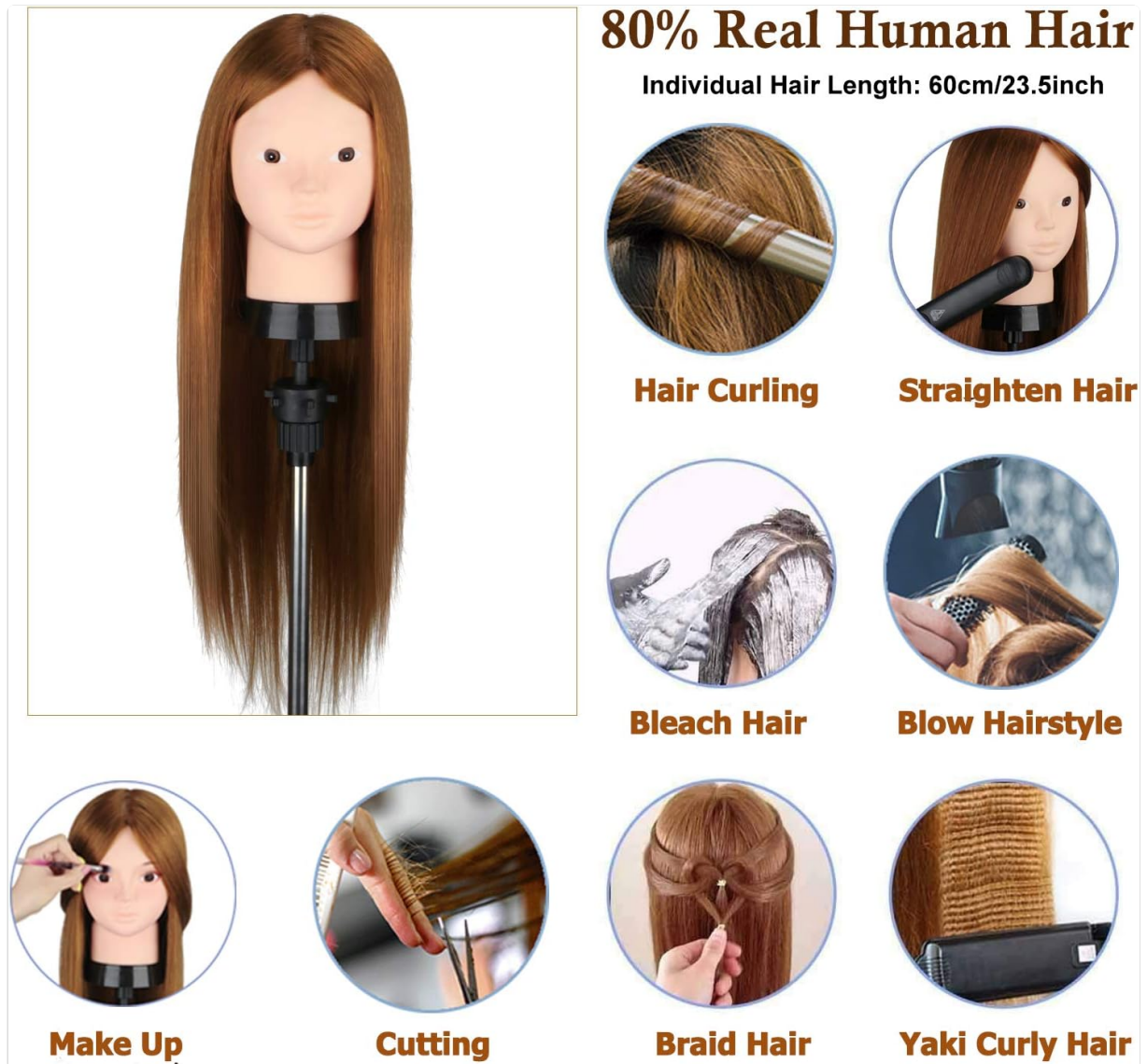
Image: A visual guide showing the mannequin head's hair being used for curling, straightening, bleaching, blow styling, cutting, and braiding.

The 80% real human hair allows for a wide range of styling options: