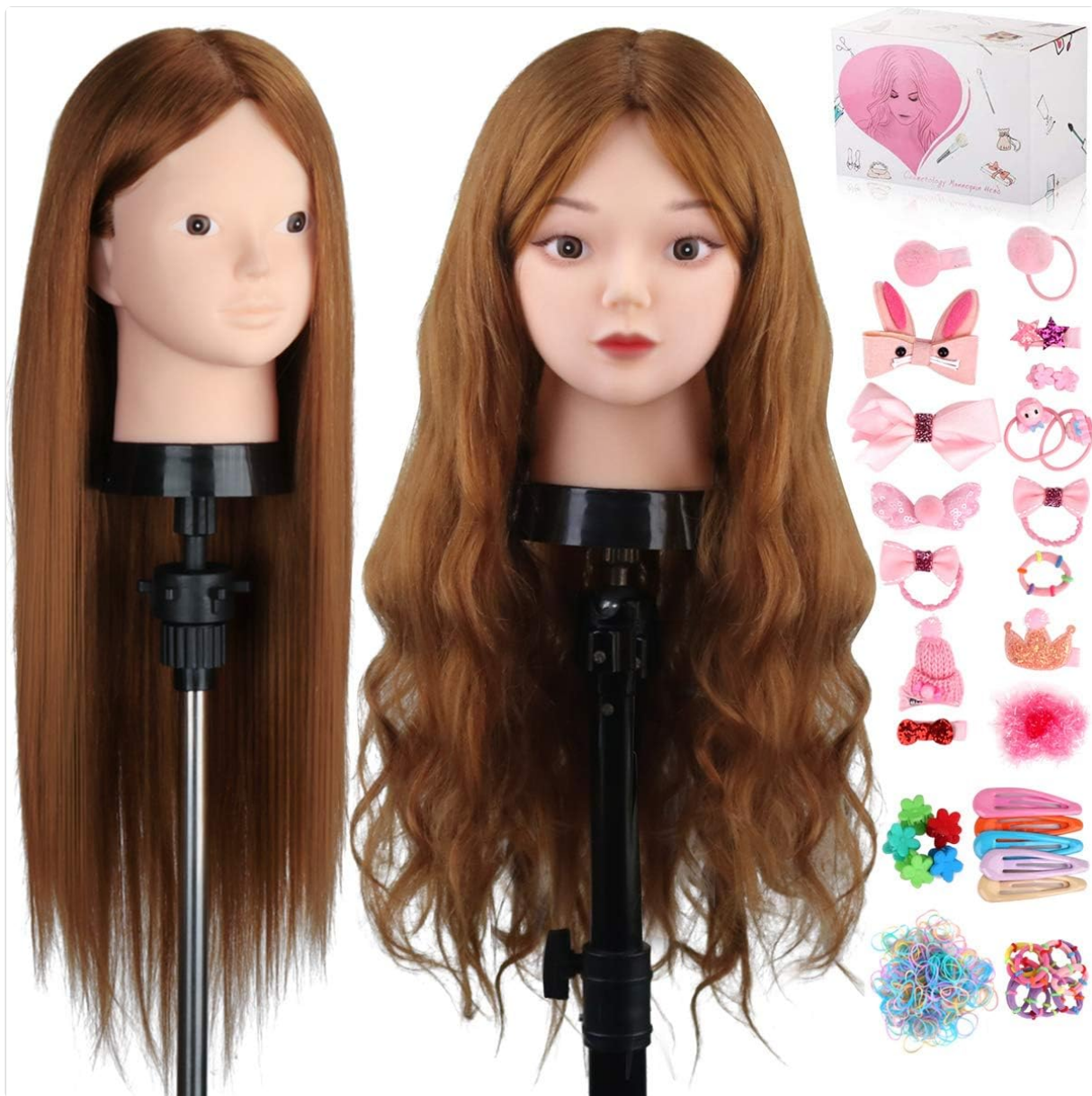
Image: The TopDirect 23.5 inch Mannequin Head, shown with its included table clamp stand and a variety of hair accessories such as bows, clips, and elastic bands.