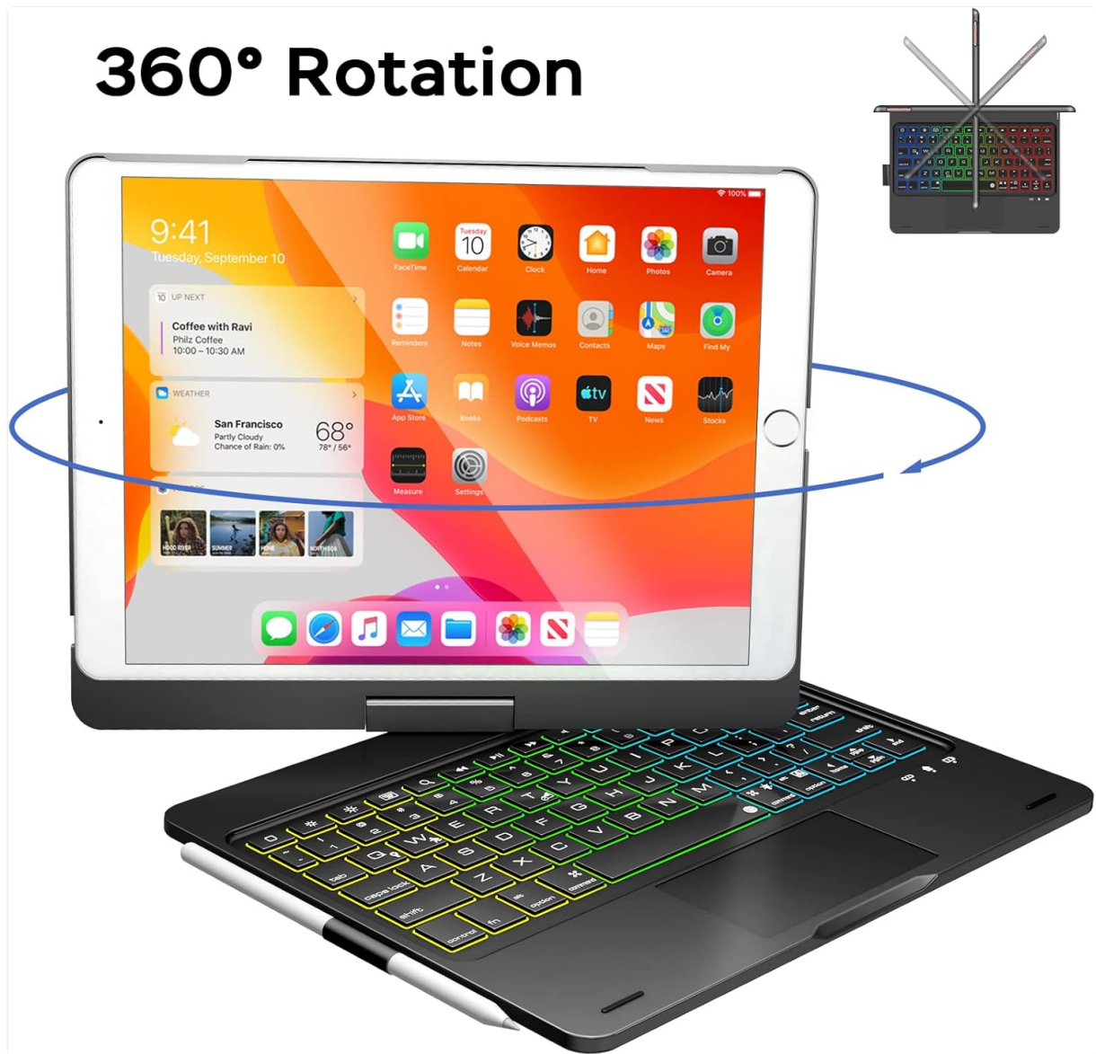
Image: Visual representation of the 360-degree rotation feature.