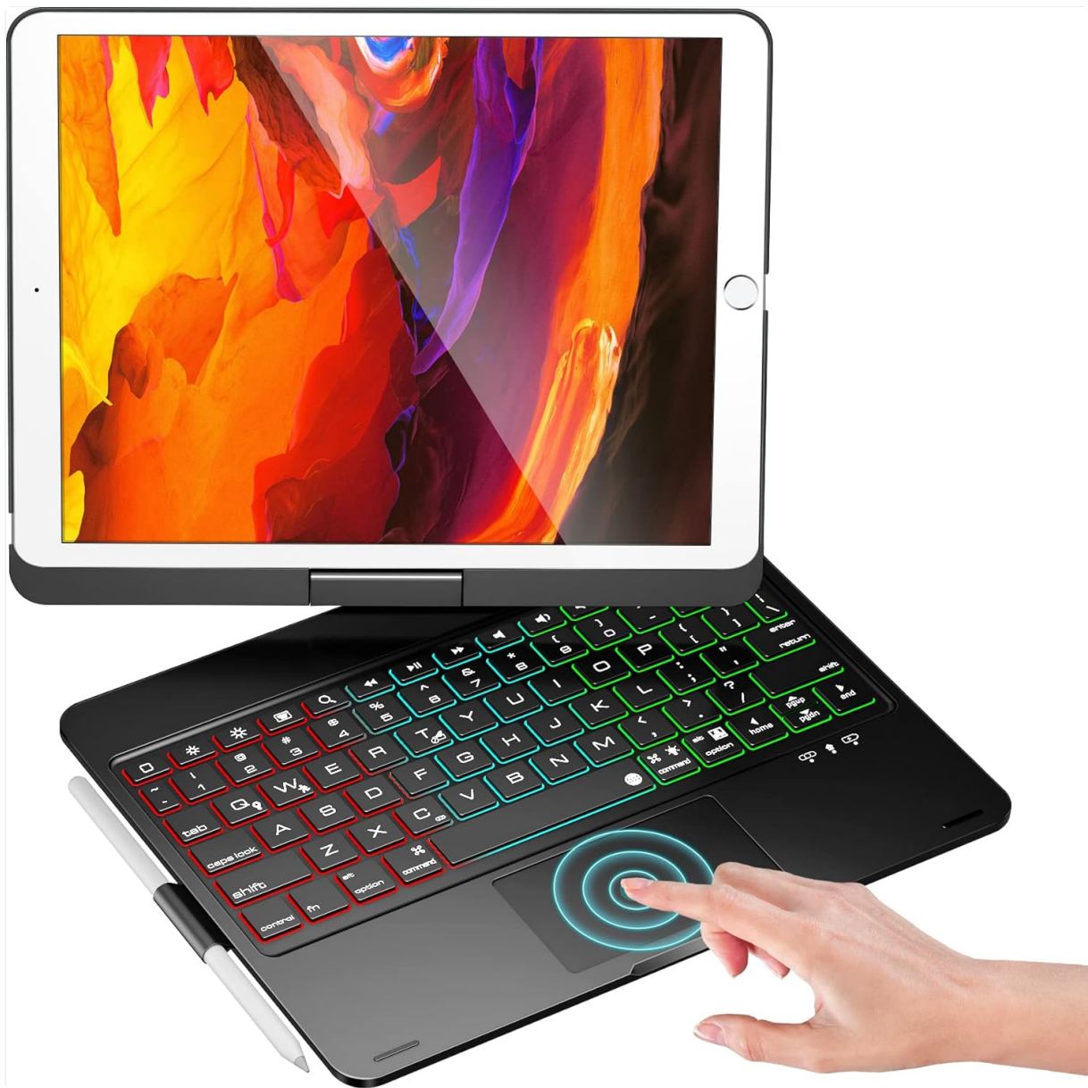
Image: The NOKBABO iPad Keyboard Case with an iPad, highlighting the backlit keyboard and touchpad functionality.