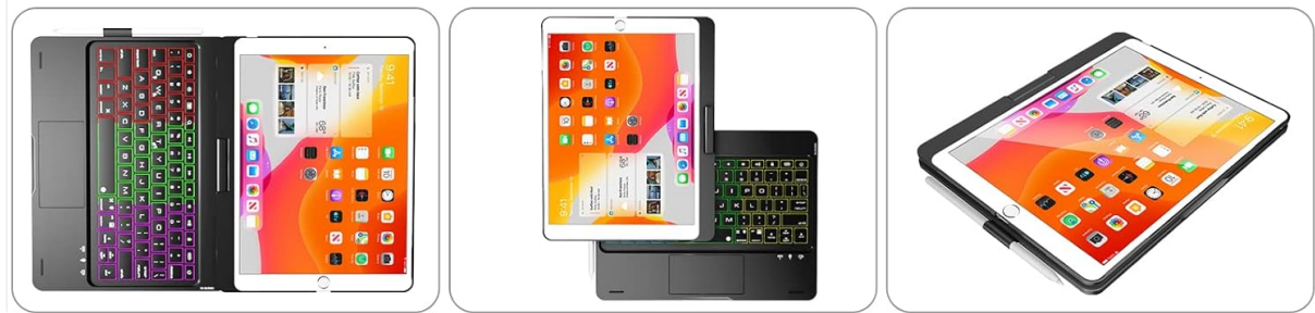
Image: Visual representation of the 180-degree flip feature.