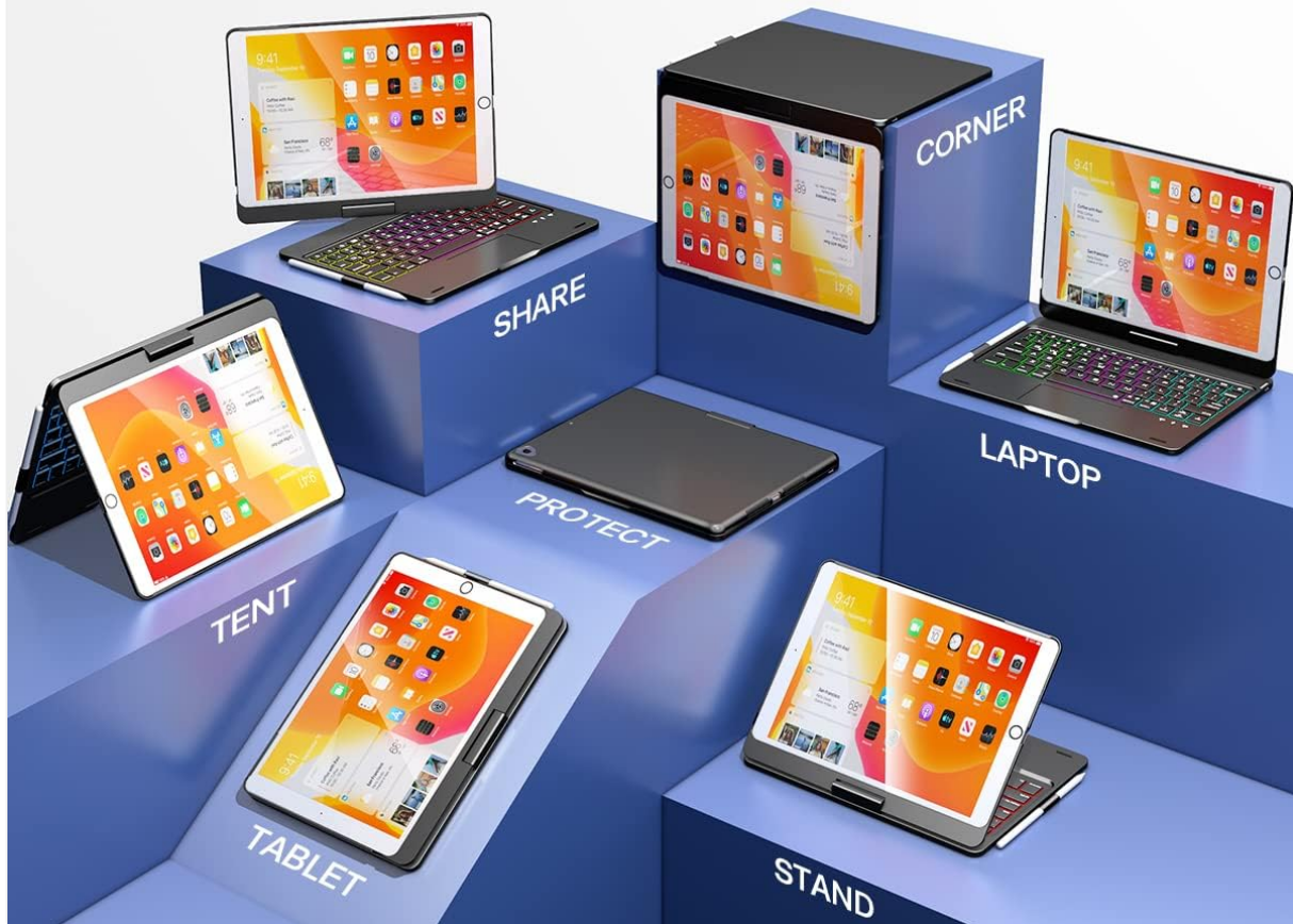
Image: Demonstrates the 7 unique modes supported by the keyboard case.