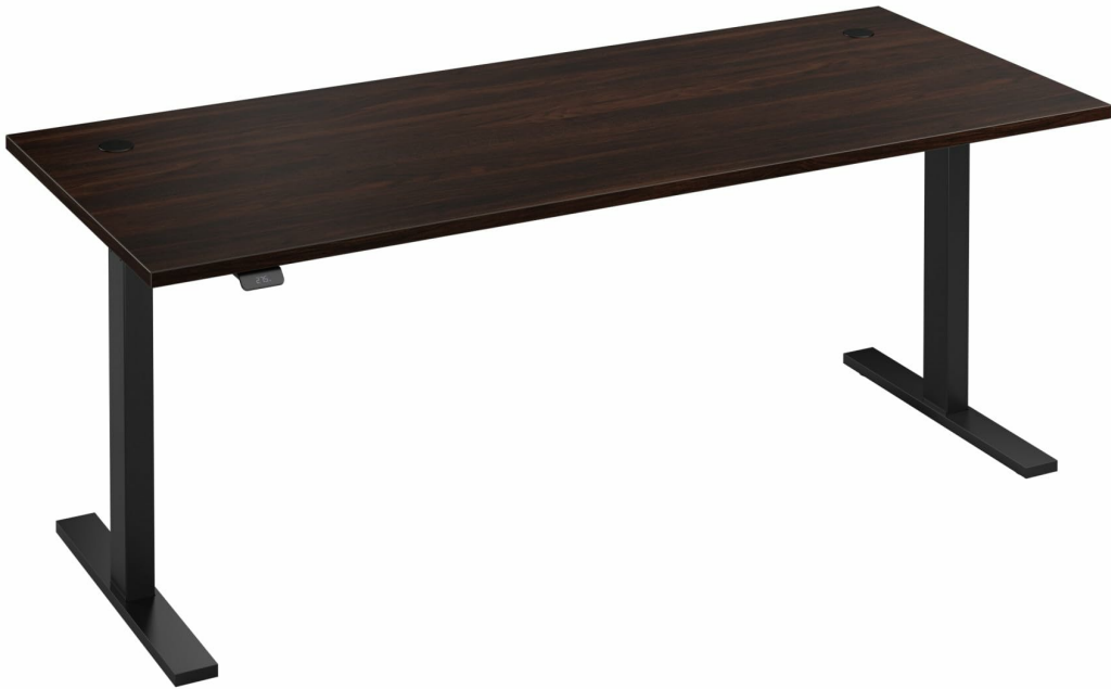
Image 1: Bush Business Furniture Move 60 Series Electric Height Adjustable Standing Desk.