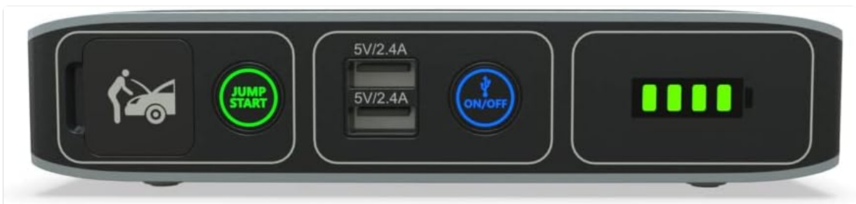
Image: Detailed view of the HALO Bolt Compact's various ports and controls.

Before initial use, fully charge your HALO Bolt Compact. Use the provided AC Wall Charging Adapter. Connect the adapter to the input port on the HALO Bolt Compact and plug it into a standard wall outlet. The digital display will show the charging progress.