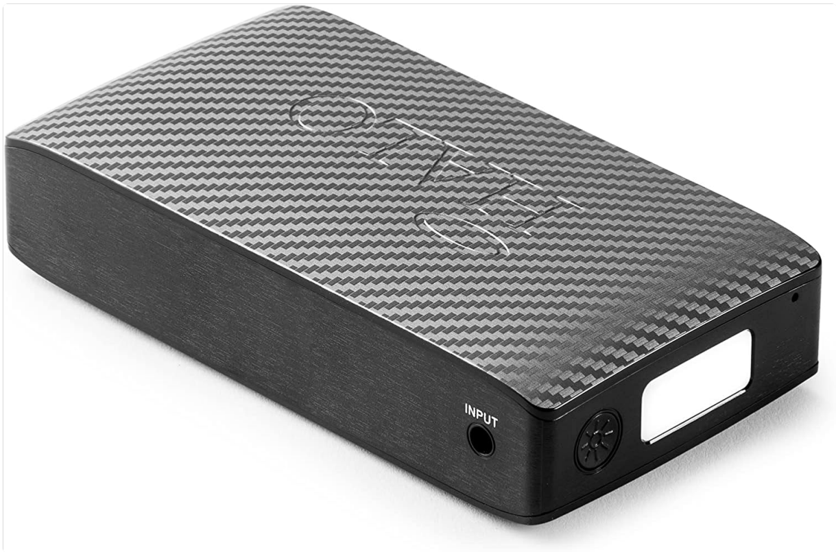
Image: The HALO Bolt Compact device, showcasing its sleek design.