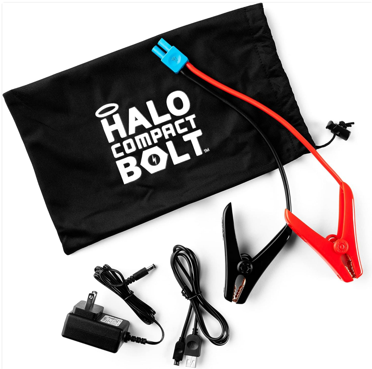
Image: HALO Bolt Compact with all included accessories neatly arranged.