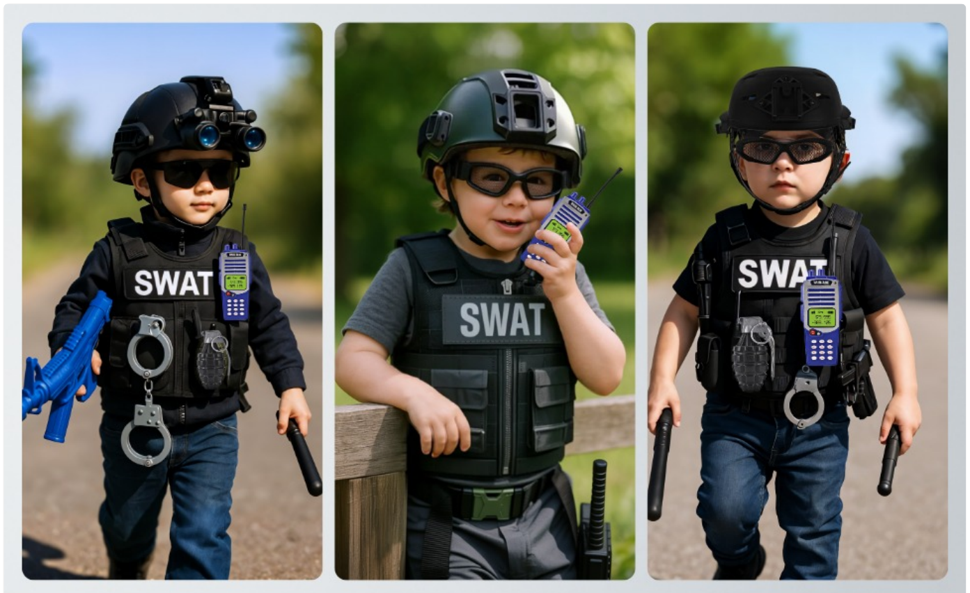
Image 1.1: A child demonstrating the full SWAT Role Play Set in use, showcasing the helmet, vest, and toy weapon.

The Liberty Imports Kids SWAT Role Play Set provides a comprehensive collection of accessories for imaginative play. This set is designed to engage children in role-playing scenarios, fostering creativity and interactive fun. It includes a variety of items to complete a SWAT team member's uniform and gear.