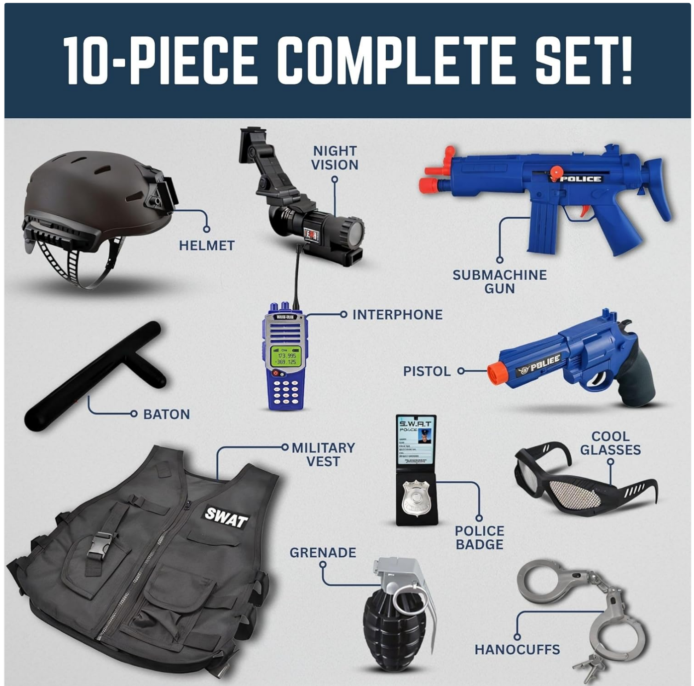
Image 2.1: All 10 pieces of the SWAT Role Play Set laid out, including helmet, night vision monocular, submachine gun, interphone (walkie-talkie), pistol, baton, military vest, police badge, grenade, and handcuffs.

Verify that all components listed below are present in your package: