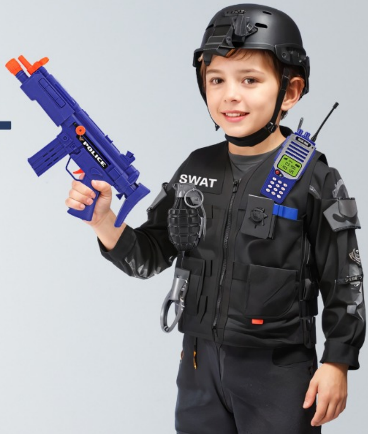
Image 3.2: A child wearing the helmet and vest, illustrating the appropriate fit for the recommended age range.