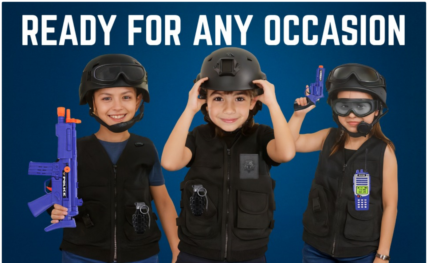
Image 3.1: Close-up of the SWAT vest highlighting its adjustable features and pockets.

The SWAT vest is designed with adjustable straps to fit various child sizes. Put on the vest and adjust the side straps for a comfortable and secure fit. The vest features a durable zipper for easy wearing and removal.