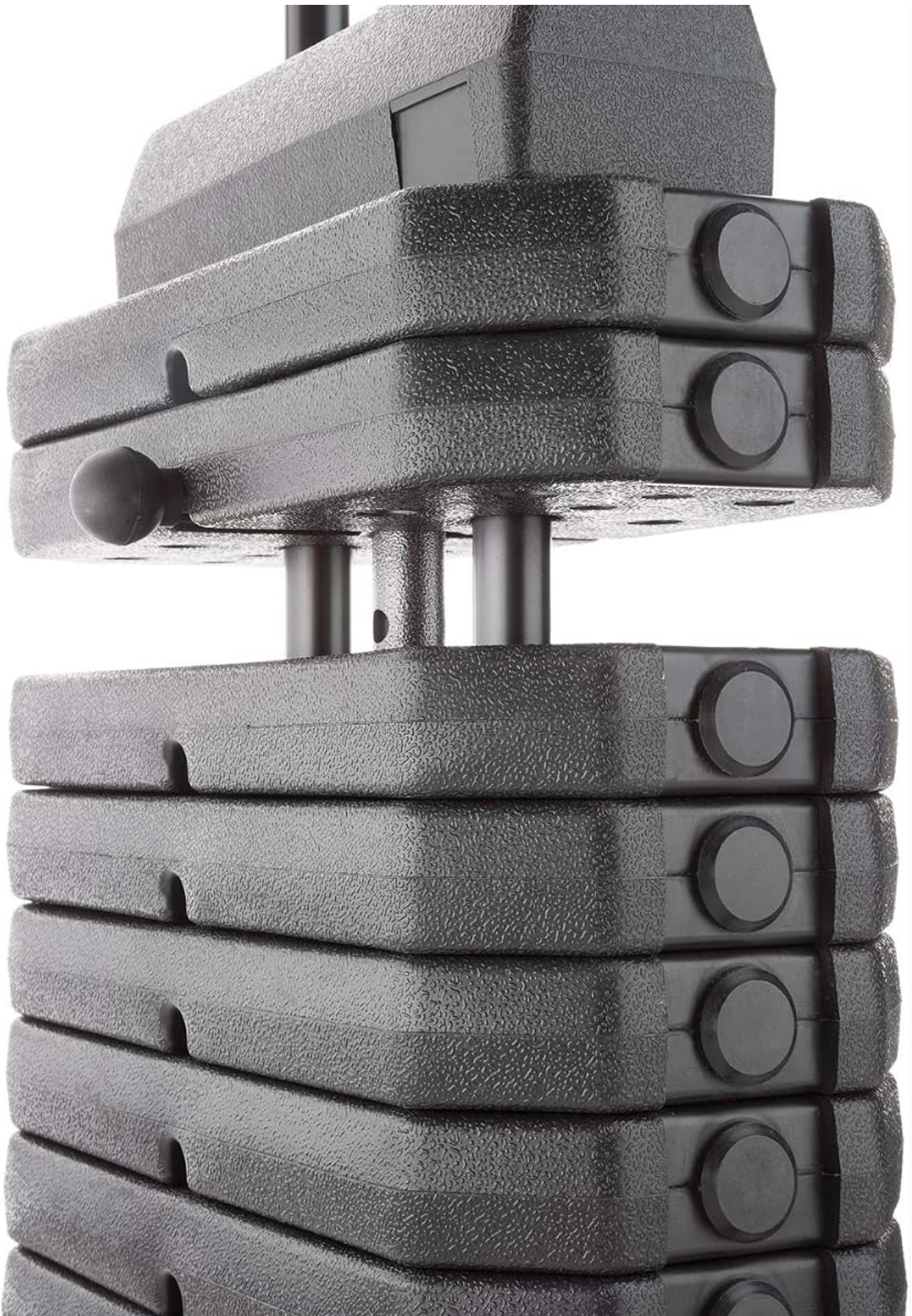
Figure 7: Close-up of the weight stack. This shows the individual weight plates and the selector pin mechanism.