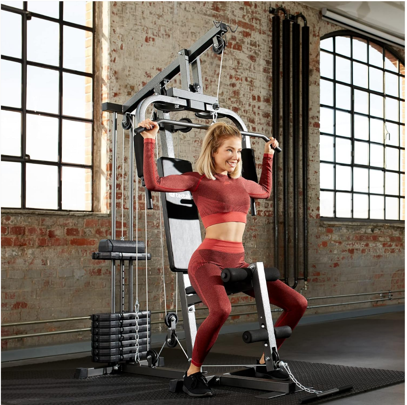
Figure 4: User performing a lat pulldown exercise. This illustrates the use of the upper pulley system for back muscle development.