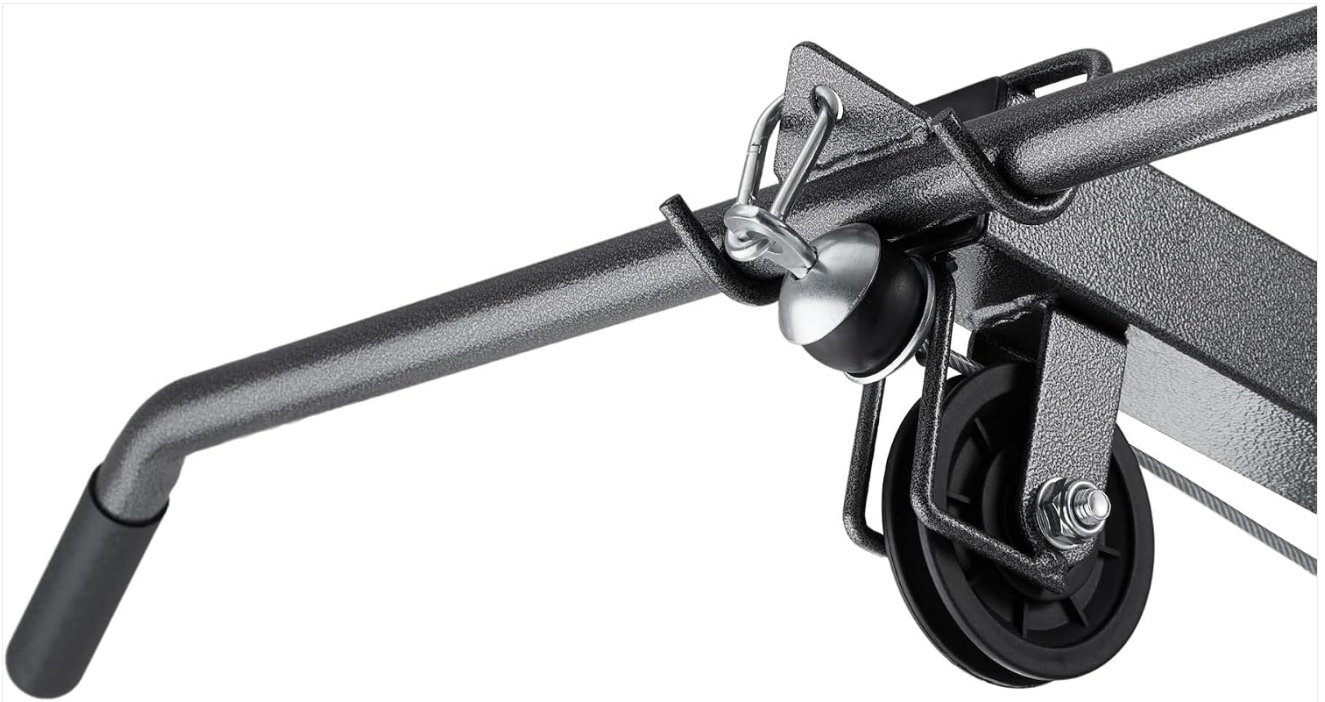
Figure 8: Detail of the pulley system. This image highlights the robust construction of the pulleys and cable connections.