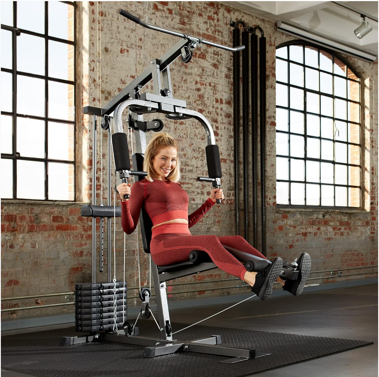
Figure 3: User performing a chest press exercise. This demonstrates the proper form for engaging chest muscles using the multi-gym's press station.