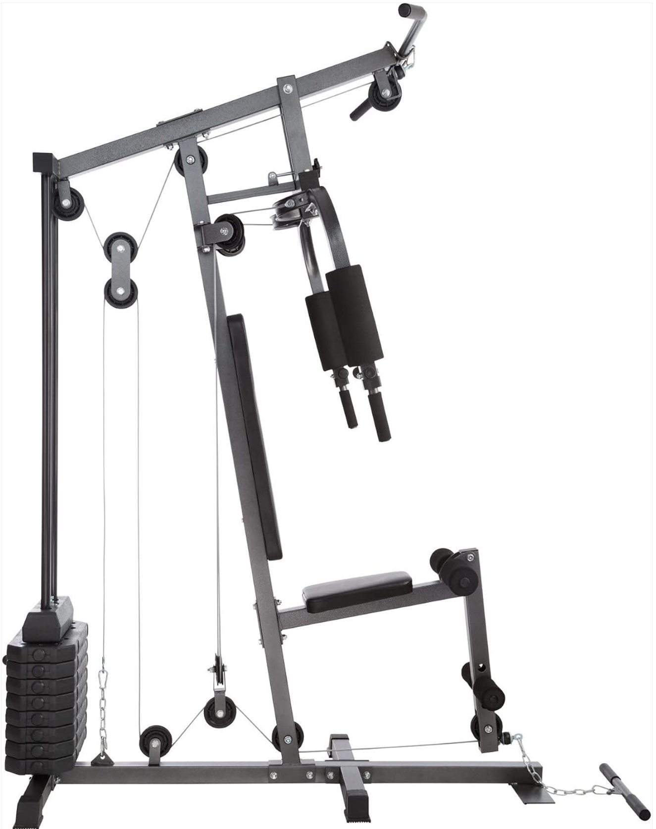
Figure 2: Side view of the tectake Fitness Multi-Gym. This perspective highlights the depth and arrangement of the different exercise components.