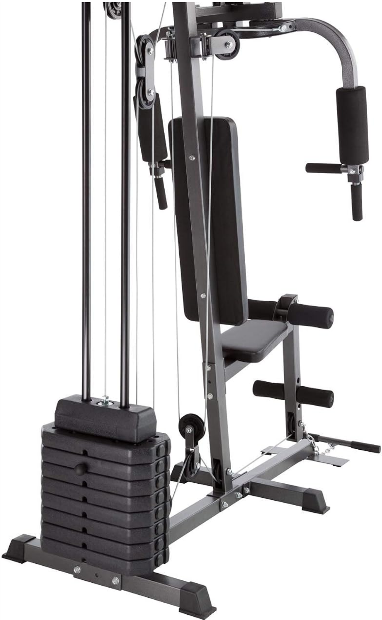
Figure 1: Front view of the assembled tectake Fitness Multi-Gym. This image shows the complete structure including the weight stack and various exercise stations.