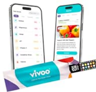
Image: Vivoo app providing detailed insights and advice for magnesium levels.