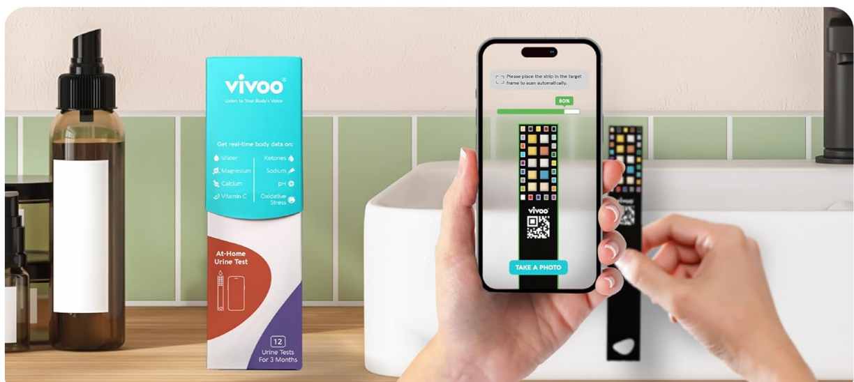
Image: A user scanning a Vivoo test strip with the mobile application.