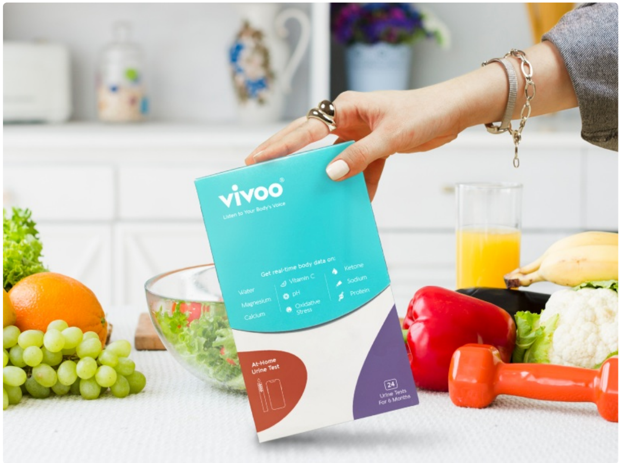
Image: Visual representation of the 8 real-time body data parameters tracked by Vivoo.