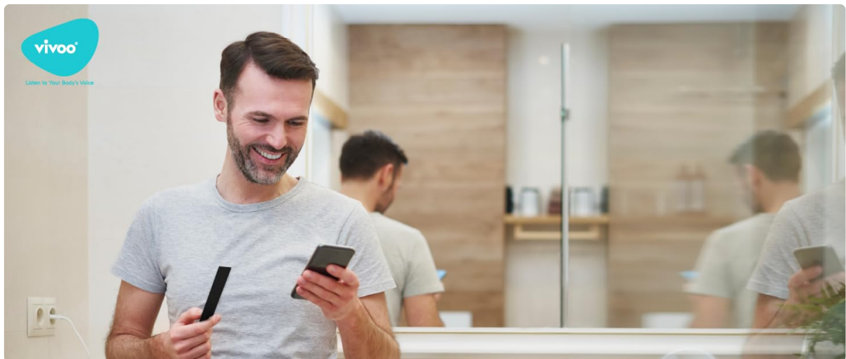
Image: Vivoo Smart Urine Test highlighting its convenience, 99% accuracy, and 90-second results.

The Vivoo Smart Urine Test Strips provide a convenient and non-invasive method for at-home wellness tracking. These app-powered strips analyze 8 key parameters in your urine to offer real-time insights into your body's needs, including hydration, sodium, ketone, pH, vitamin C, calcium, magnesium, and oxidative stress. The accompanying Vivoo app delivers personalized nutritional and lifestyle advice based on your results, helping you make informed decisions about your health.