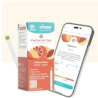
Image: Vivoo app displaying a user's wellness score and detailed urine data.