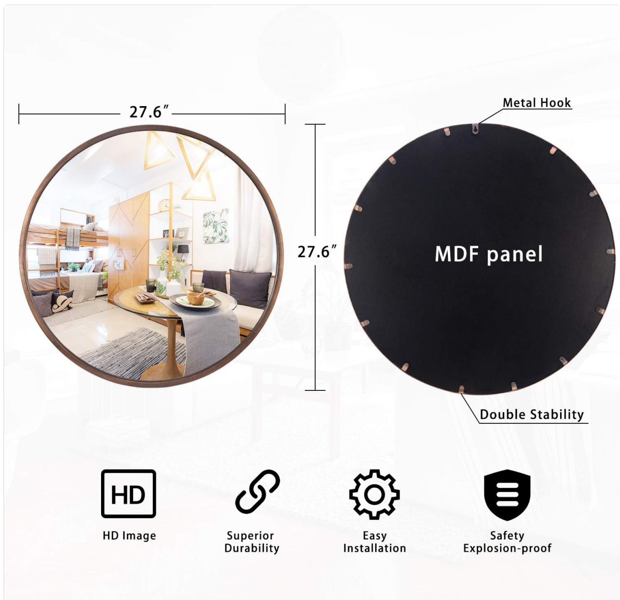
Image: Back view of the mirror with dimensions (27.6 inches diameter), MDF panel, metal hook for hanging, and double stability points. Icons indicate HD Image, Superior Durability, Easy Installation, and Safety Explosion-proof features.