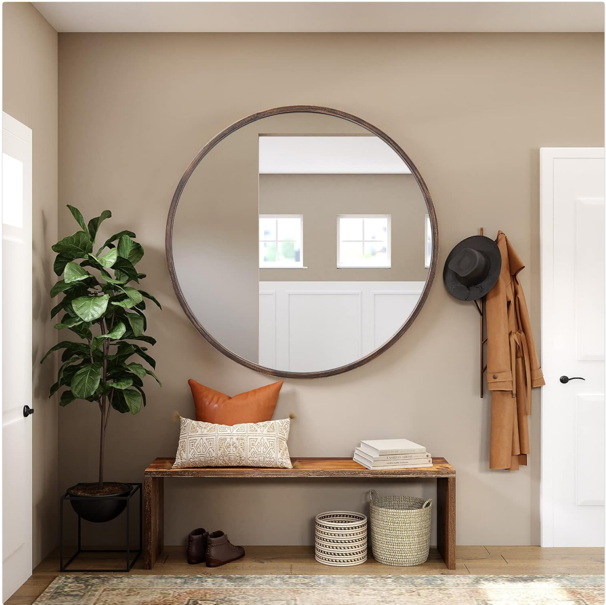
Image: A Geloo 27.6 inch round bronze-framed mirror mounted on a wall in an entryway, demonstrating a typical installation scenario.