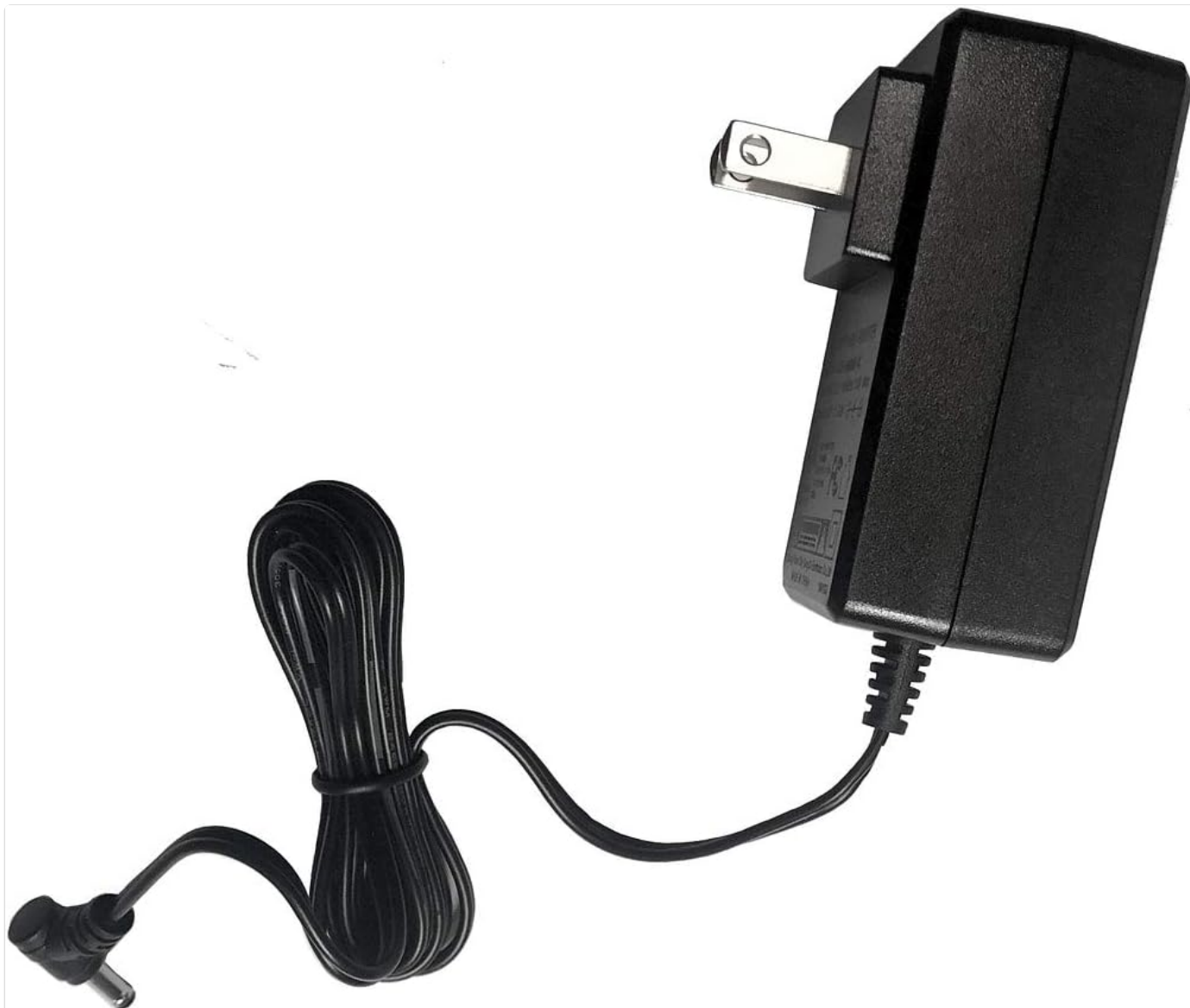
Figure 1: Homtime 5V 15W AC Adapter. This image displays the main unit of the power adapter, including the wall plug and the attached power cable terminating in a DC barrel connector.

This manual provides essential information for the safe and effective use of your Homtime 5V 15W AC Adapter. This adapter is specifically designed to power various Homtime alarm clock models, ensuring reliable performance.