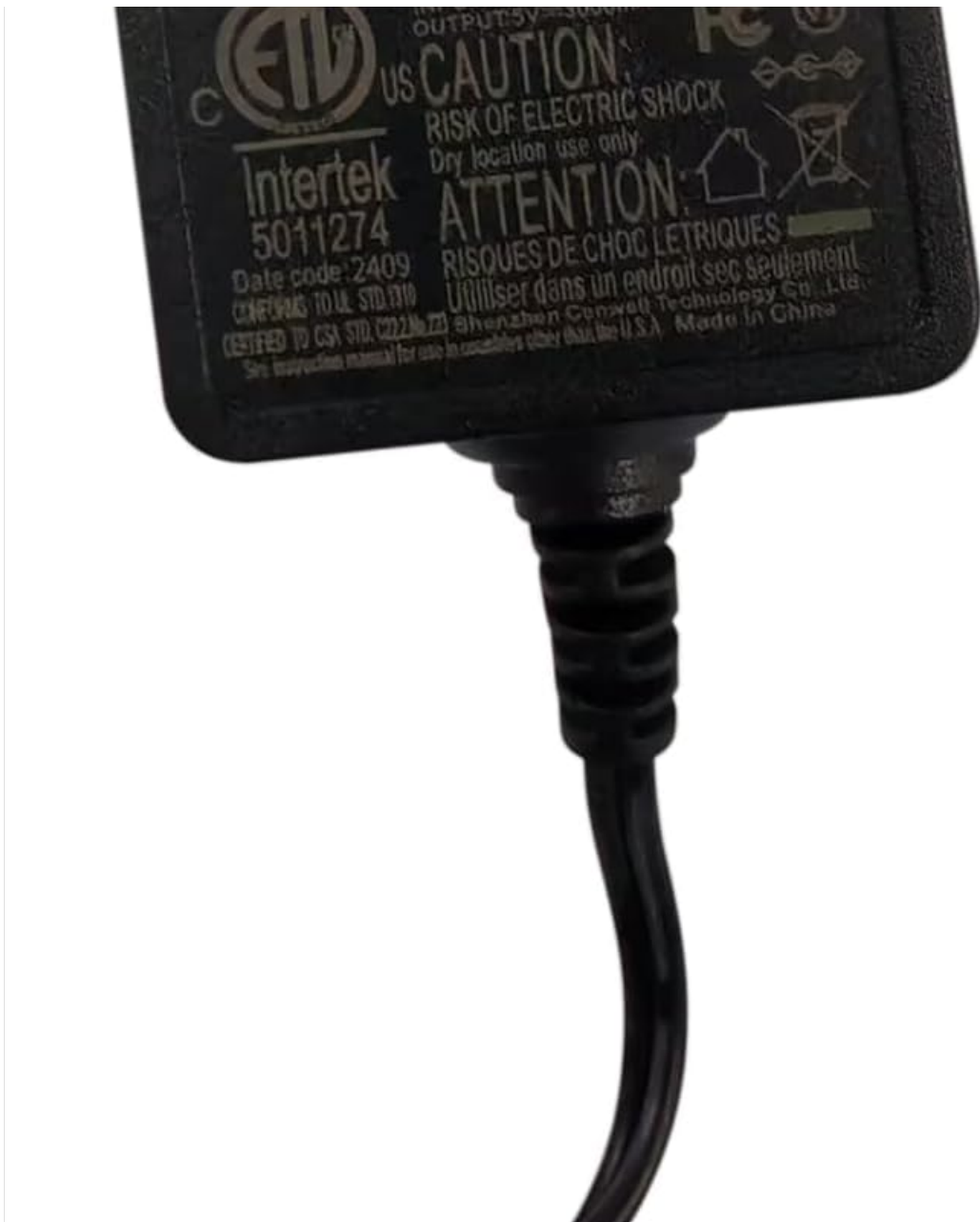
Figure 2: Rear view of the AC Adapter. This image shows the label on the back of the adapter, indicating its model number, input/output specifications, and UL certification markings, along with a "Risk of Electric Shock" warning.