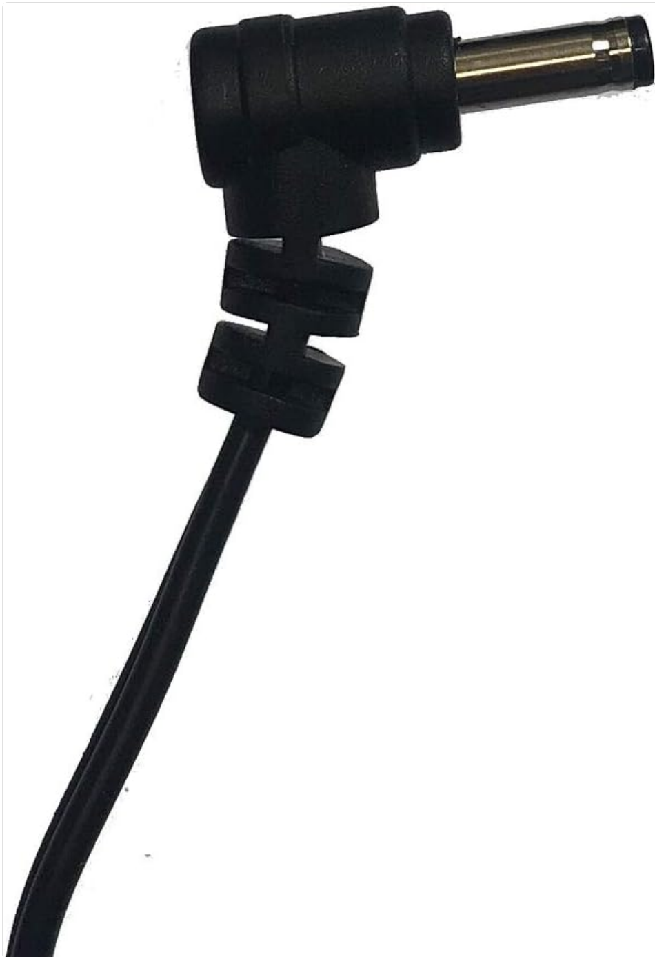
Figure 3: Close-up of the DC Plug. This image provides a detailed view of the DC barrel connector, which is 3.5mm*9mm, used to connect the adapter to the alarm clock.