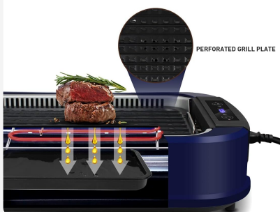
Perforated grill plate allows excess oil to drain into the drip tray.