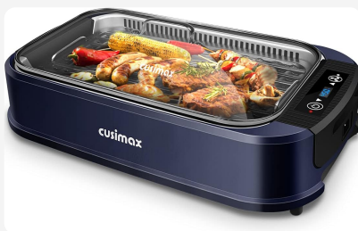
Main unit with grill plate and lid.