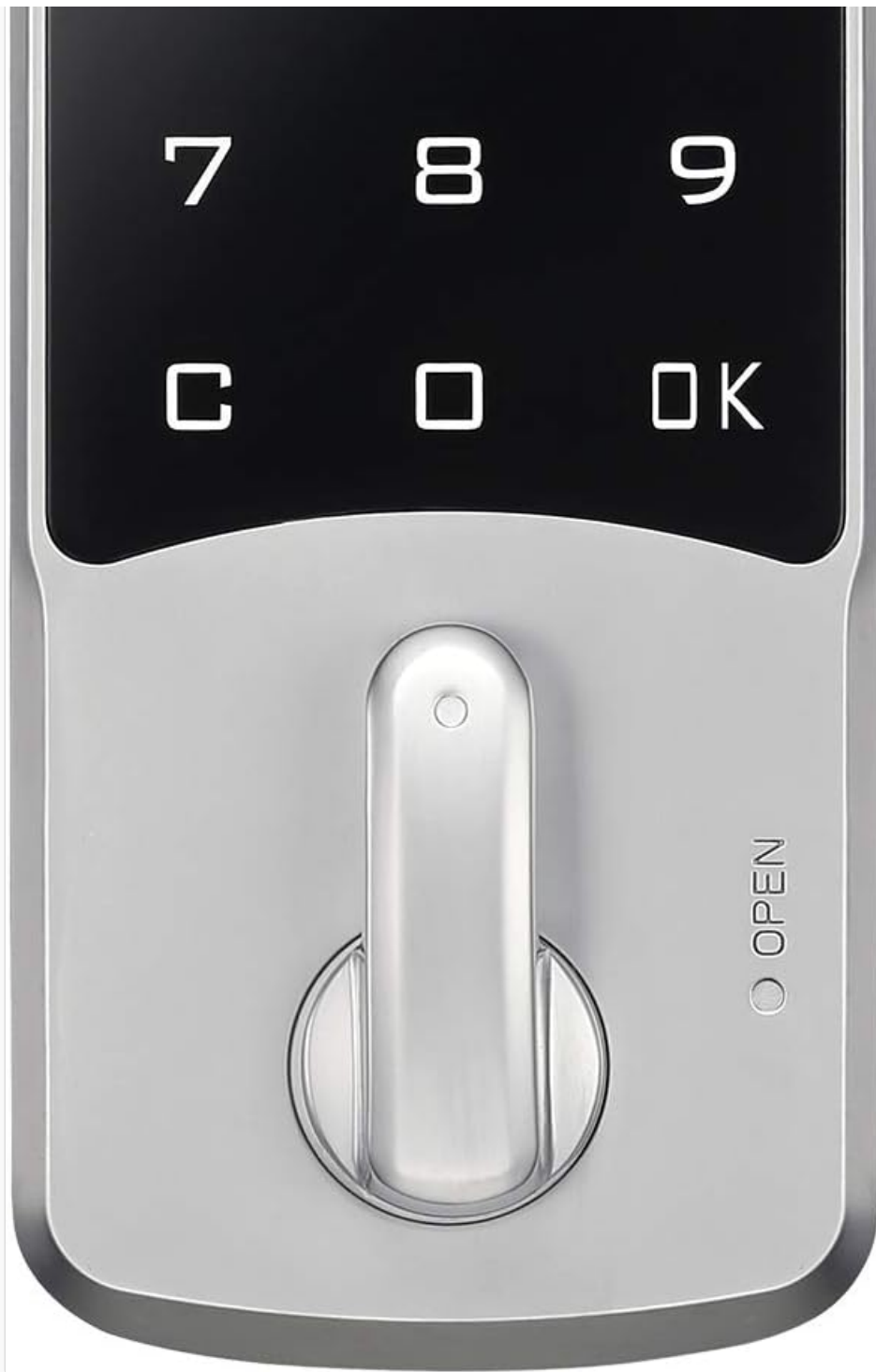
Figure 1: Front view of the Guub D153VG-CM03 Electronic Lock, showing the keypad and handle.