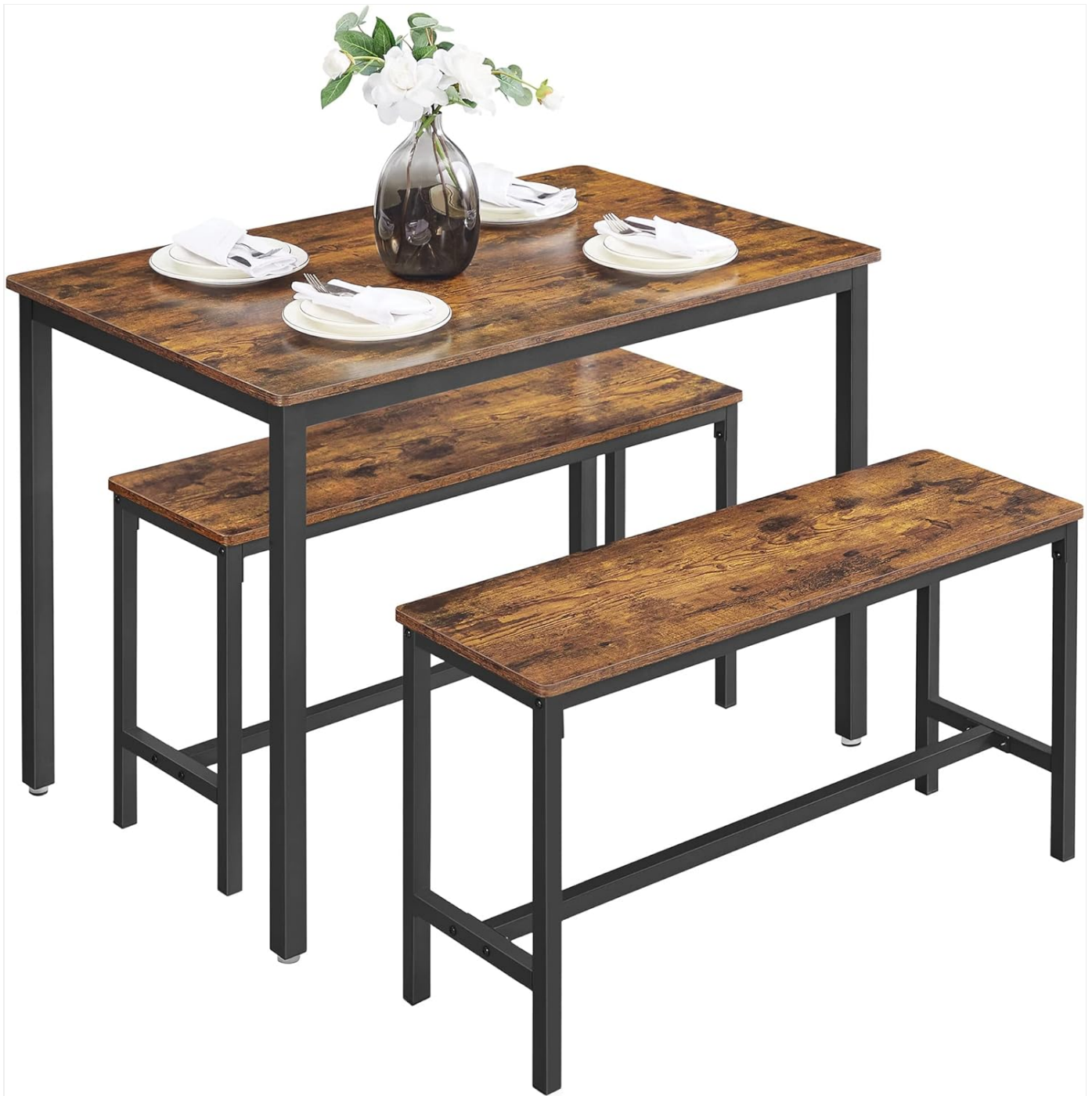
Image 1.1: The VASAGLE Dining Table with 2 Benches, showcasing its rustic brown tabletop and black steel frame.