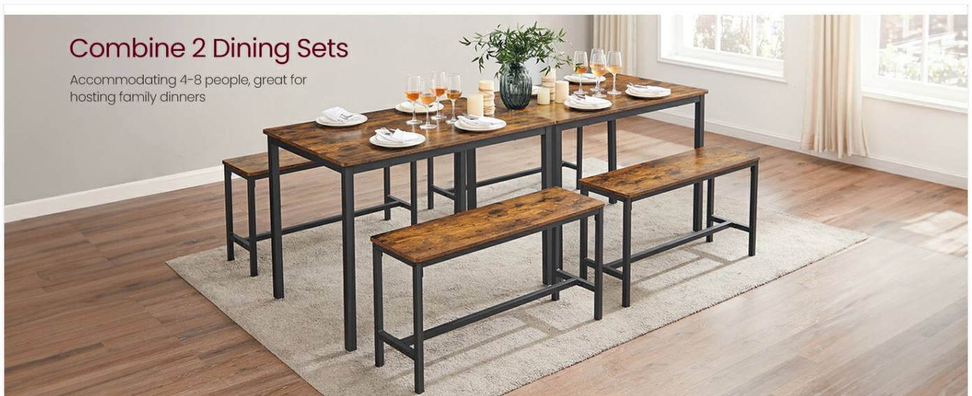
Image 5.2: Two dining sets combined to accommodate a larger group of 4-8 people, ideal for hosting.