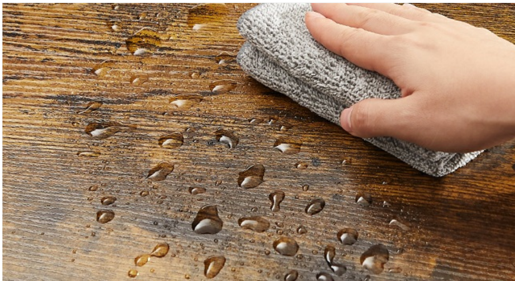
Image 6.1: Demonstrating the easy-to-clean surface of the tabletop.