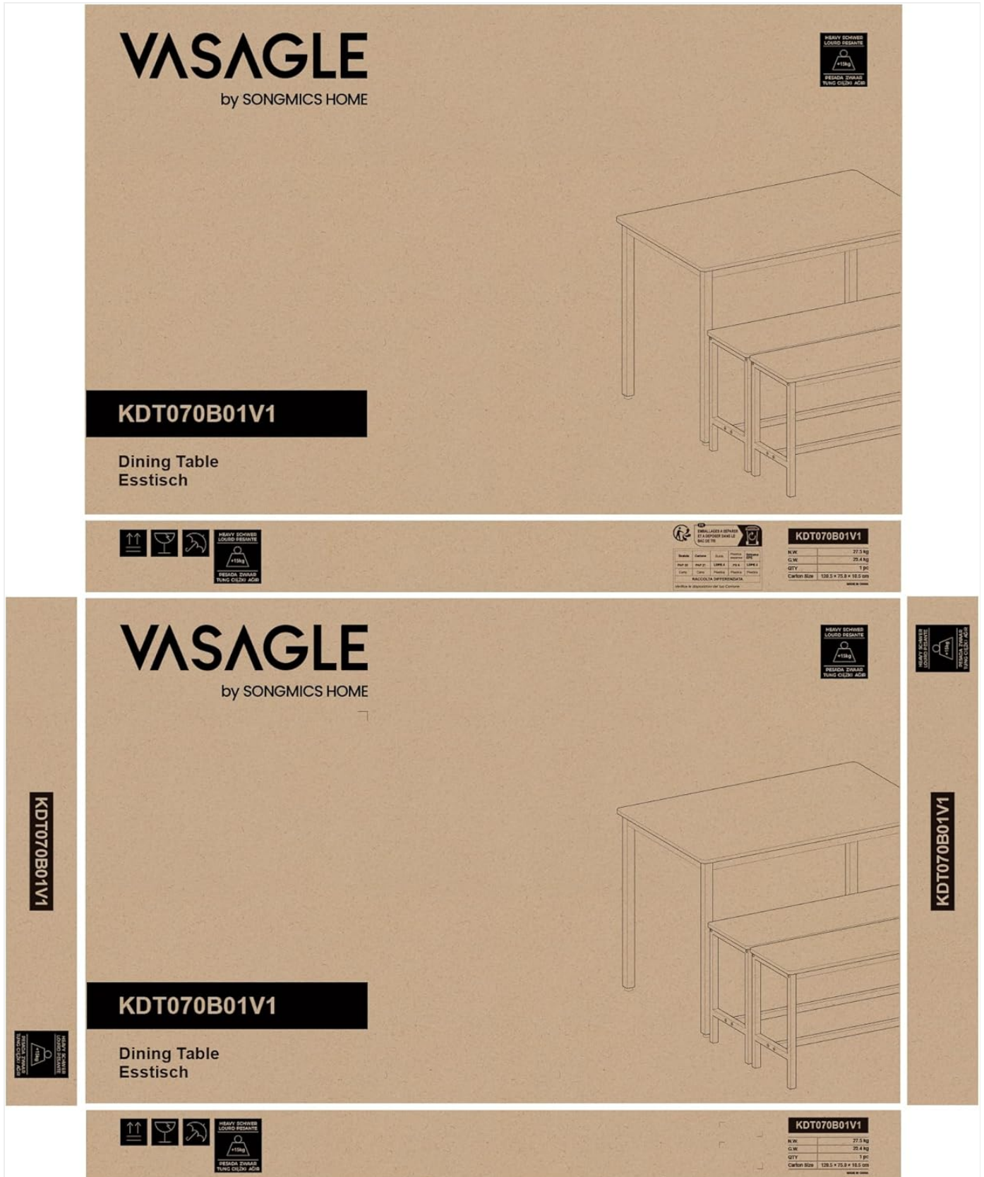
Image 3.1: Example of product packaging, indicating model number KDT070B01V1.