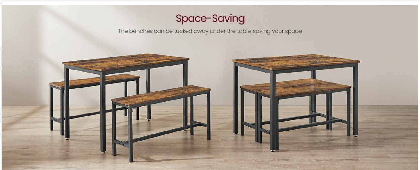
Image 5.1: The dining set demonstrating its space-saving capability, with benches stored under the table.