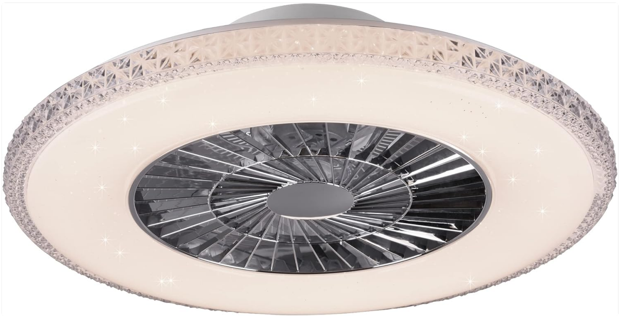
Figure 2.1: Reality Harstad LED Ceiling Fan with Light (Front View)