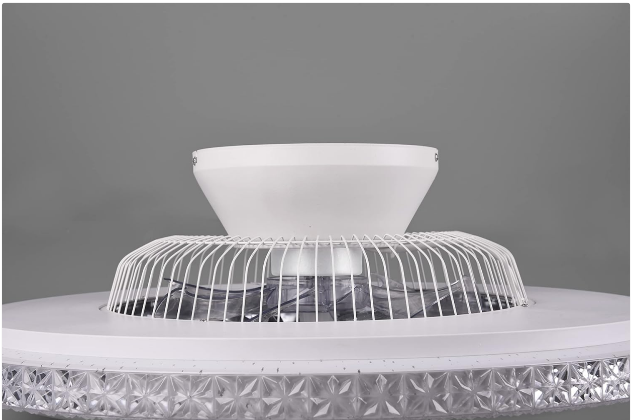
Figure 5.1: Fan Blades and Grille