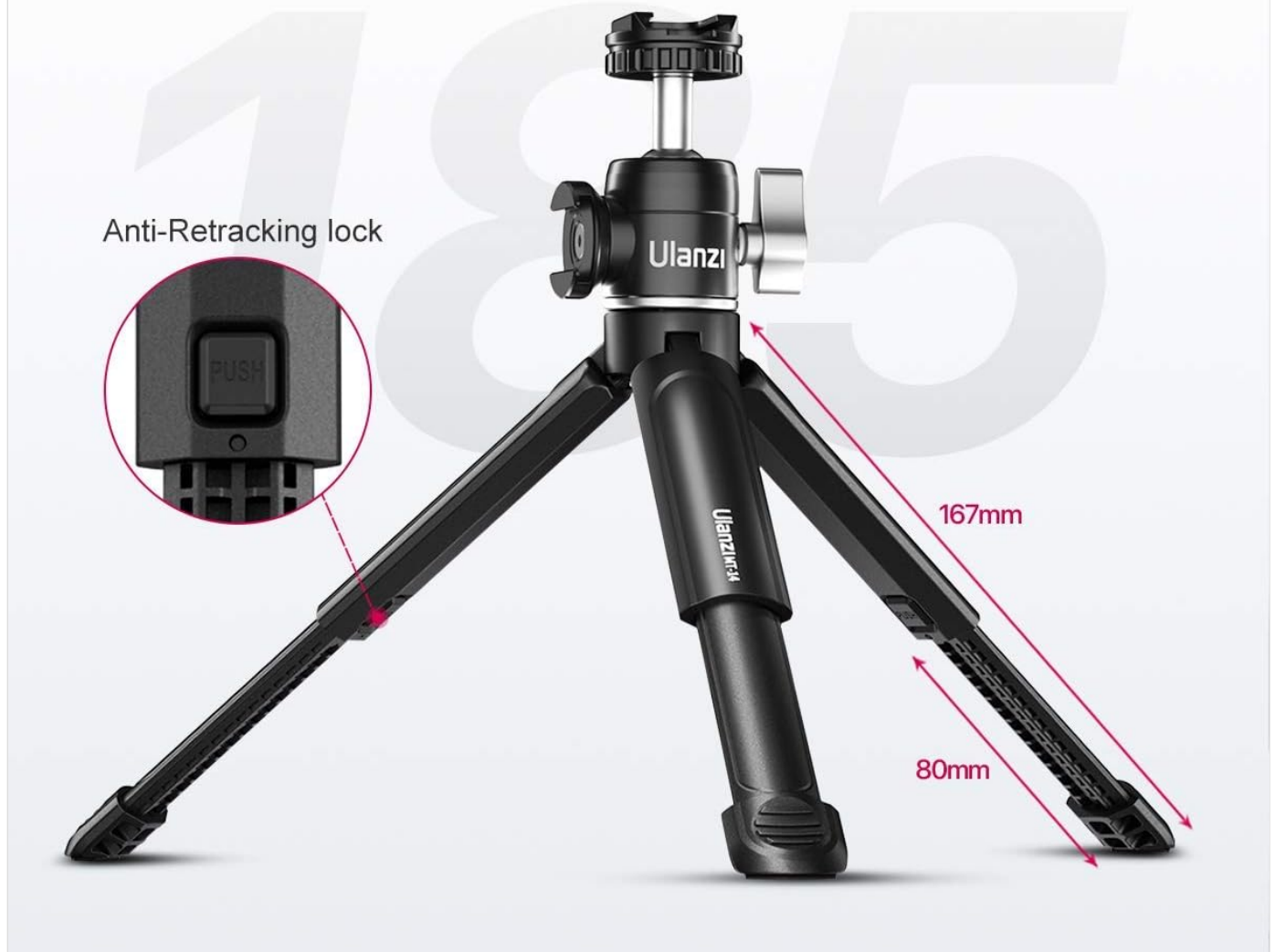
Image: ULANZI Mini Camera Tripod with its legs extended, highlighting the anti-retracting lock button.

Tripod + Ballhead Only Weight 185g Not only lightweight, but also functional