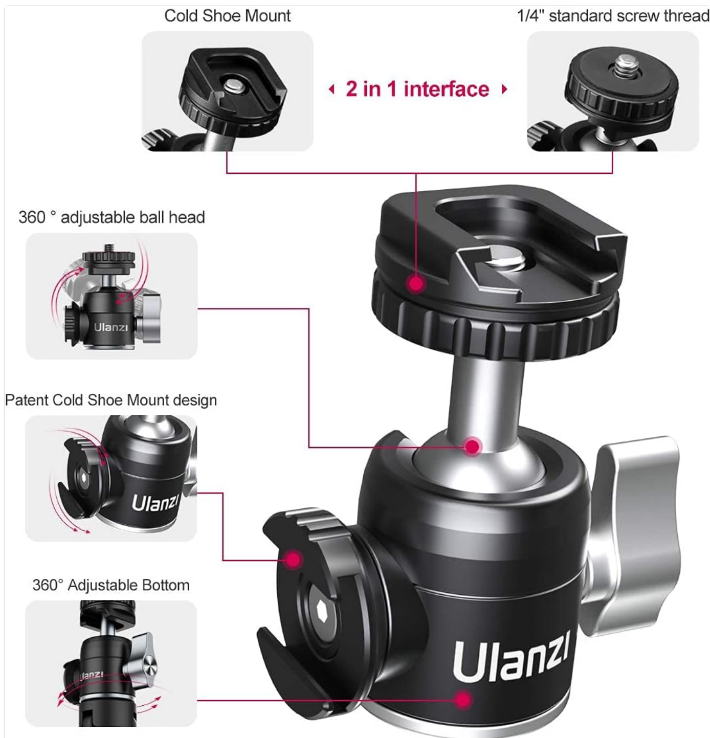
Image: Detailed view of the ULANZI tripod's 360° adjustable ball head and cold shoe mounts.

3. Once the desired angle is achieved, tighten the knob clockwise to lock the position securely.