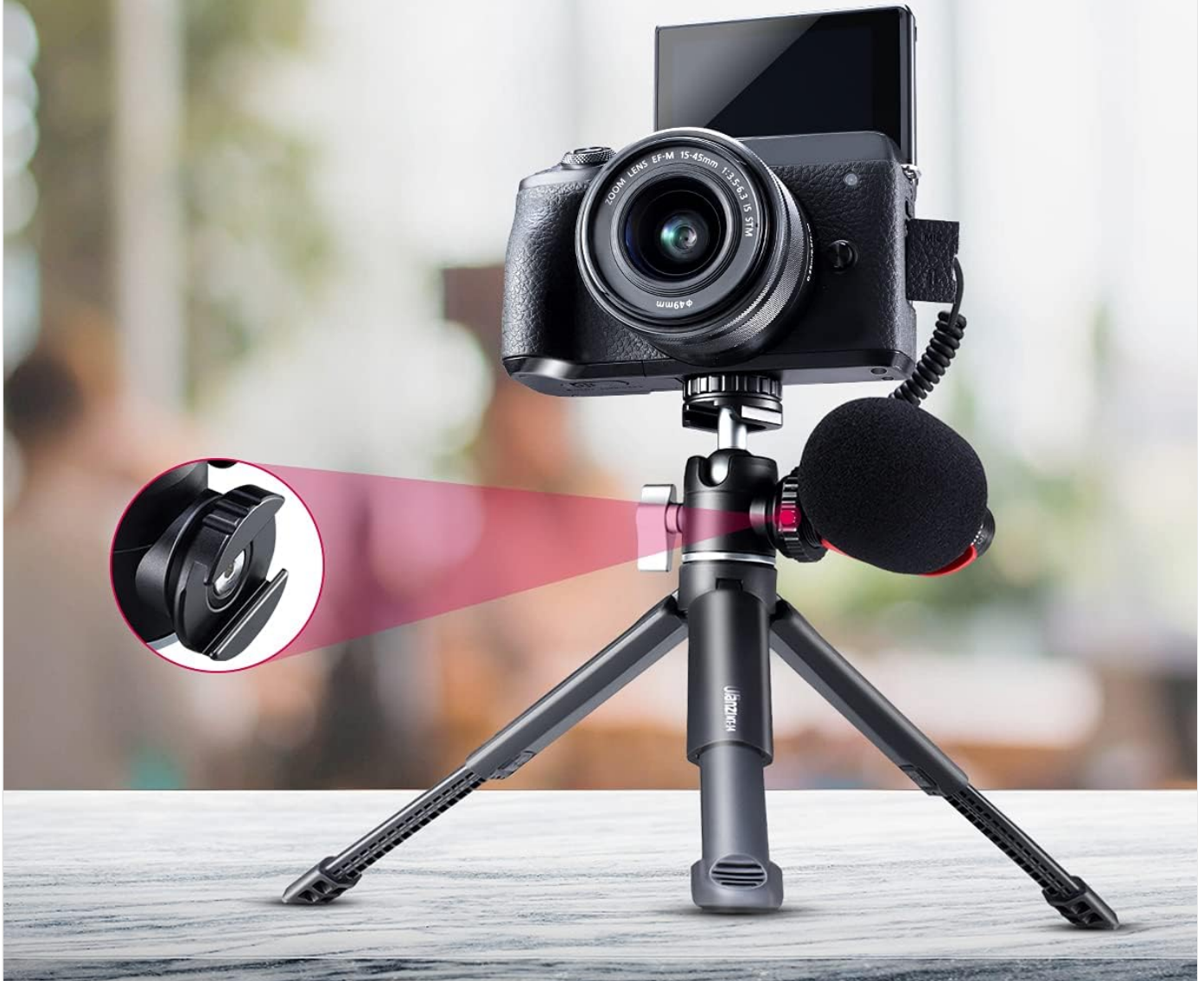
Image: ULANZI Mini Camera Tripod with a microphone attached to its rotatable cold shoe mount, demonstrating its creative dual cold shoe ballhead design.

Ulanzi Patented Design, Solve Vlog Camera Microphone Problems