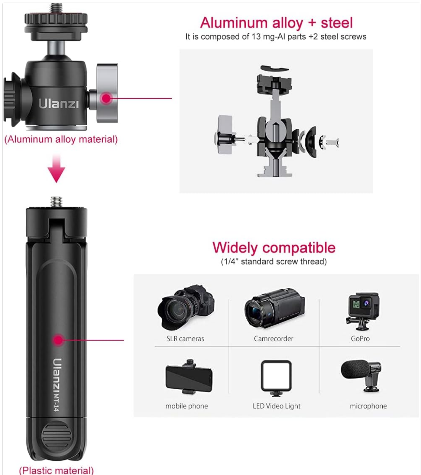
Image: ULANZI Mini Camera Tripod with a camera mounted, illustrating device attachment.