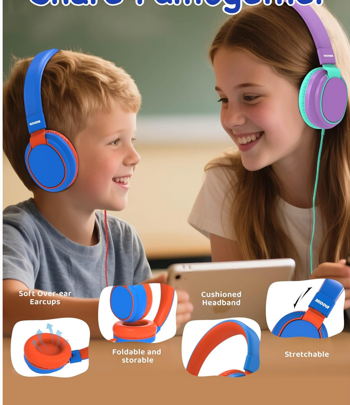
Image: Two children enjoying content with MIDOLA Kids Wired Headphones, highlighting the comfortable over-ear design and shared experience.