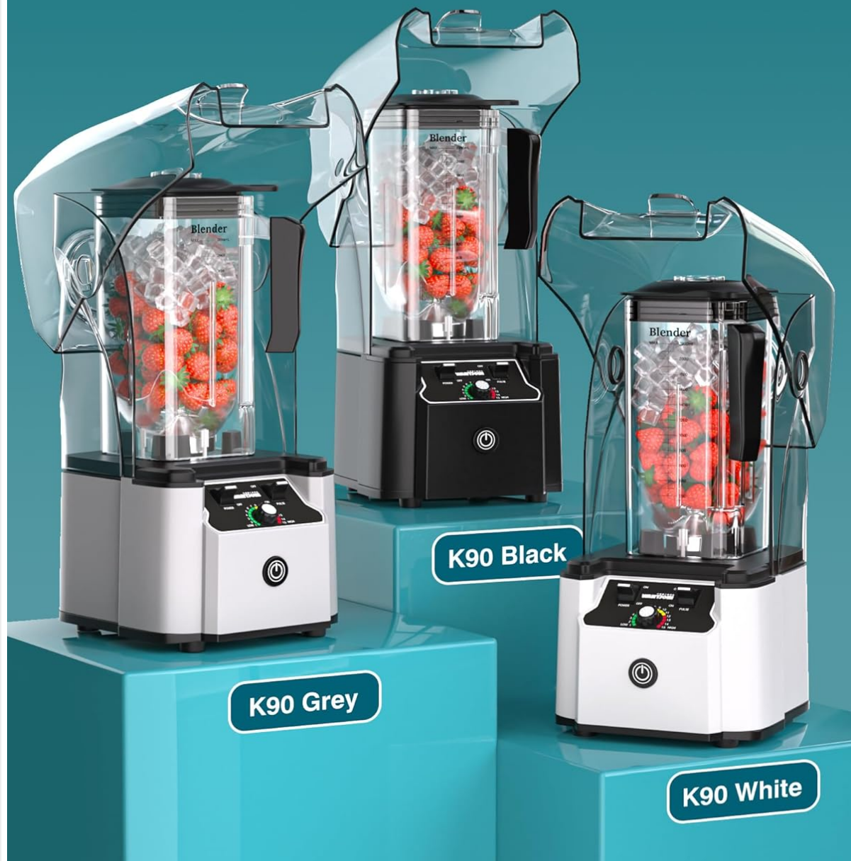
Figure 2: The replacement pitcher is compatible with WantJoin K90 Black, K90 Grey, and K90 White blender models.

Ideal Match with Exclusive Blender Model