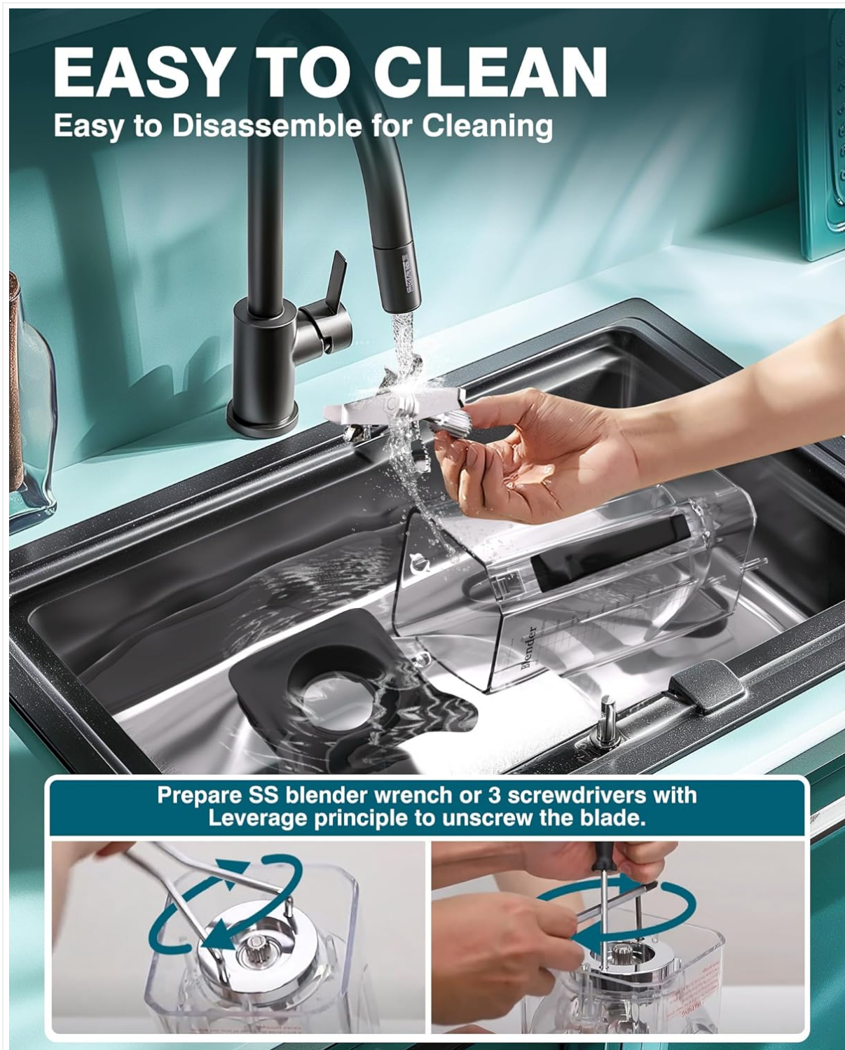
Figure 6: Instructions for disassembling the blade for comprehensive cleaning.