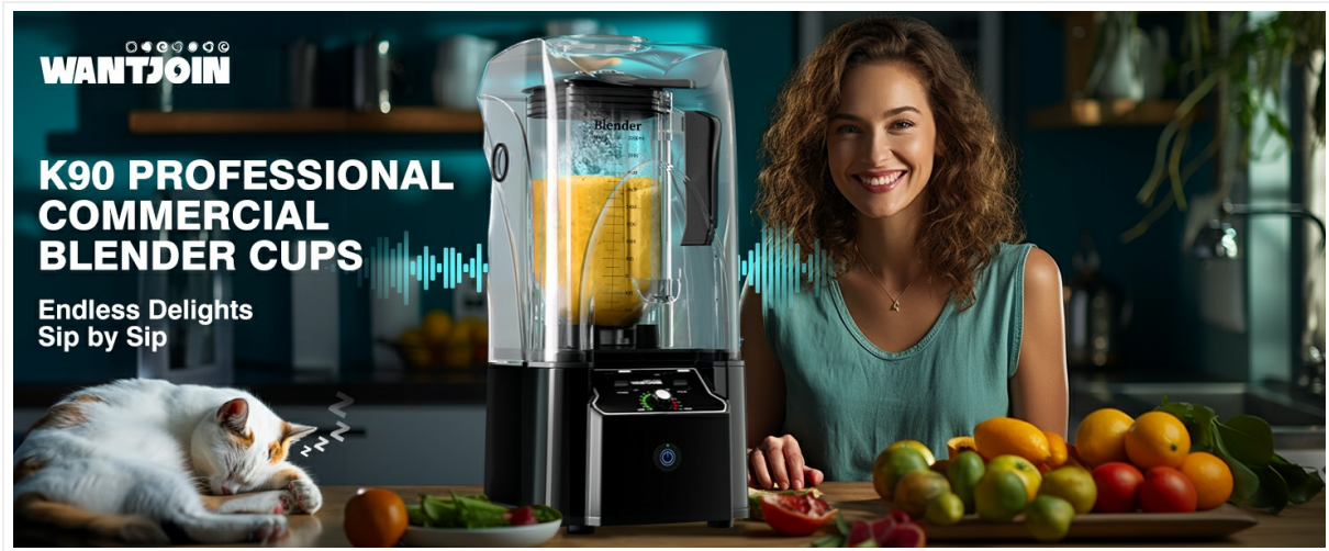
Figure 3: The 2200ml capacity pitcher, ideal for preparing multiple servings.