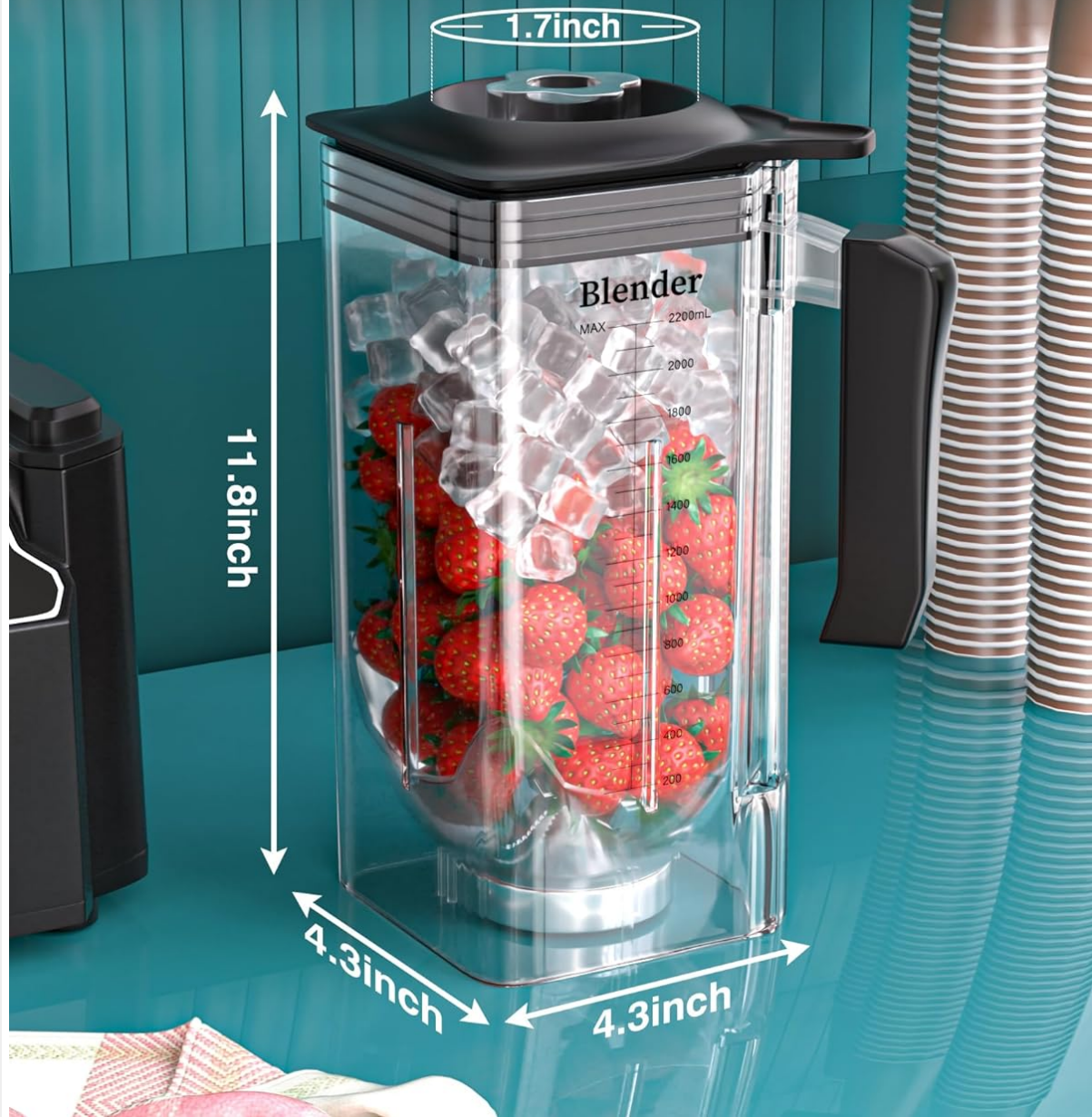
Figure 7: Detailed product dimensions of the replacement pitcher.