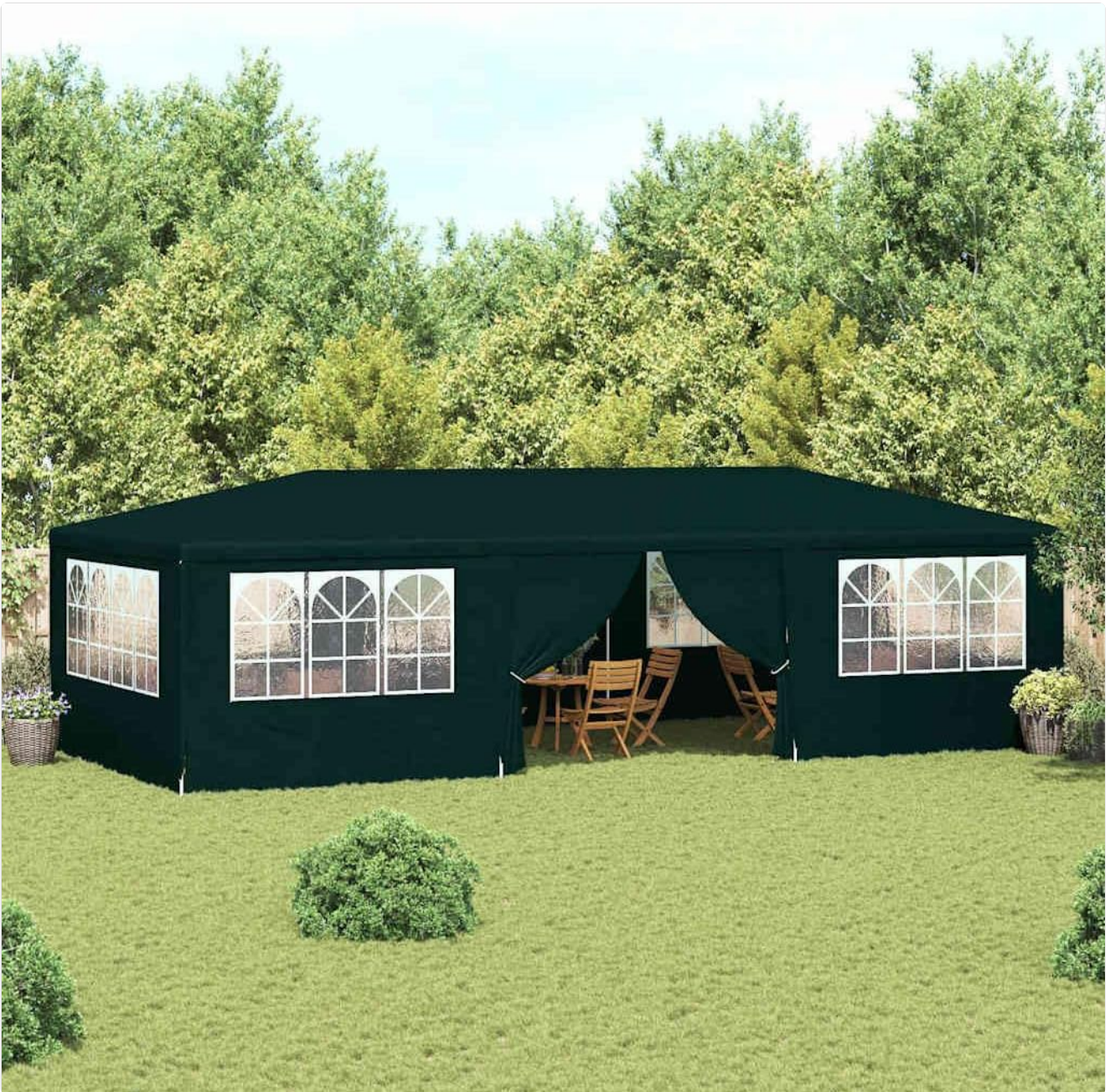
Figure 1: Assembled vidaXL Professional Party Tent 4x9m Green. This image shows the complete tent set up in a garden, highlighting its size and design with side windows and an open entrance.