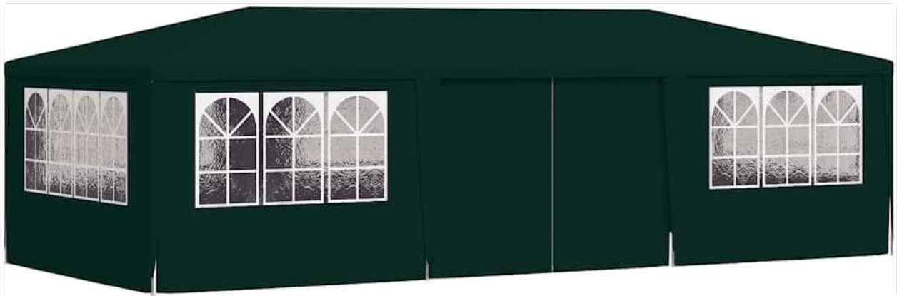
Figure 3: Party tent with side panels. This image shows the tent with all side panels attached, including those with windows.