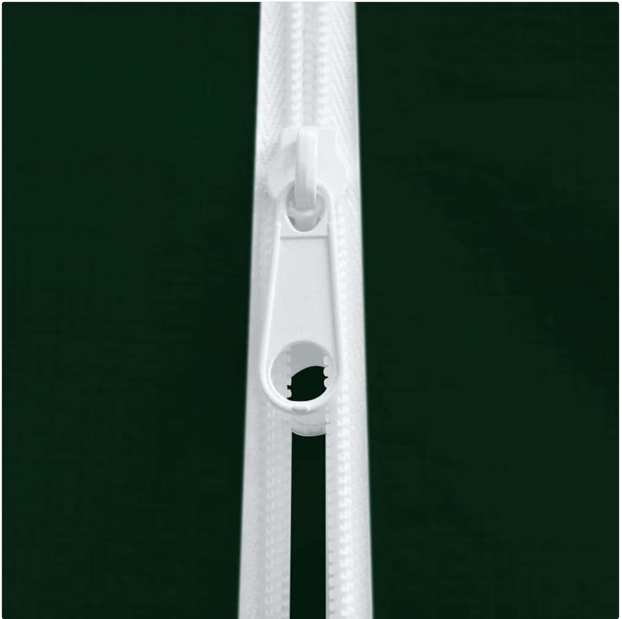
Figure 4: Detail of the zippered door. This image highlights the zipper mechanism for the tent's entrance.