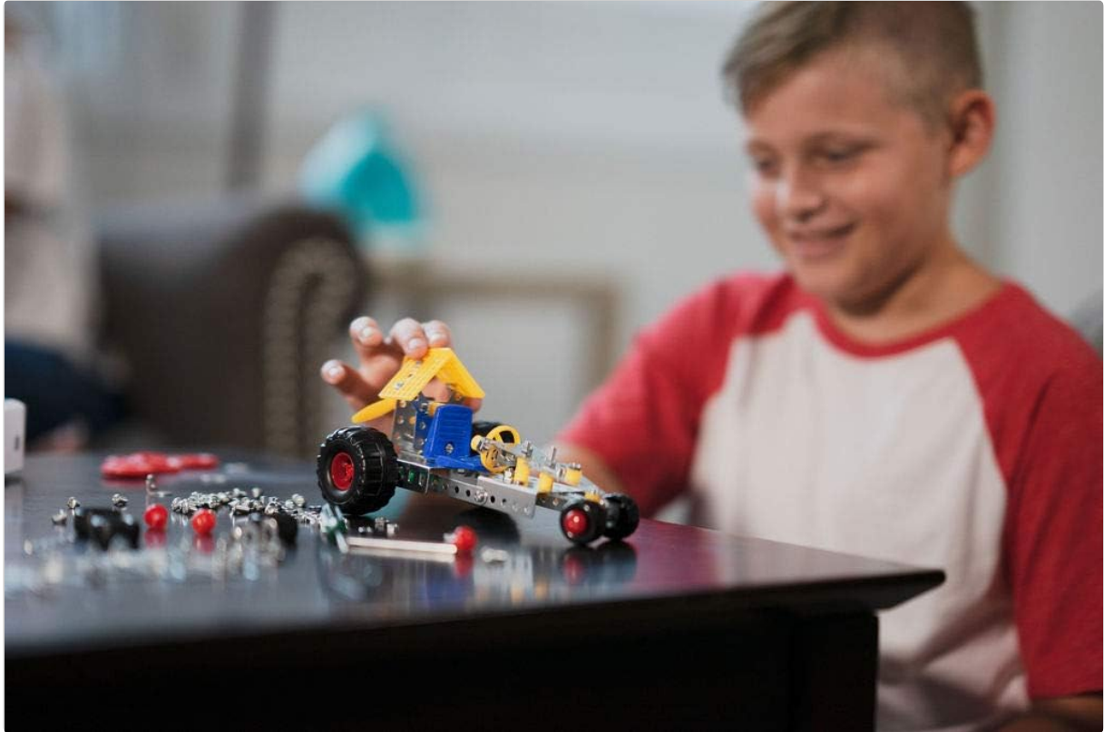
Image: A young boy smiles proudly as he holds up a completed metal car model, showcasing his successful assembly of the erector set. The car features red wheels and a yellow spoiler.