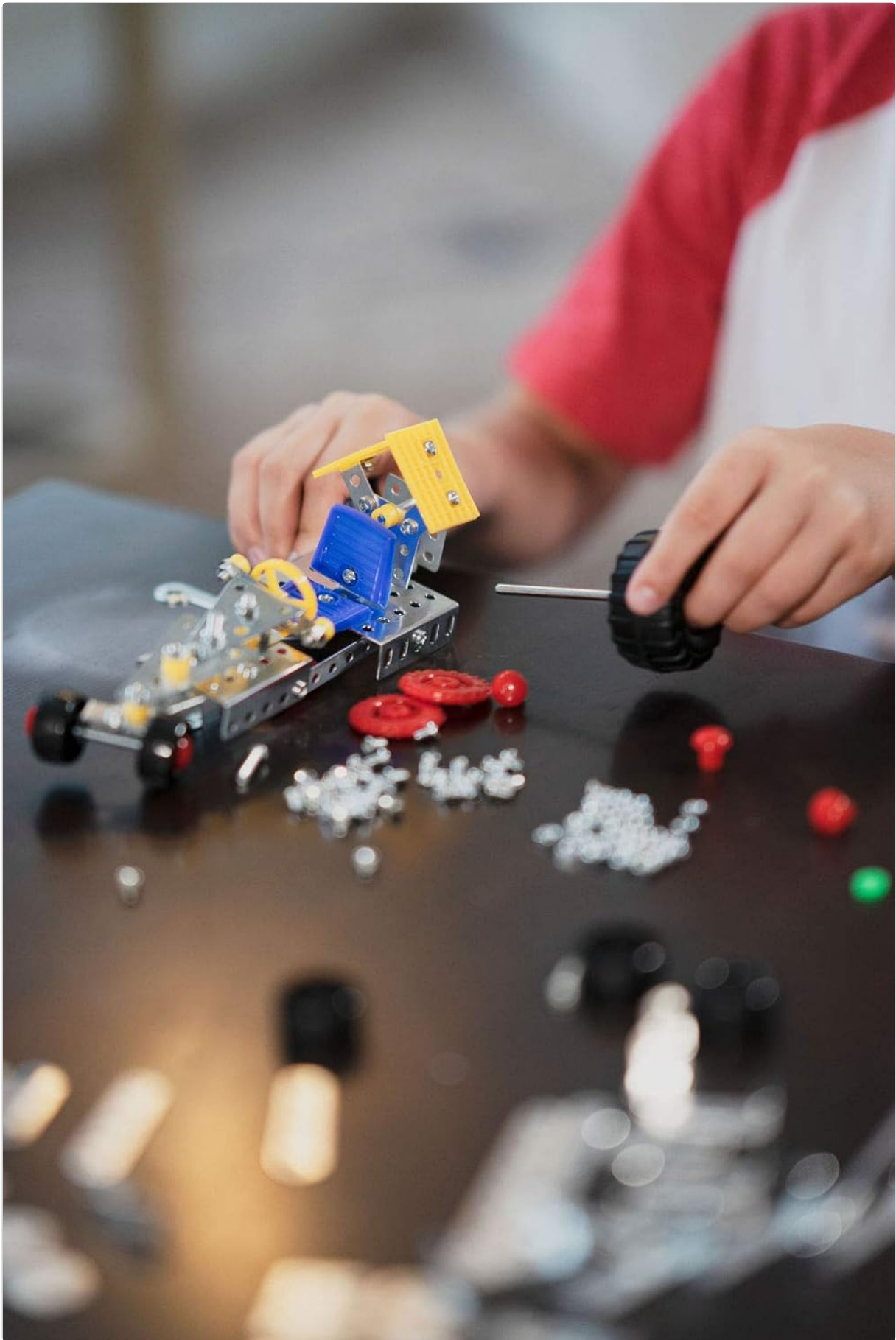
Image: A child is deeply concentrated on building a metal car model, carefully attaching a wheel to the chassis. Various other metal and plastic pieces are spread across the wooden table, indicating an ongoing construction project.