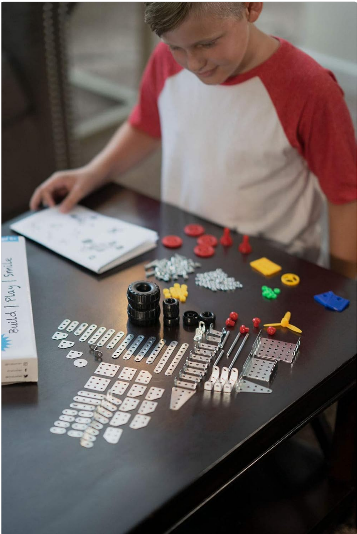
Image: A child carefully observes the diverse components of the MALUVRIAN erector set, including metal plates, screws, nuts, wheels, and plastic accessories, spread across a wooden table.

The set encourages hands-on learning and provides a tangible experience in engineering and mechanics. With 236 pieces, the possibilities for construction are extensive, promoting both guided building and imaginative free play.