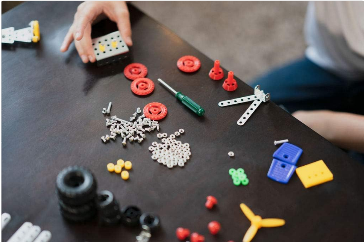
Image: An assortment of metal and plastic building components, such as perforated plates, small screws, nuts, and a green screwdriver, are organized on a dark wooden surface, ready for assembly.

If any parts are missing or damaged, please contact MALUVRIAN customer support for assistance.