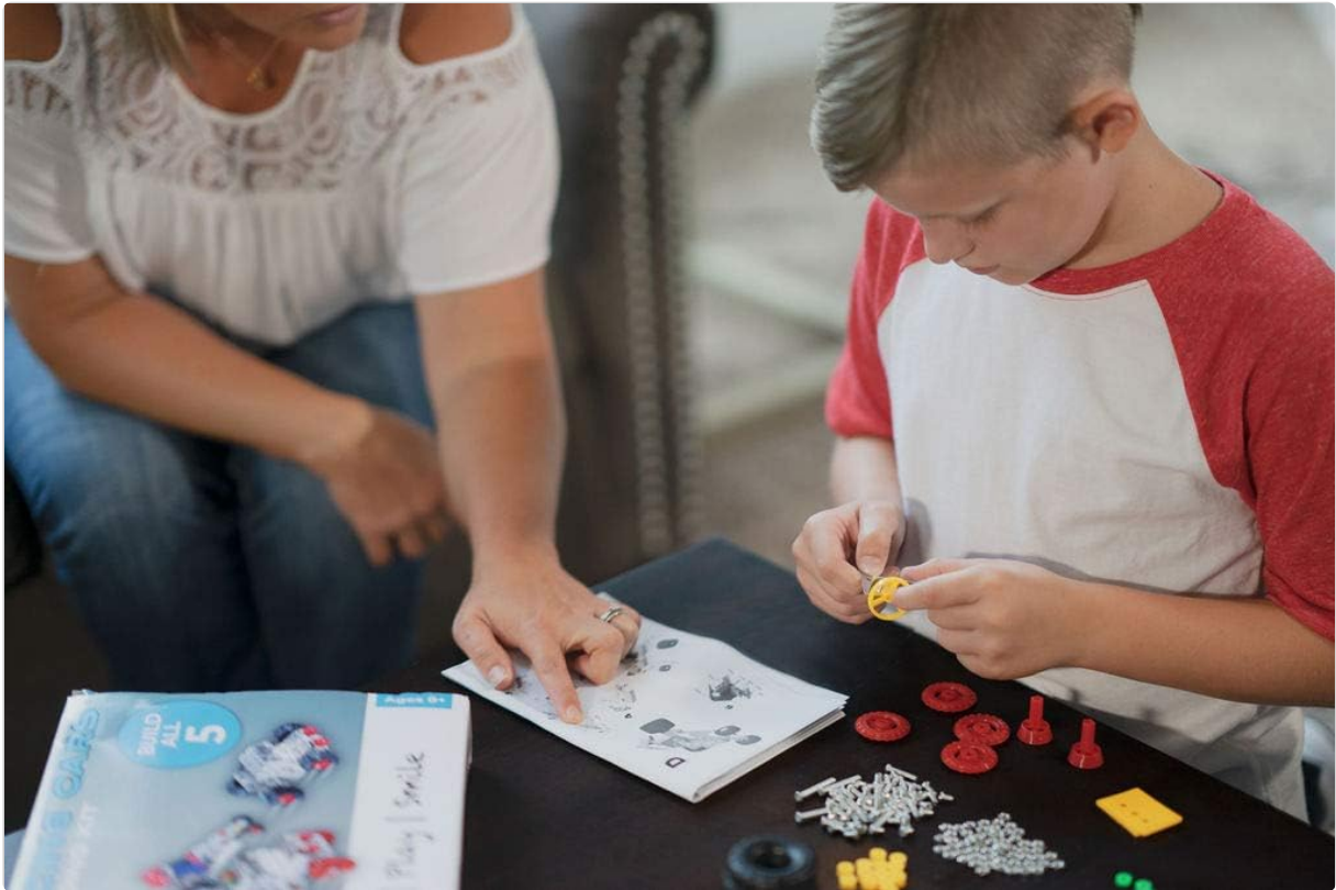
Image: An adult and a child are engaged in building, with the adult pointing to a diagram in the instruction manual while the child holds a yellow plastic piece, demonstrating collaborative learning.