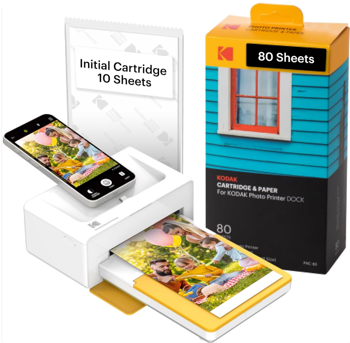
Image: KODAK Dock Plus printer in use, showcasing its compact design and direct printing capability.