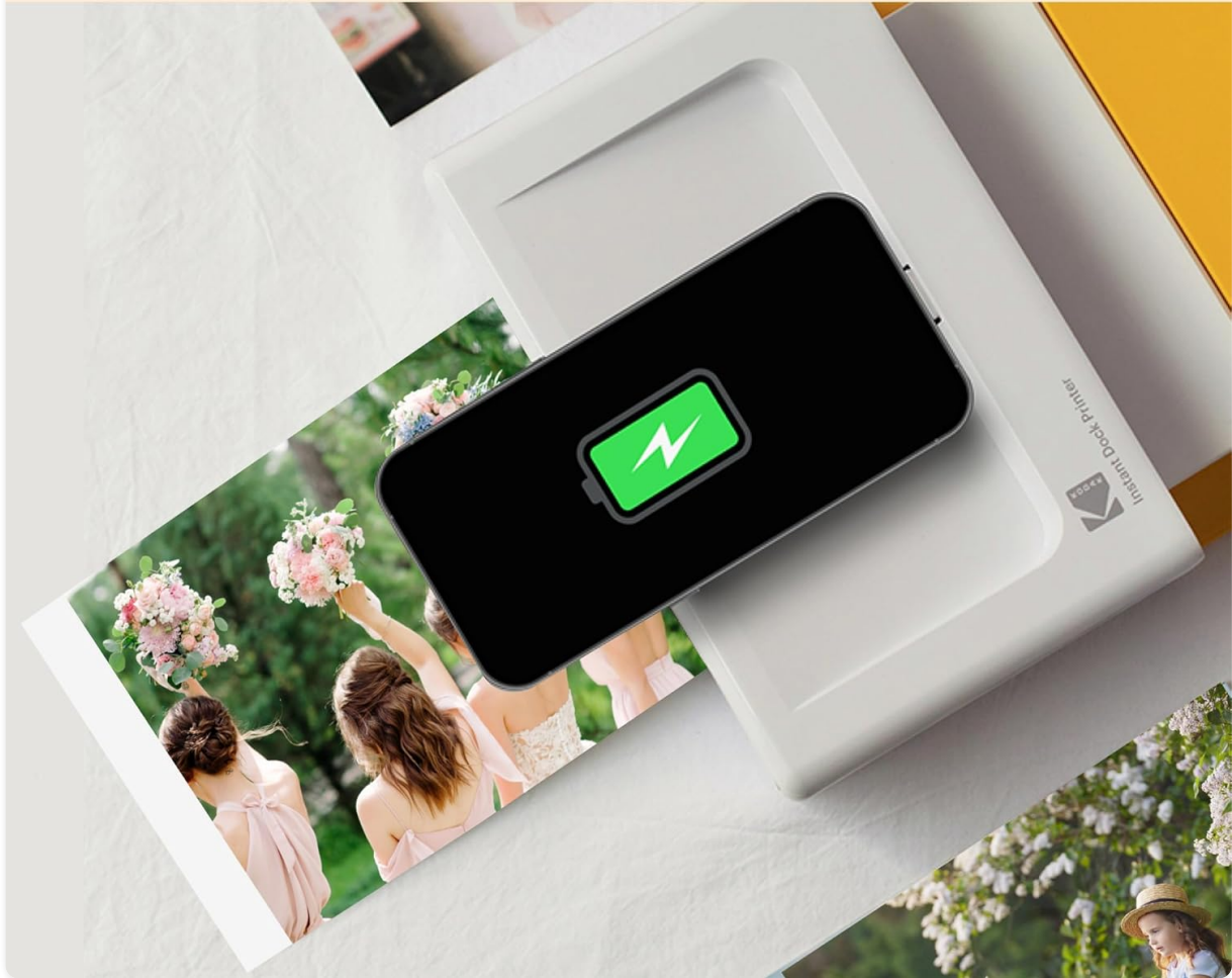
Image: The KODAK Dock Plus printer simultaneously charging a smartphone and printing a photo.