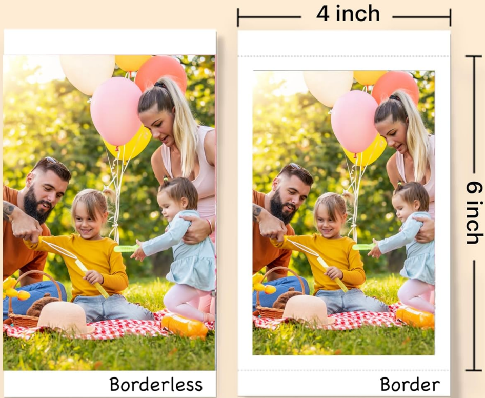
Image: Two 4x6 inch photos demonstrating the difference between borderless and bordered prints.