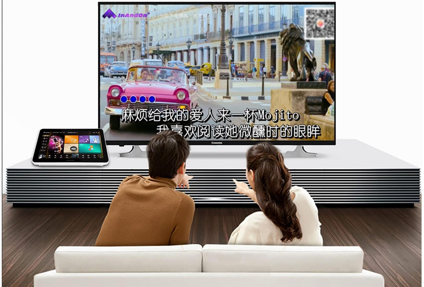
Image Description: This image highlights the intelligent AI voice control feature. It shows a user interacting with the system by speaking commands to order songs, with the interface displaying the voice recognition in action.