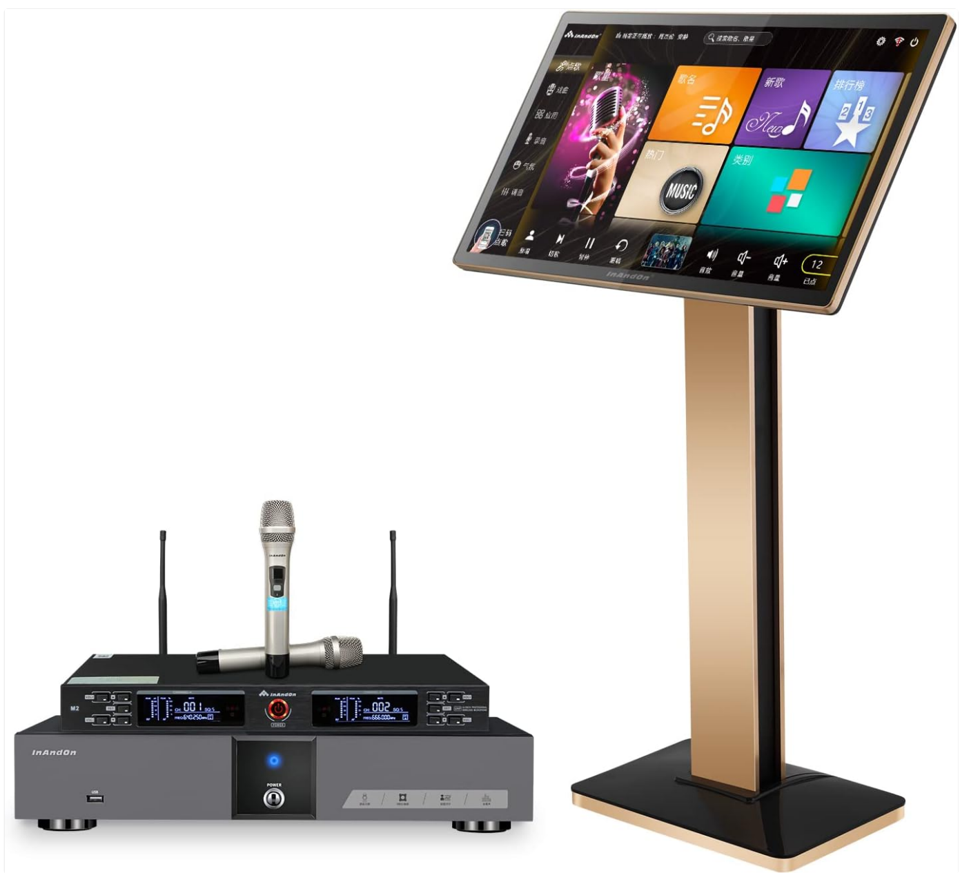
Image Description: This image shows the complete InAndOn KV-V5 Pro karaoke system, including the 21.5-inch capacitive touch screen display unit on a stand and the base unit with two wireless microphones. The touch screen displays the main KTV interface with various song selection options and controls.