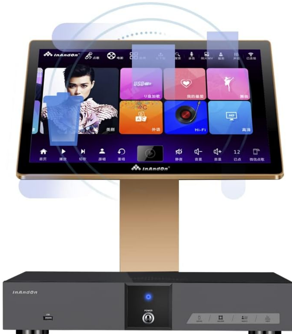
Image Description: This image illustrates the intelligent song deletion feature, showing the system interface managing hard drive space by automatically removing less frequently played songs when storage is low.

Intelligently delete long-term unclicked songs according to the upper limit of hard disk storage