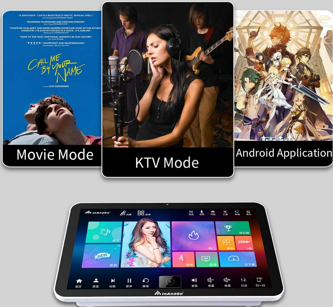
Image Description: This image illustrates the system's capability to switch between different modes: "Movie Mode," "KTV Mode," and "Android Application." This indicates the dual-system functionality of the device, allowing users to choose between karaoke and other multimedia functions.

Meet different kinds of people's need and give you a better experience