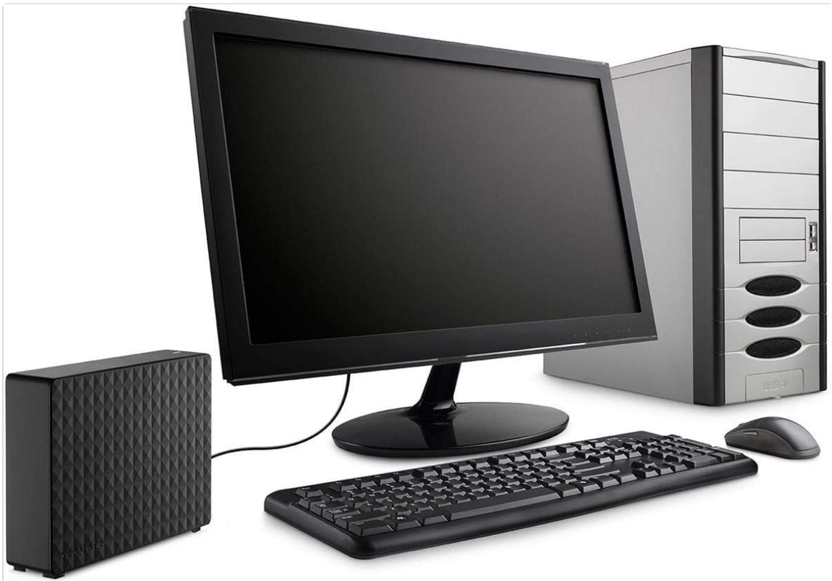
Image: The Seagate Expansion Desktop drive connected to a desktop computer setup, illustrating typical installation.