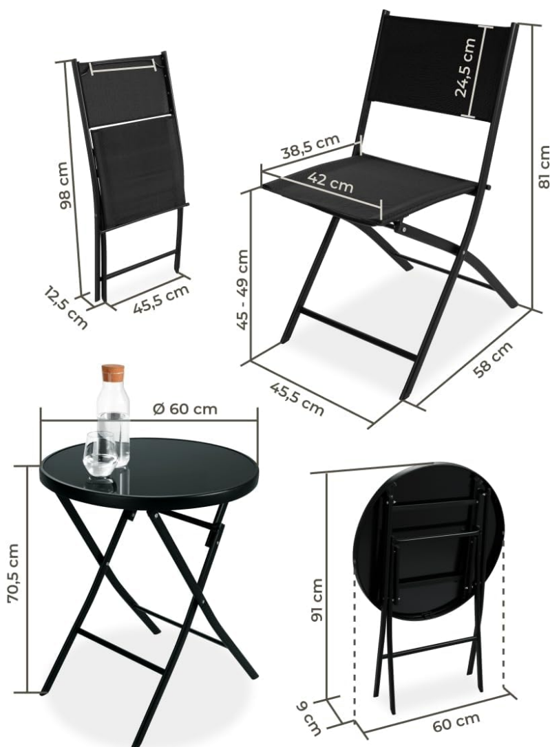
Image: A comprehensive diagram illustrating the dimensions of both the tectake folding chair and the round folding table, including folded and unfolded measurements.