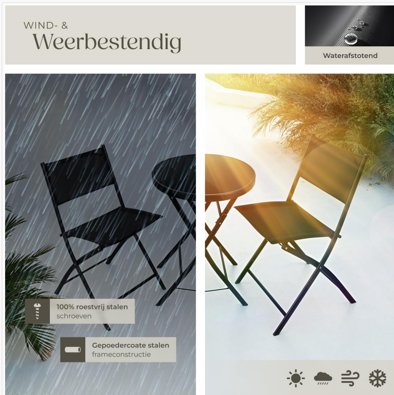
Image: Visual representation of the tectake bistro set's water-repellent properties and weather resistance, depicted in both rainy and sunny environments.

The set features a robust steel frame with stainless steel screws and weather-resistant materials. While designed for outdoor use, prolonged exposure to extreme weather conditions (heavy rain, snow, intense sun) may affect its longevity. Consider storing the set indoors or covering it during harsh weather.