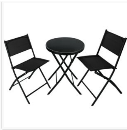
Image: A detailed view of the tectake folding table, illustrating its compact folded form and the process of extending its legs. Once unfolded, ensure all components are stable and properly balanced before use.