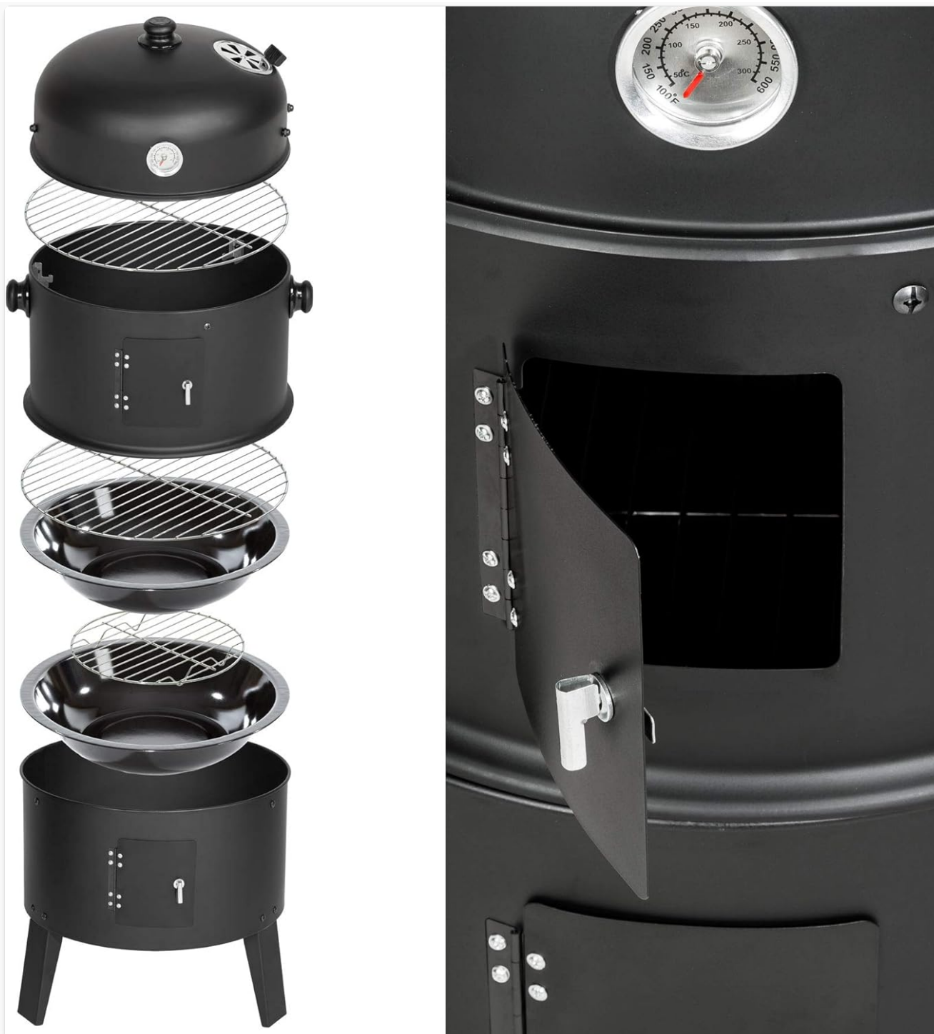
Figure 3: Exploded view illustrating the assembly order of the grill smoker components.