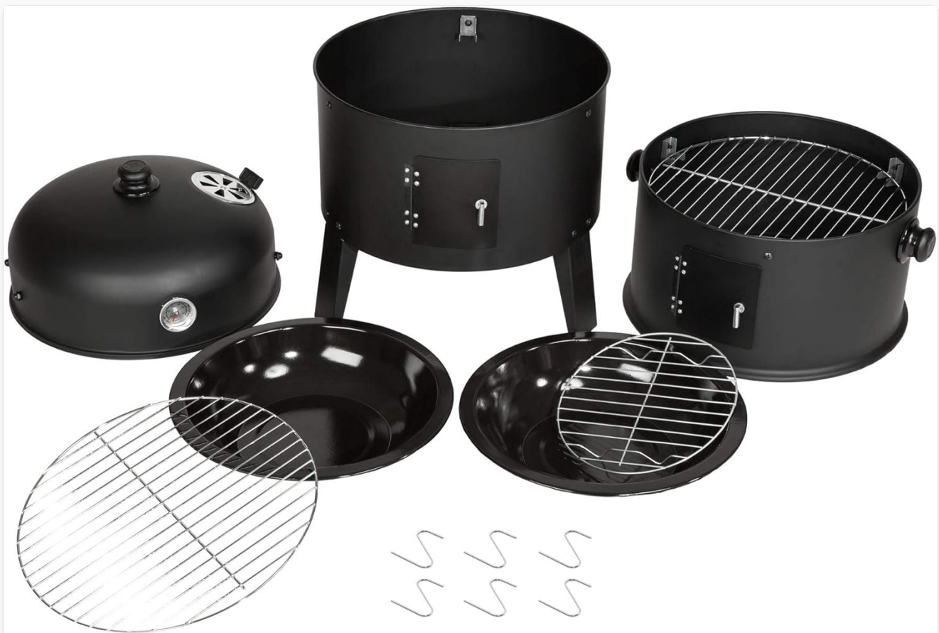
Figure 2: All components of the grill smoker laid out before assembly.