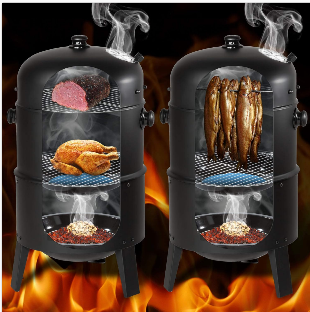
Figure 4: Illustration of the grill smoker's internal setup for roasting (left) and smoking (right).