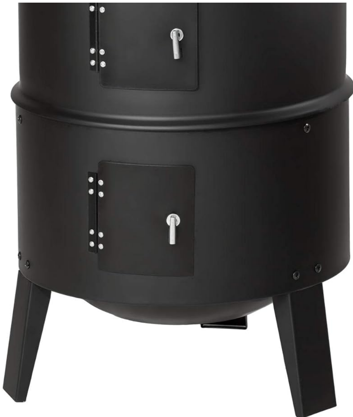
Figure 1: The tectake® XL Charcoal BBQ Grill Smoker, fully assembled.