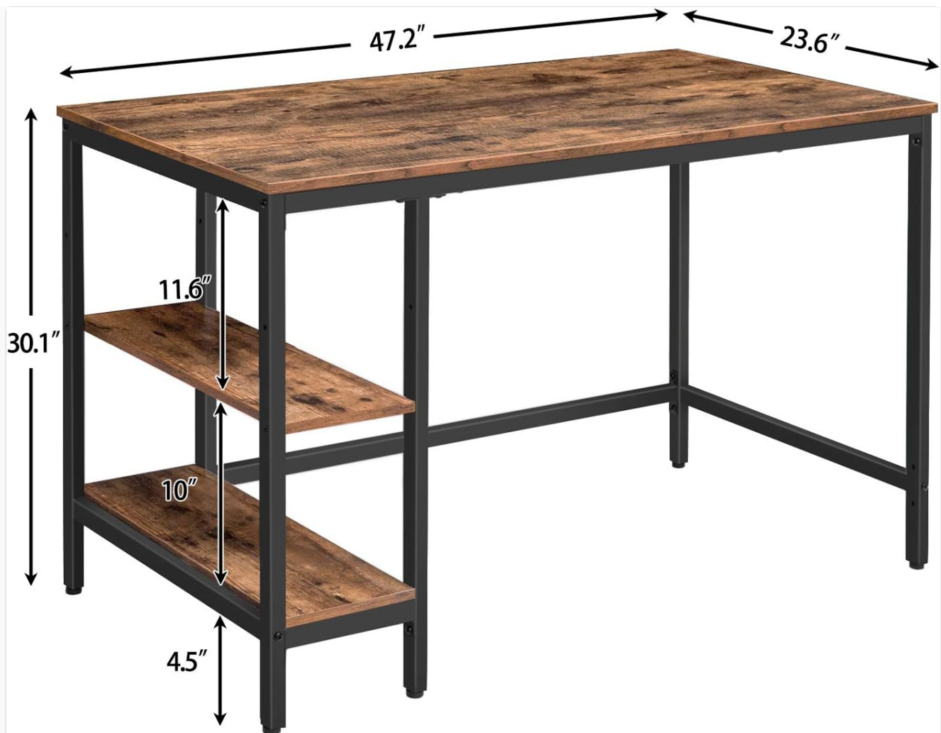
Image 8.1: A visual representation of the HOOBRO BF59DN01 Computer Desk's dimensions, including overall width (47.2"), depth (23.6"), height (30.1"), and internal shelf spacing (11.6" and 10" between shelves, 4.5" from floor to bottom shelf).