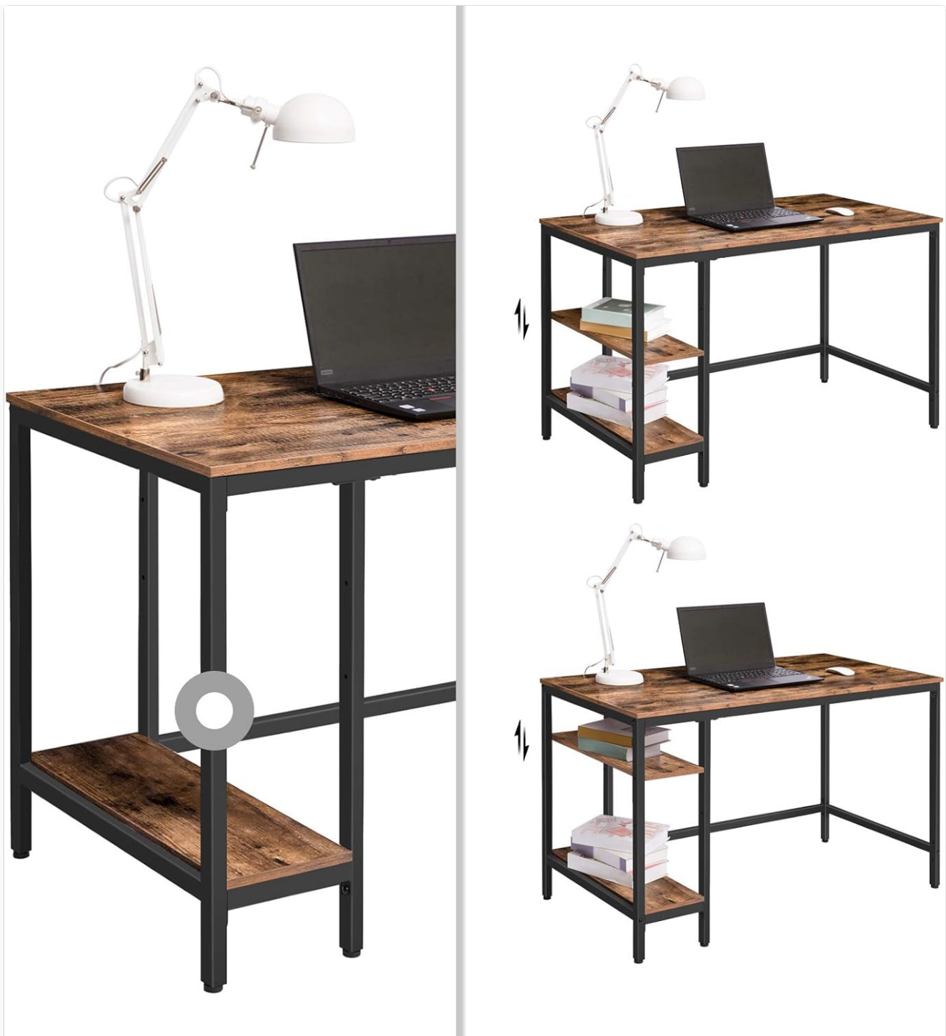
Image 4.2: A detailed view of the adjustable shelf feature, highlighting the mechanism that allows users to modify the shelf's vertical position within the desk frame.