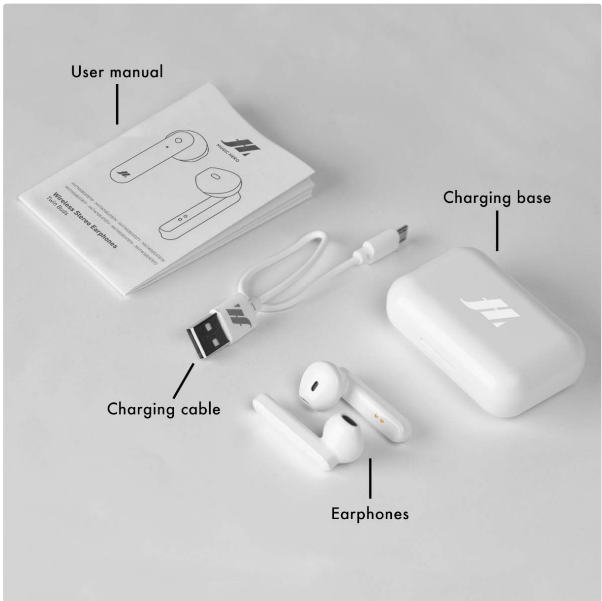
Image: Package contents showing the user manual, charging base, charging cable, and the earphones.