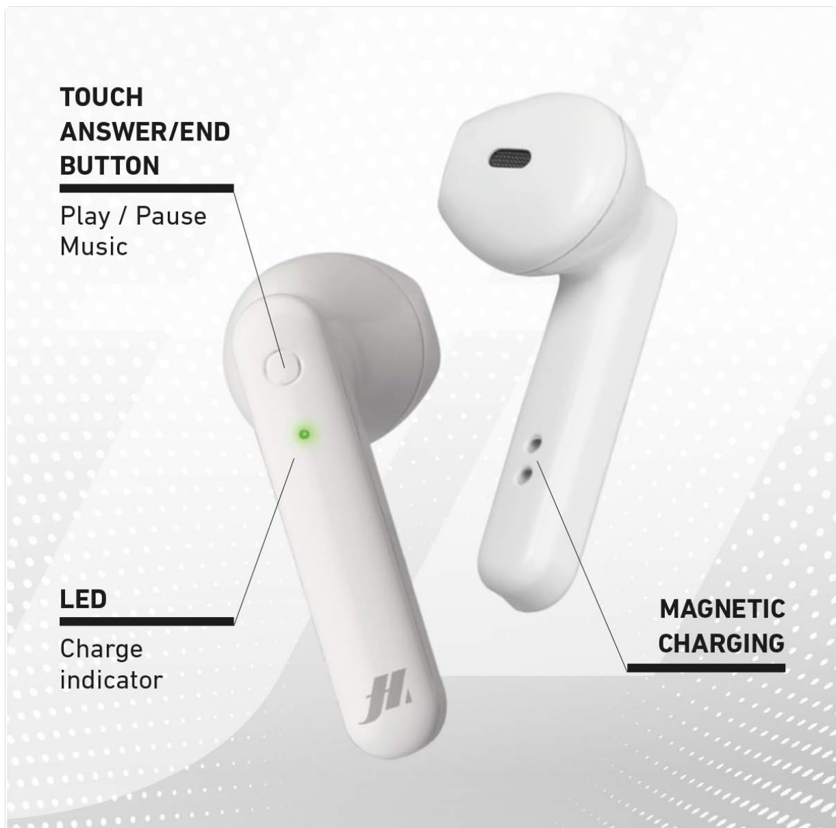
Image: Earbud features including the touch button, LED indicator, and magnetic charging points.