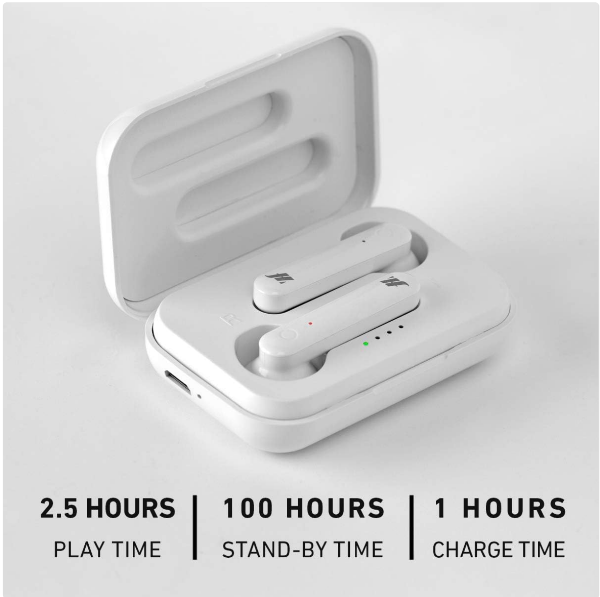
Image: Battery life and charging times for the earbuds and case.