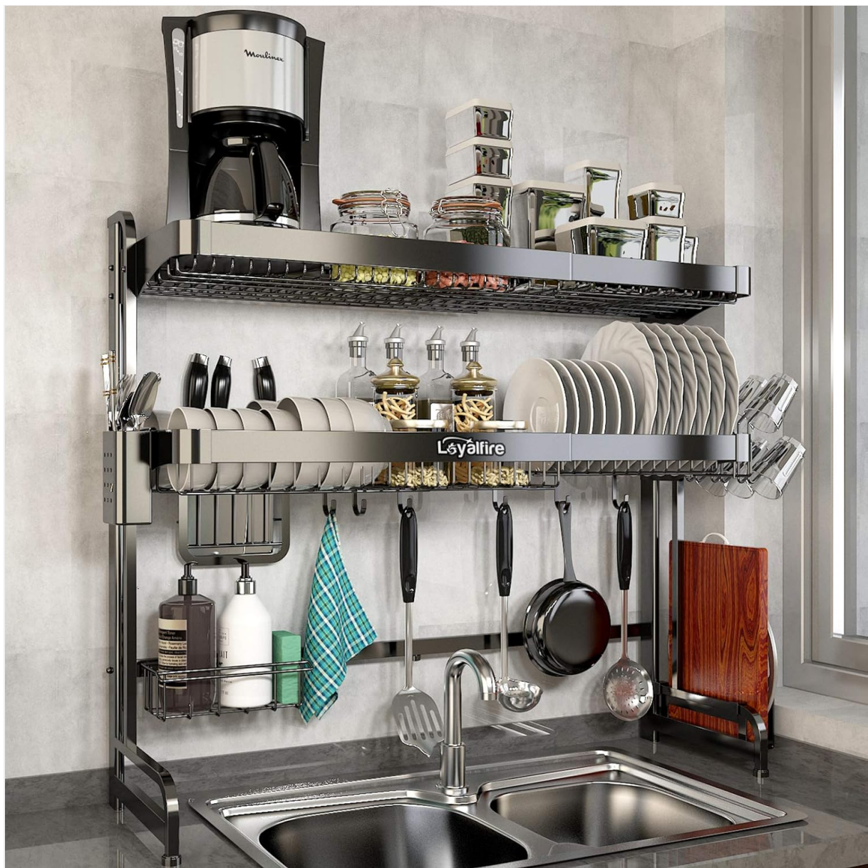
Figure 1: Fully assembled Loyalfire Over Sink Dish Drying Rack.