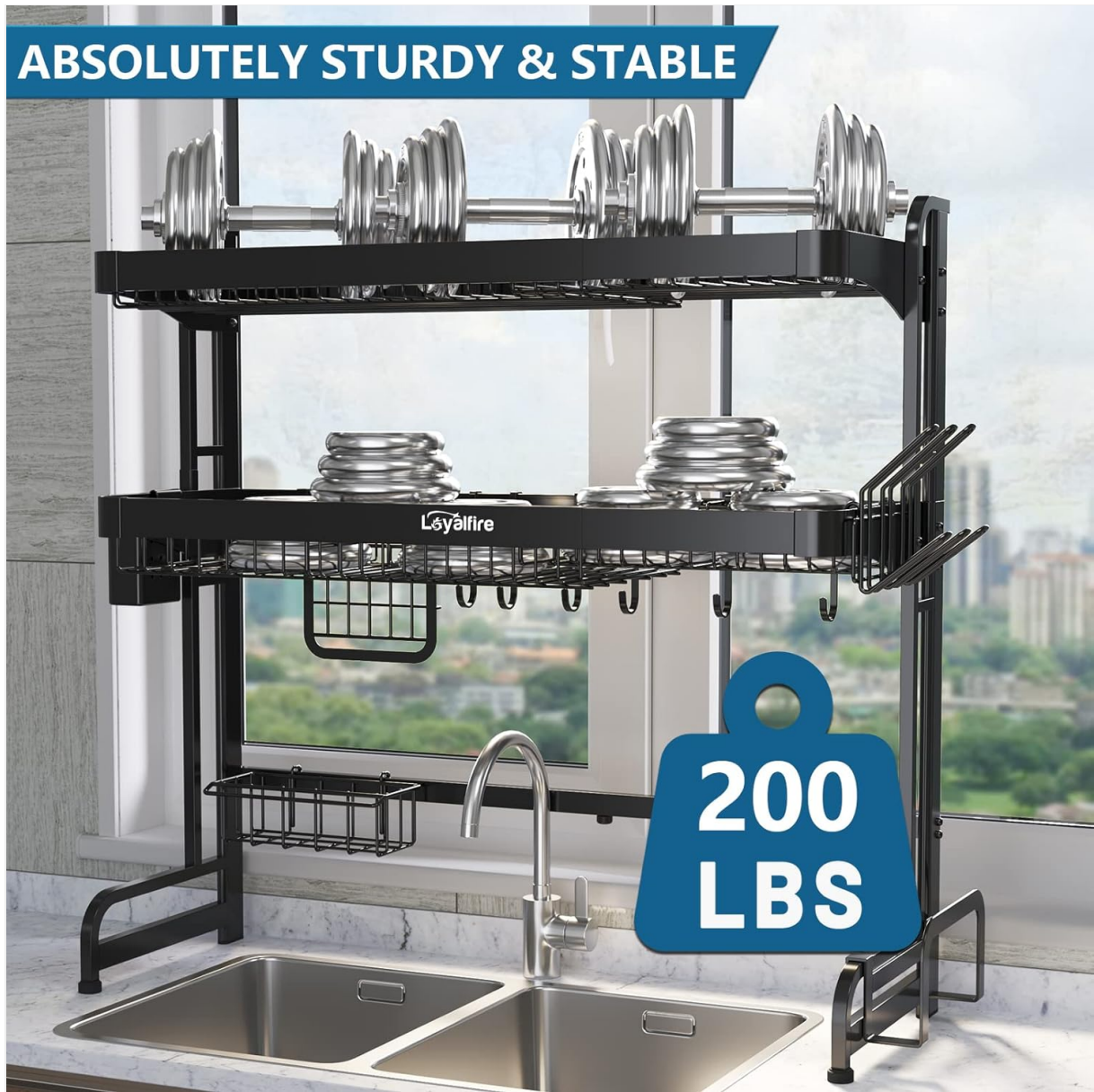
Figure 2: Demonstrating the rack's sturdy construction and 200 lbs weight capacity.