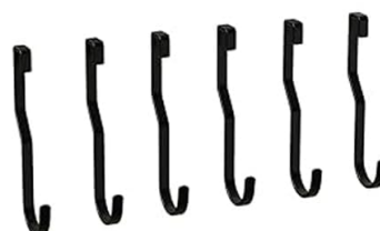
Figure 4: Included accessories for the dish drying rack.