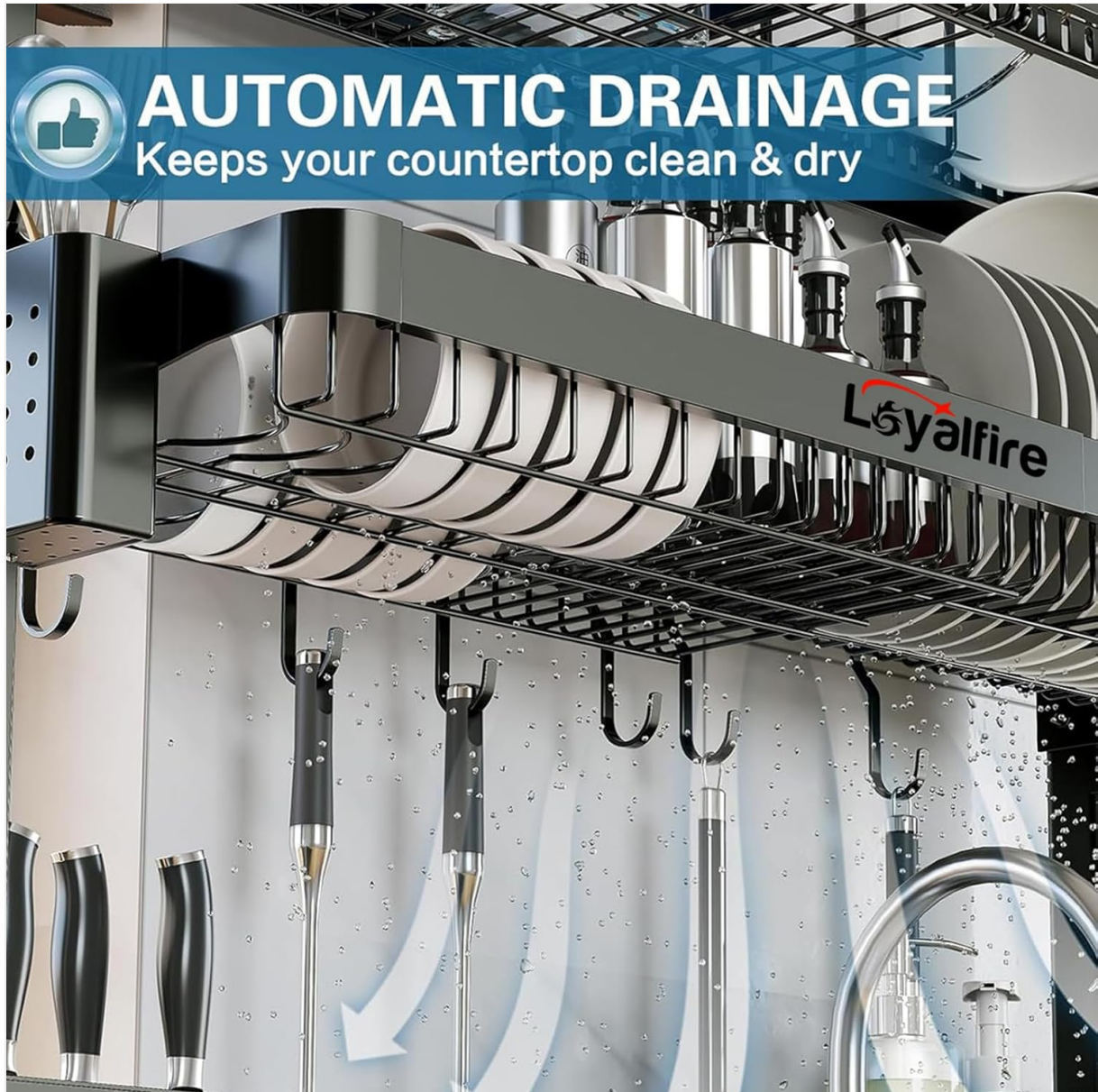
Figure 6: Automatic drainage feature helps keep the countertop dry.